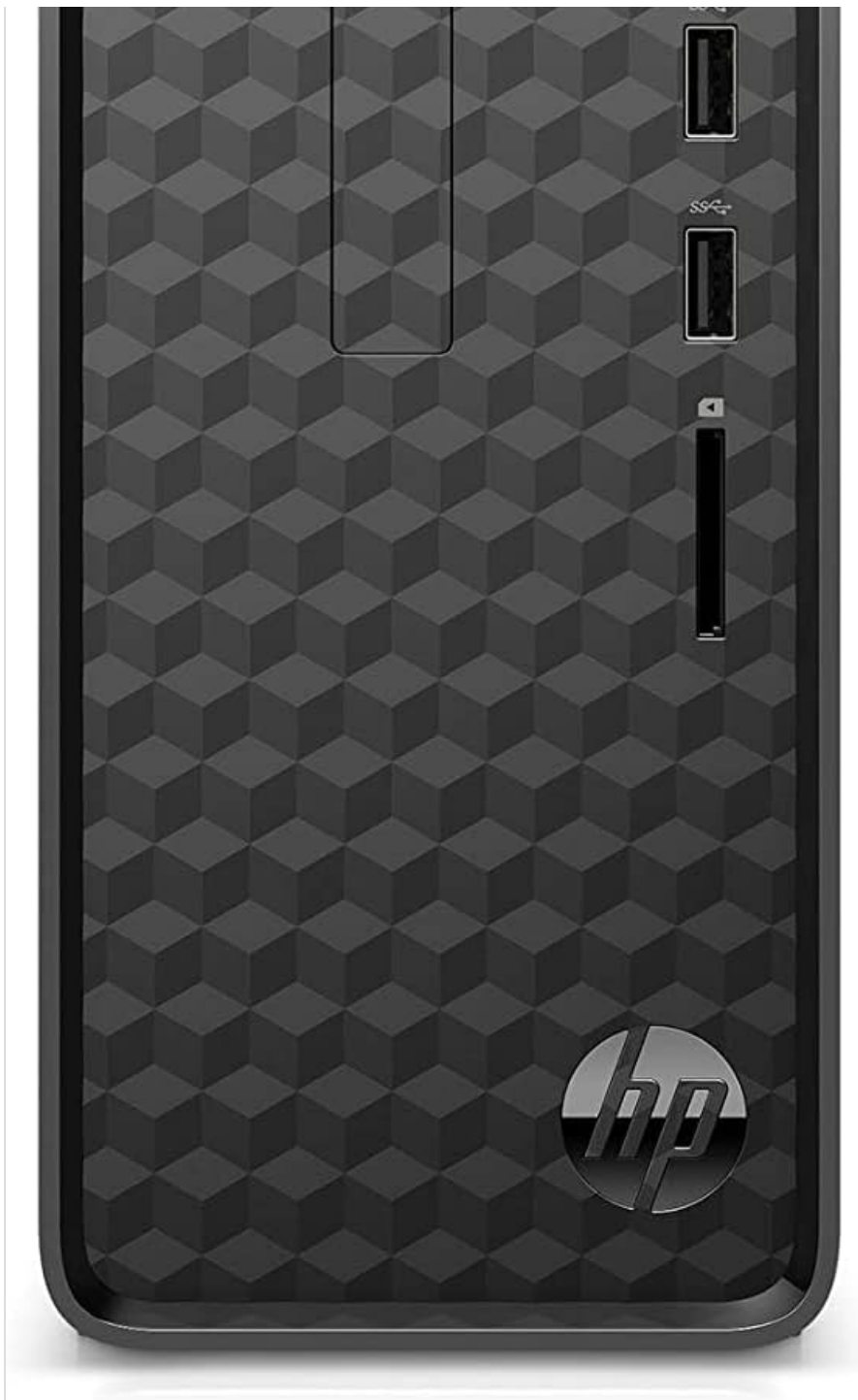
Image: Front view of the HP Slim Desktop S01-aF0011.