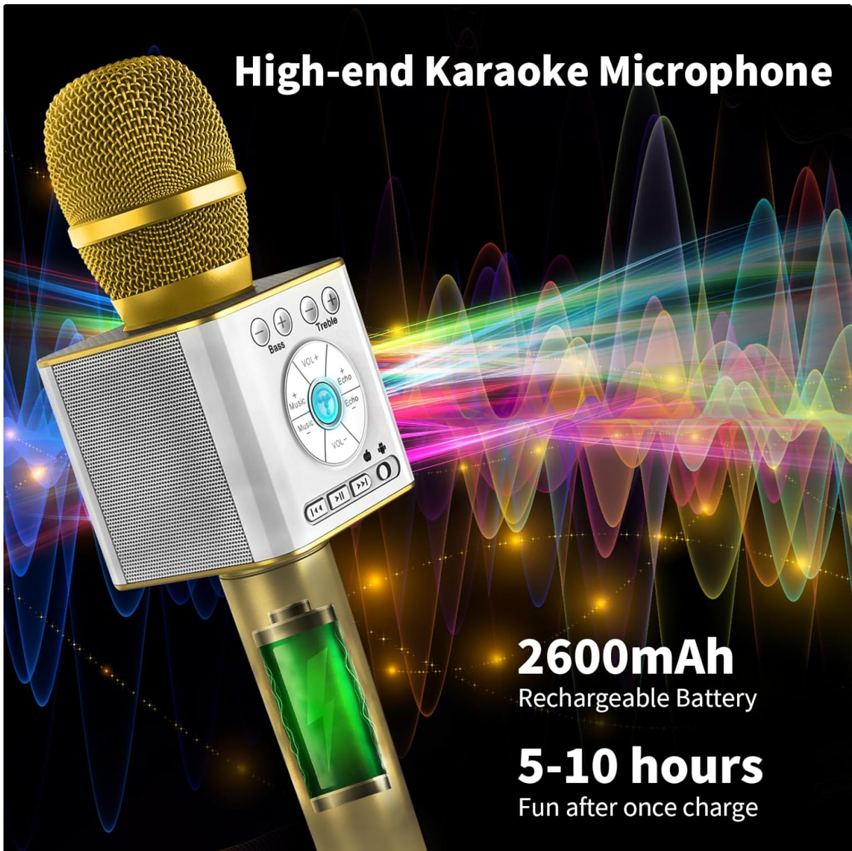
Image: The TOSING 04 microphone with an overlay indicating its 2600mAh rechargeable battery, providing 5-10 hours of usage per charge.