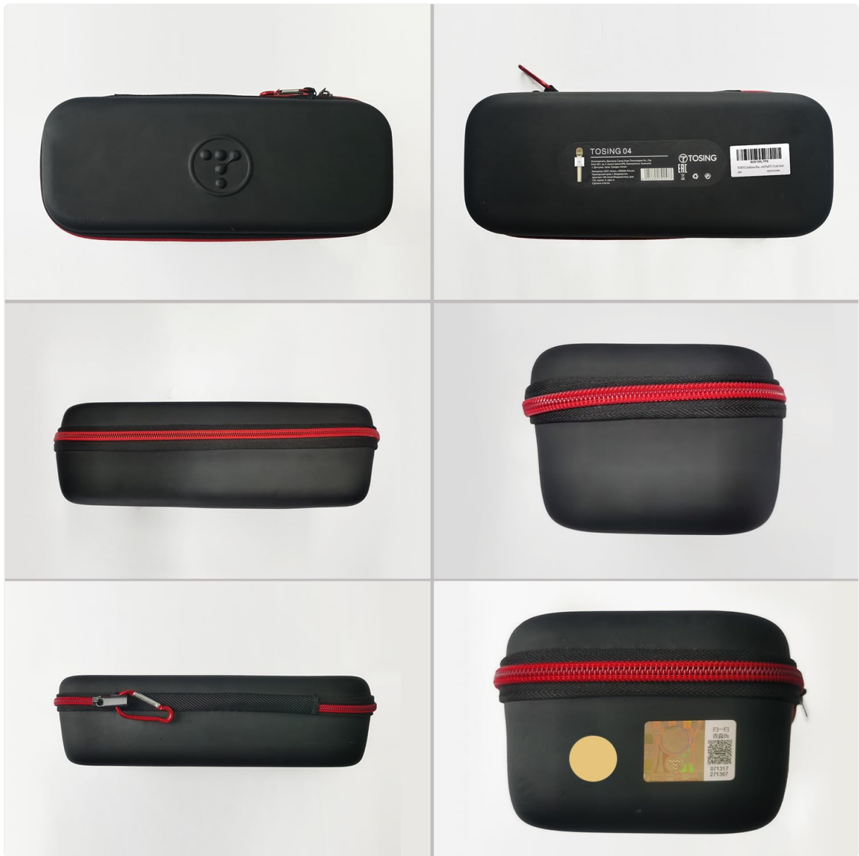
Image: The TOSING 04 microphone, charging cable, audio cable, and manual neatly stored in its protective carrying case.