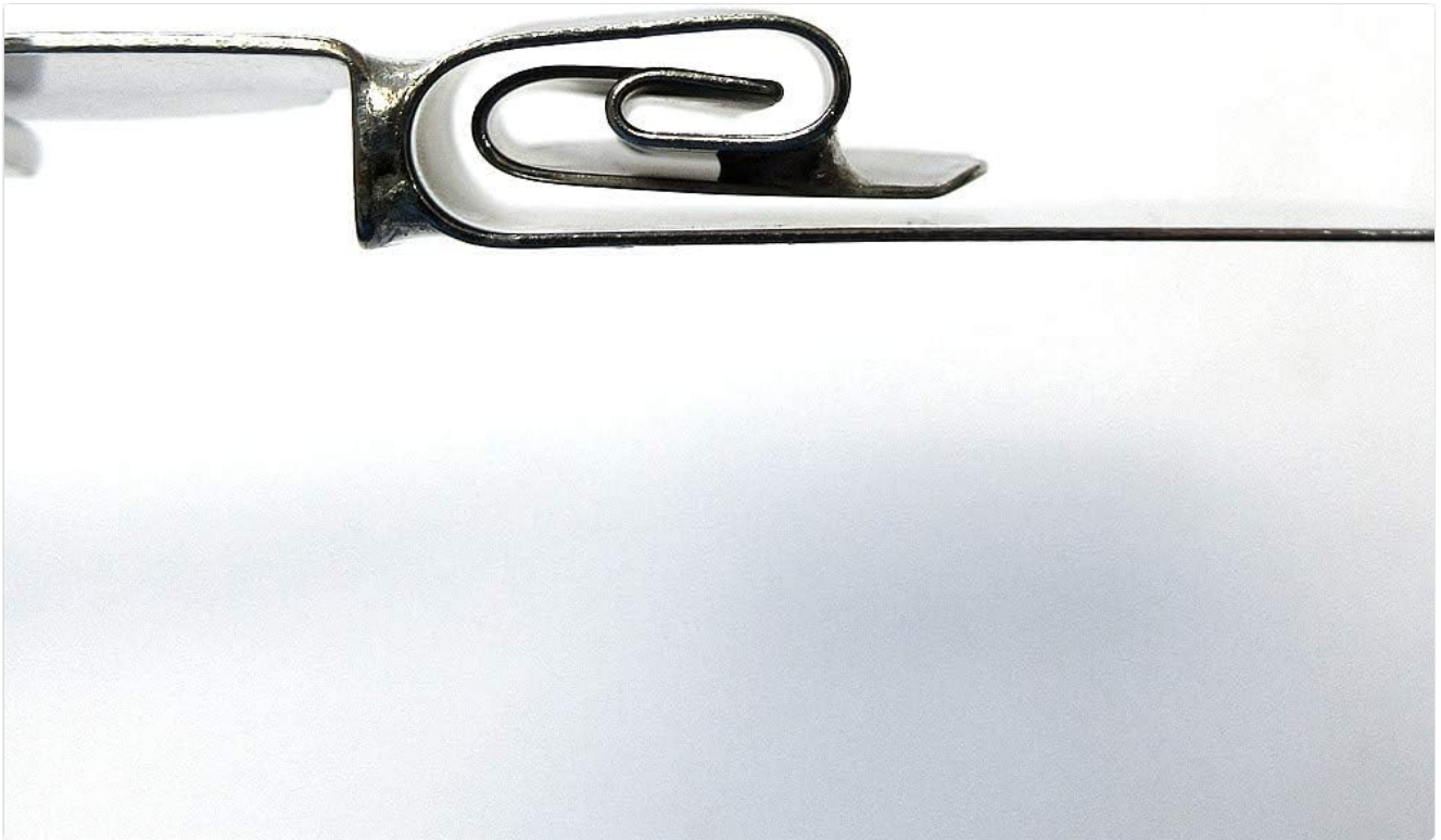
Figure 3.2: A detailed close-up of the hemmer's scroll, illustrating the precise double-fold mechanism that creates the clean hem.