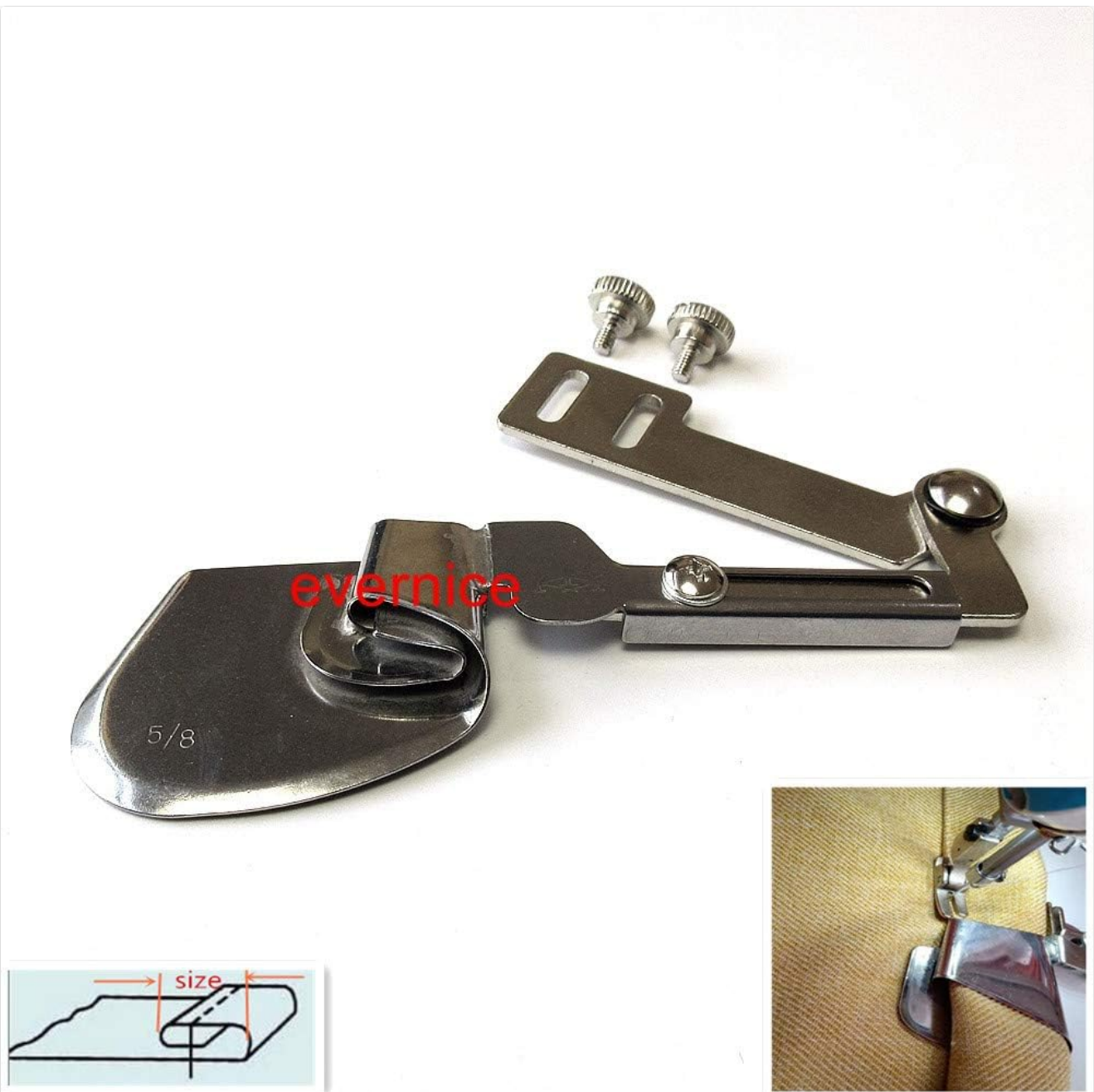
Figure 2.2: The hemmer showing a "5/8" marking (note: this specific product is 7/8 inch, but the image shows a similar model) and a diagram illustrating the double-fold hemming process.