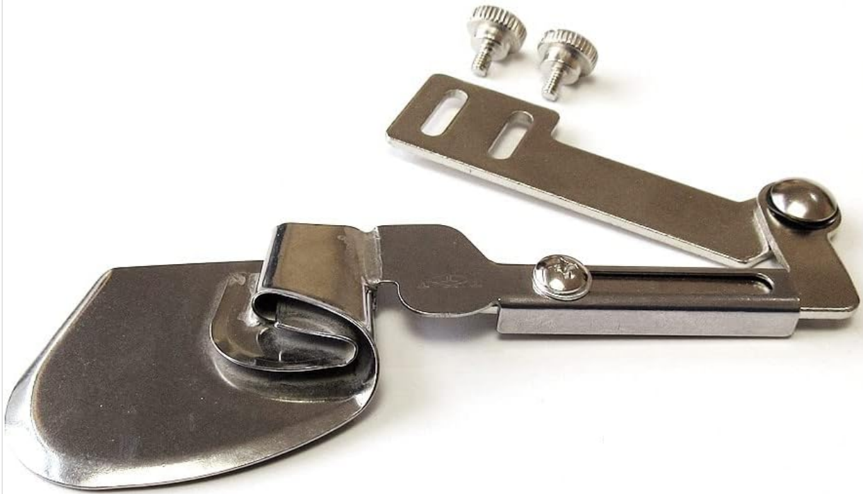
Figure 2.1: The EverNice Double Fold Clean Finish Swing Hemmer, showing the main body and the two thumb screws used for attachment to the sewing machine bed.