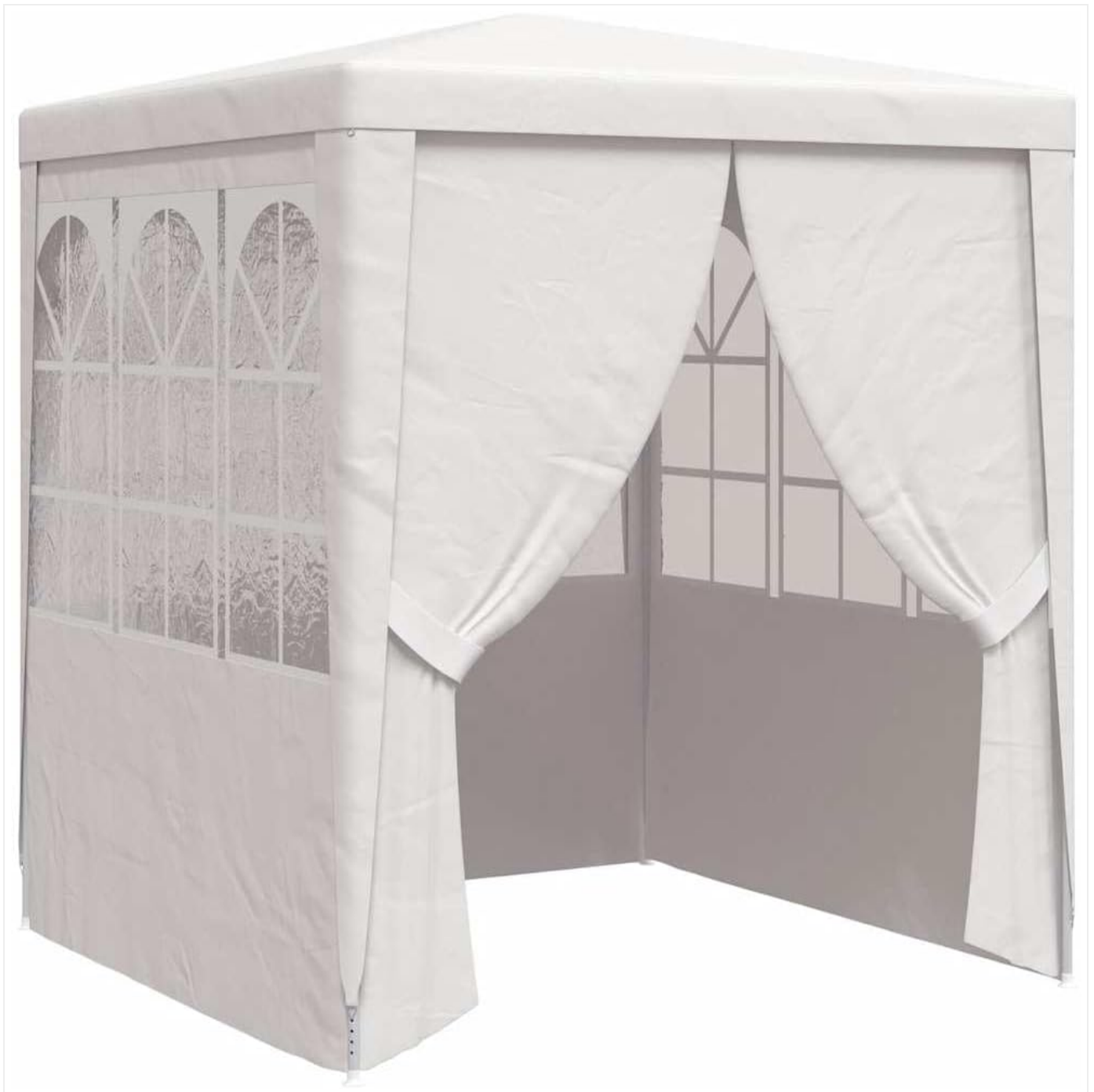
Image: The vidaXL Party Tent, showcasing its white canopy and side walls, with the front opening providing easy access. This tent is ideal for outdoor events, offering a sheltered space.