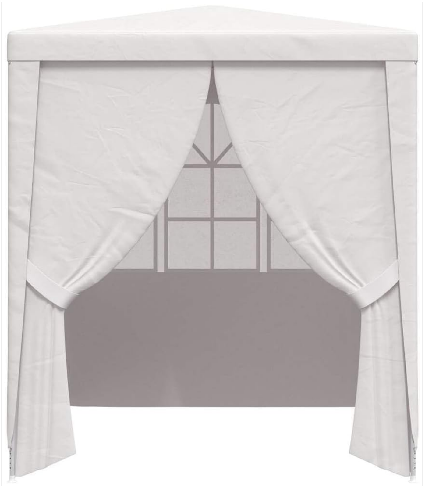
Image: The front view of the party tent, showing the entrance curtains neatly tied back, creating an inviting open space for guests.