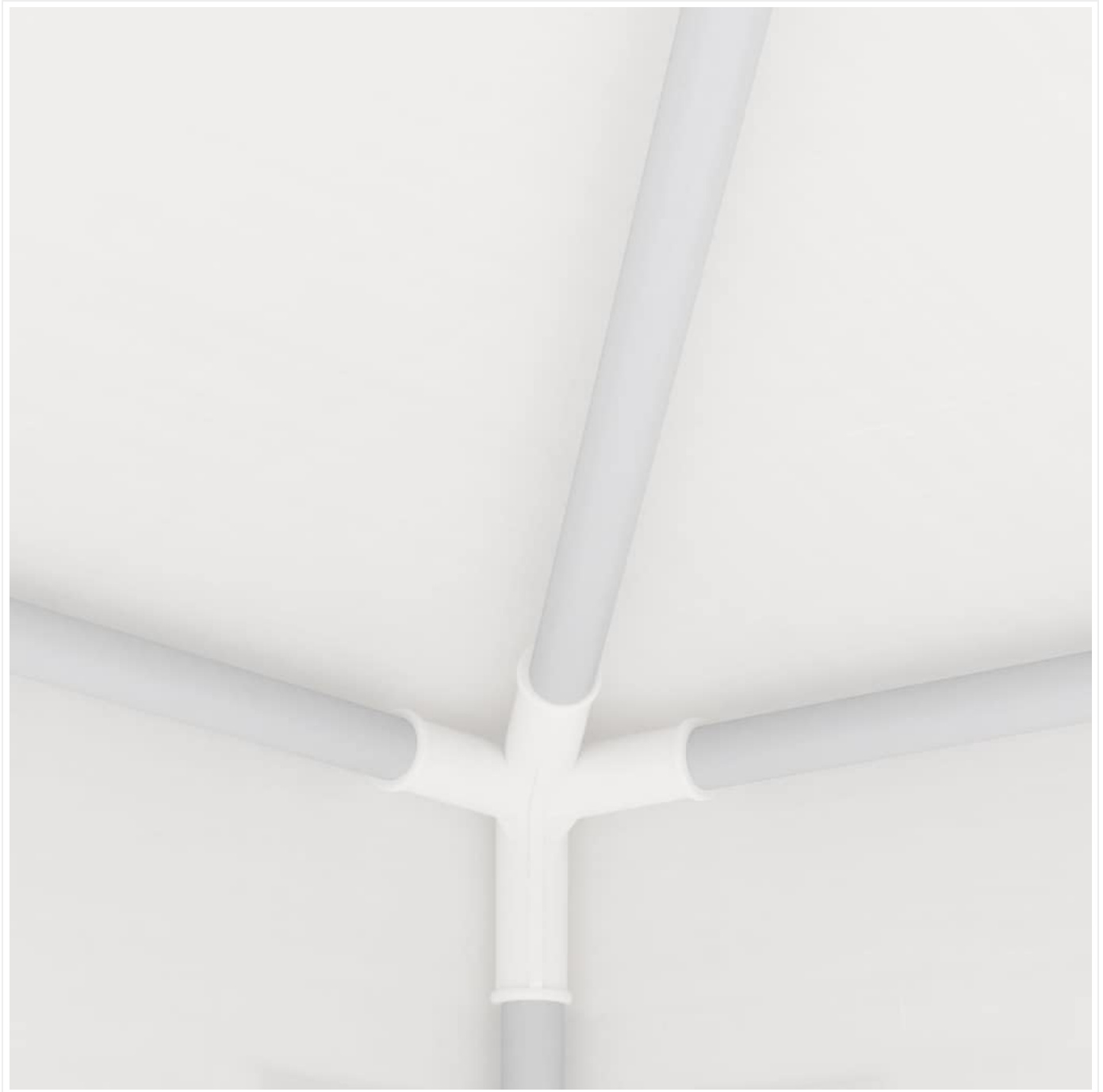
Image: A close-up view of the tent's frame connection point, showing the sturdy joint where multiple poles meet to form the structure.