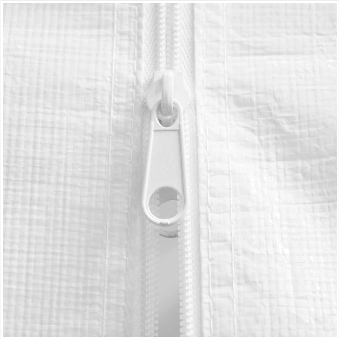
Image: A detailed close-up of the tent's zipper, highlighting its robust construction for secure closure of the side panels and door.