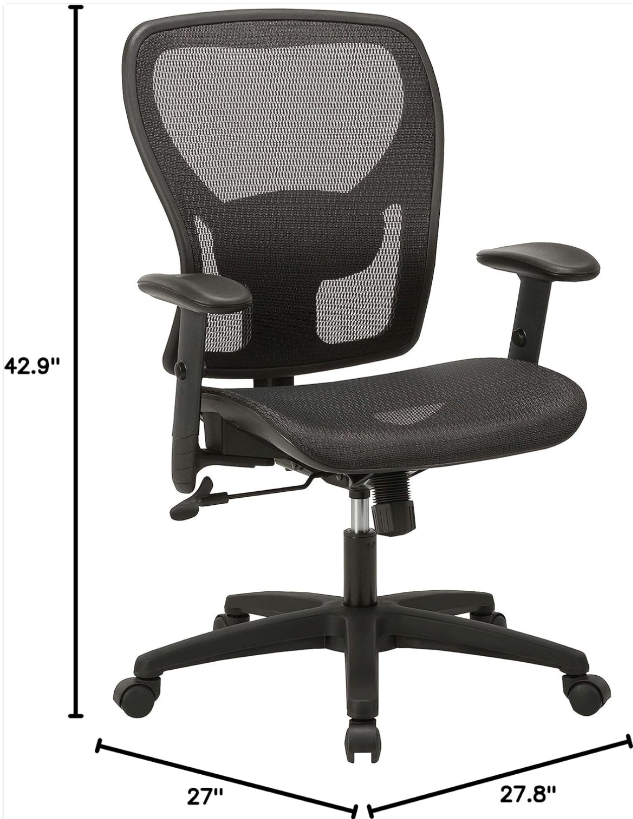
Figure 2: Overall dimensions of the assembled Lorell LLR83293 SOHO Mesh Mid-Back Task Chair.