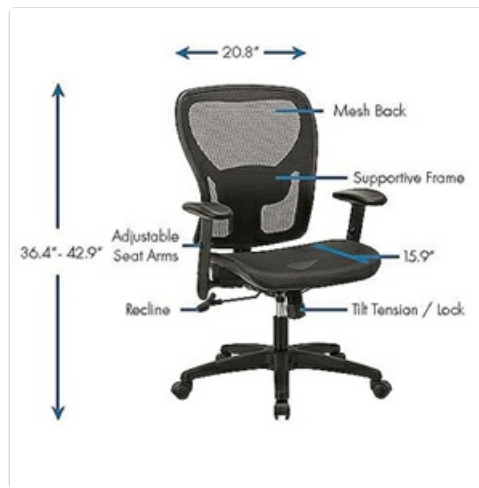
Figure 3: Key adjustable features of the chair.