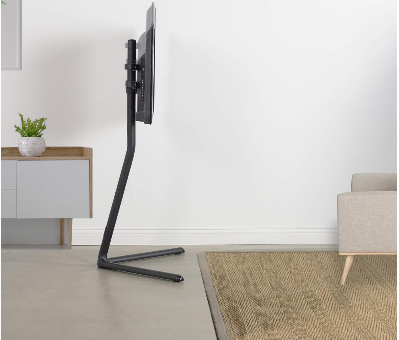
Image 5.1: The TV stand from a side perspective, demonstrating its height adjustment capability to achieve an ergonomic viewing level.