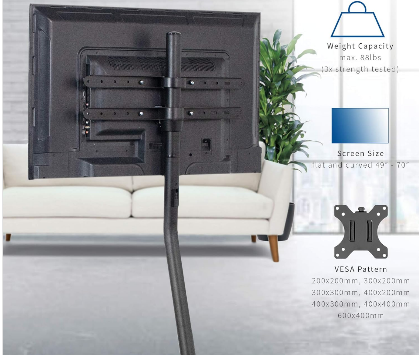
Image 4.2: Universal VESA compatibility diagram, showing supported patterns from 200x200mm to 600x400mm, and a maximum weight capacity of 88 lbs.