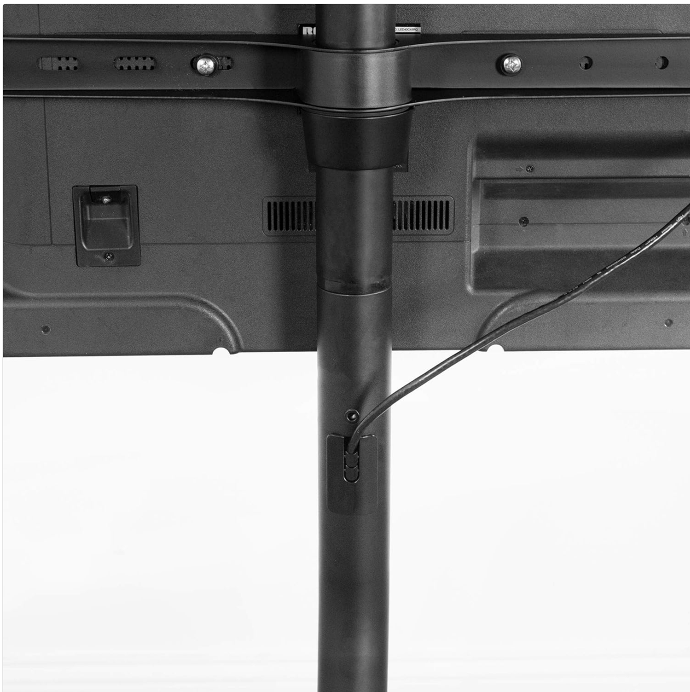
Image 4.4: Detail of the integrated cable management system, showing how cables are routed and hidden within the stand's pole for a tidy appearance.