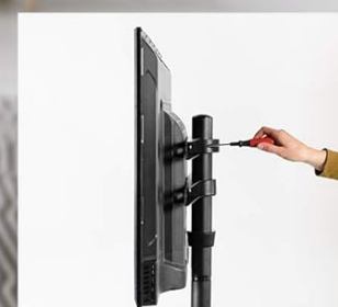
Image 4.3: Visual guide demonstrating the quick and easy installation process, highlighting the snap-lock feature for TV attachment.