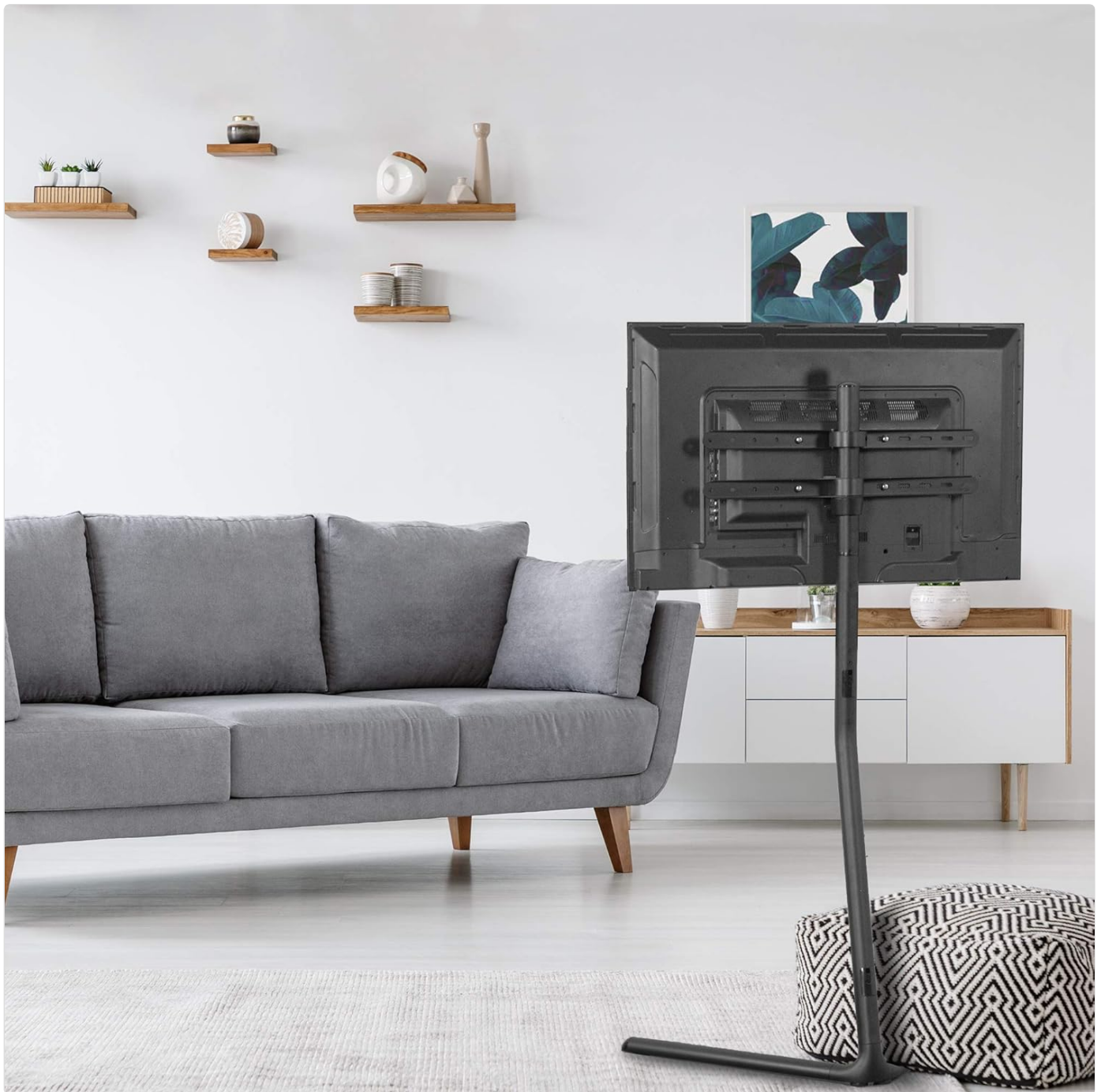
Image 1.1: The VIVO STAND-TV70B Studio TV Display Stand in a modern living room environment, showcasing its minimalist design.

Video 1.1: An official VIVO video highlighting the features of the STAND-TV70B V-Base Studio TV Stand, including its design, VESA compatibility, and cable management.