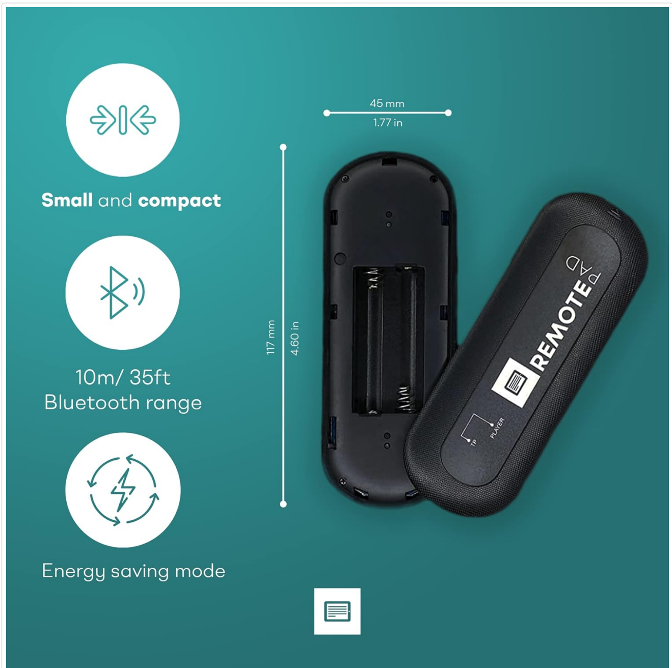
Image: A diagram illustrating the compact size of the remote control (4.60 inches / 117 mm length, 1.77 inches / 45 mm width), its 10m/35ft Bluetooth range, and energy-saving mode. The back of the remote with the battery compartment is also shown.