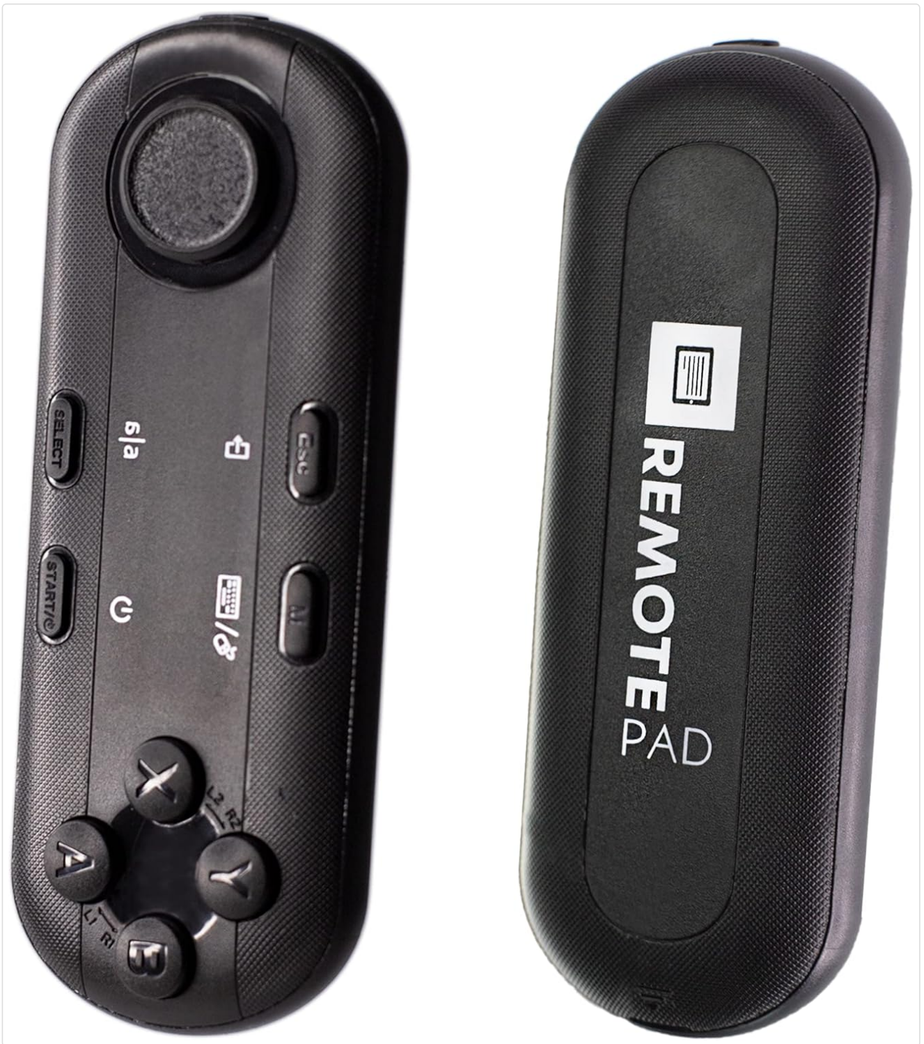
Image: Front and back view of the TELEPROMPTER PAD Bluetooth Remote Control. The front features a joystick, various control buttons, and directional pads. The back shows the battery compartment cover and the 'REMOTEPAD' branding.