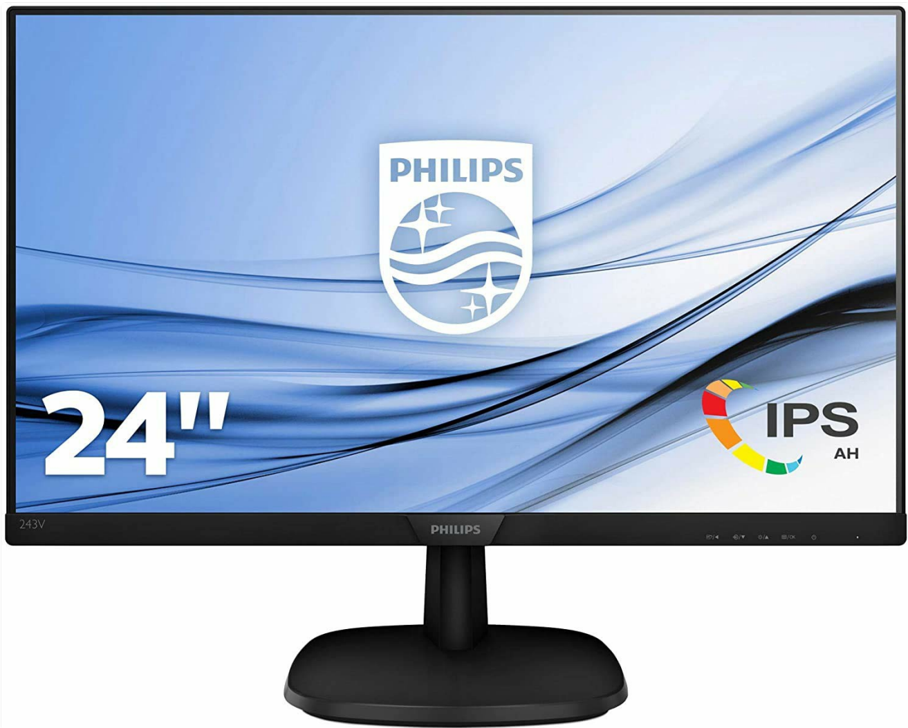
Figure 1: Front view of the Philips 243V7Q Full HD LCD Monitor.