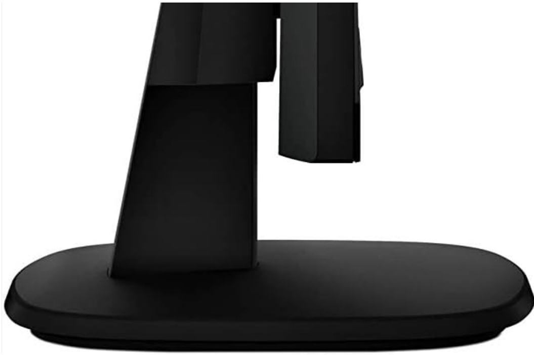
Figure 2: Side view illustrating the monitor's profile and stand attachment point.