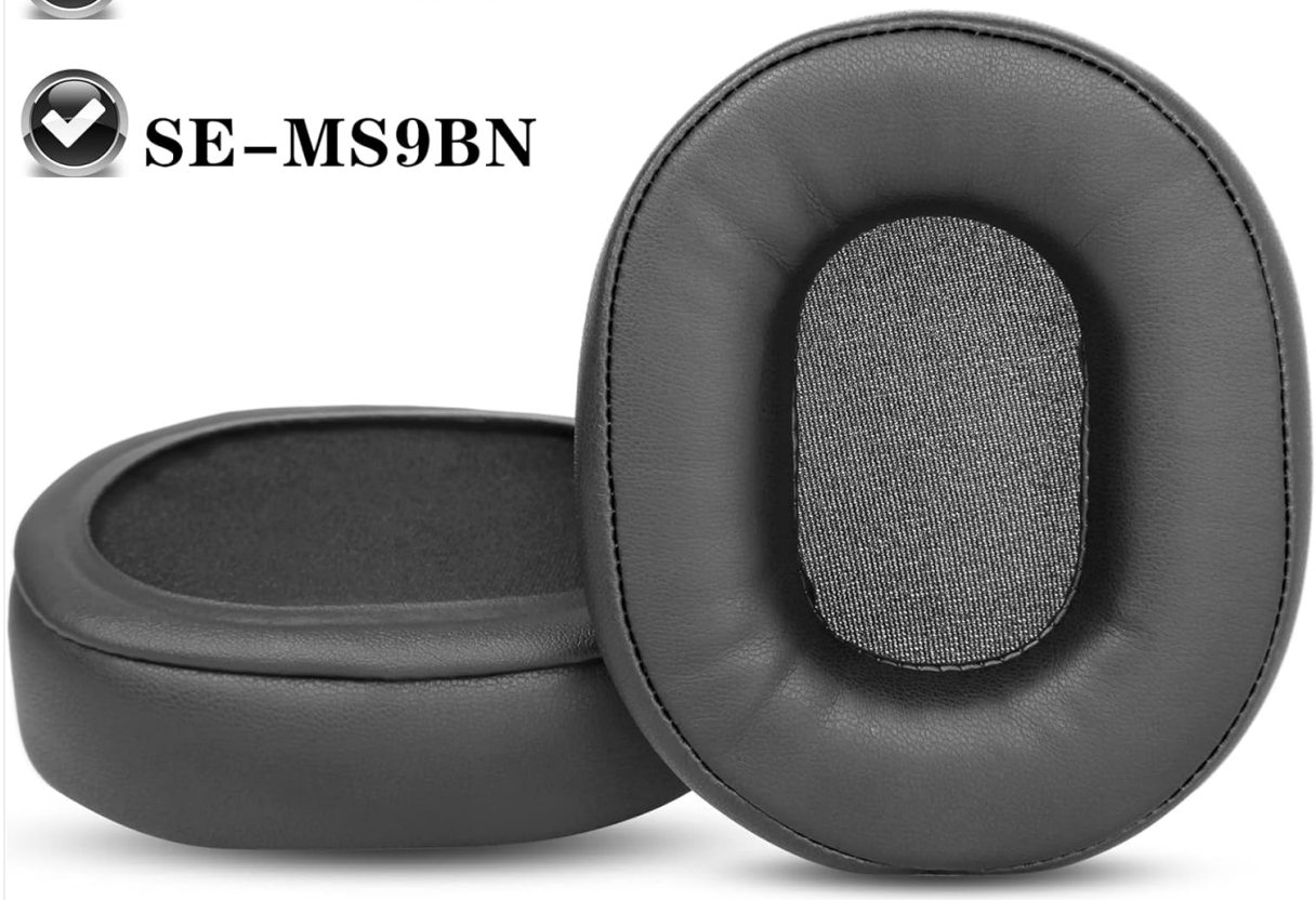
Figure 2: Compatible Headphone Models. Ensure your headphone model is listed for proper fit.