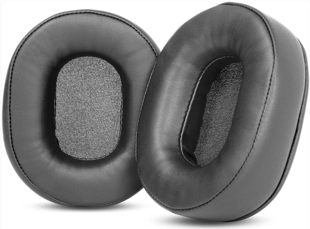
Figure 1: YunYiYi Replacement Ear Pads. These ear pads are designed for comfort and durability.

This manual provides detailed instructions for the installation, use, and maintenance of your YunYiYi replacement ear pads. These ear pads are designed to restore comfort and sound quality to your compatible Pioneer headphones.