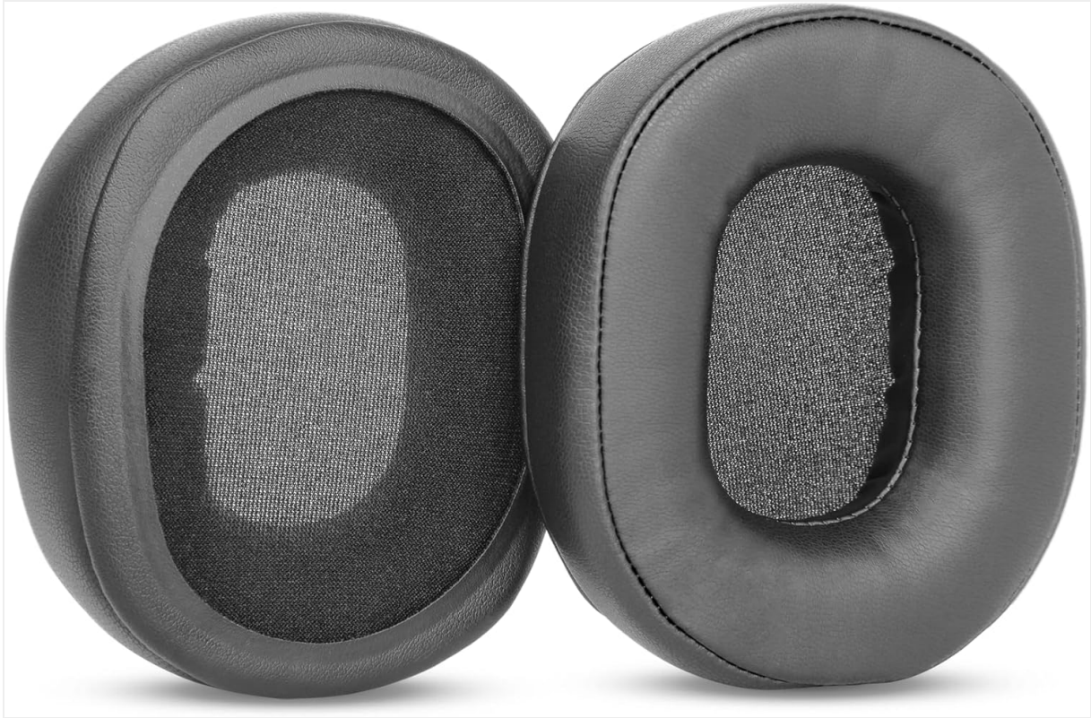
Figure 3: Ear Pad Detail. Observe the lip on the back of the ear pad for proper installation.

Note: The installation can be challenging due to the snug fit. This tight fit is intentional to provide a secure attachment and optimal sound isolation. Do not use sharp objects, as they may damage the ear pads or headphones.