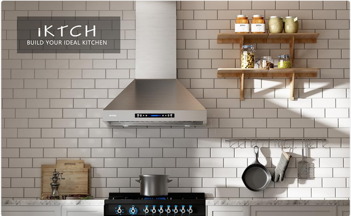
Figure 4: 900 CFM Powerful Suction