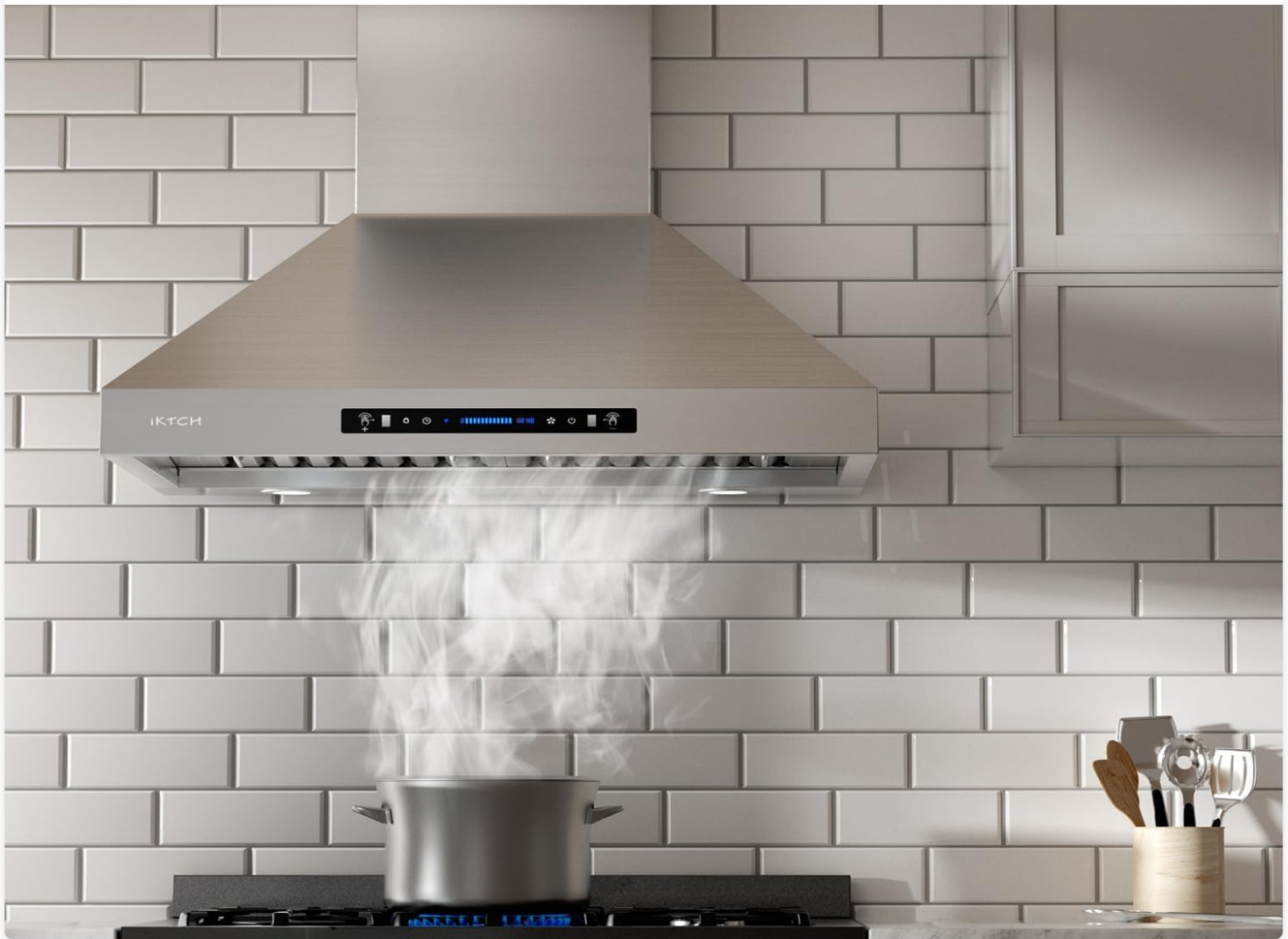
Figure 1: IKTCH IKP04-30 Wall Mount Range Hood

4 levels of wind speed to meet your different cooking environments.