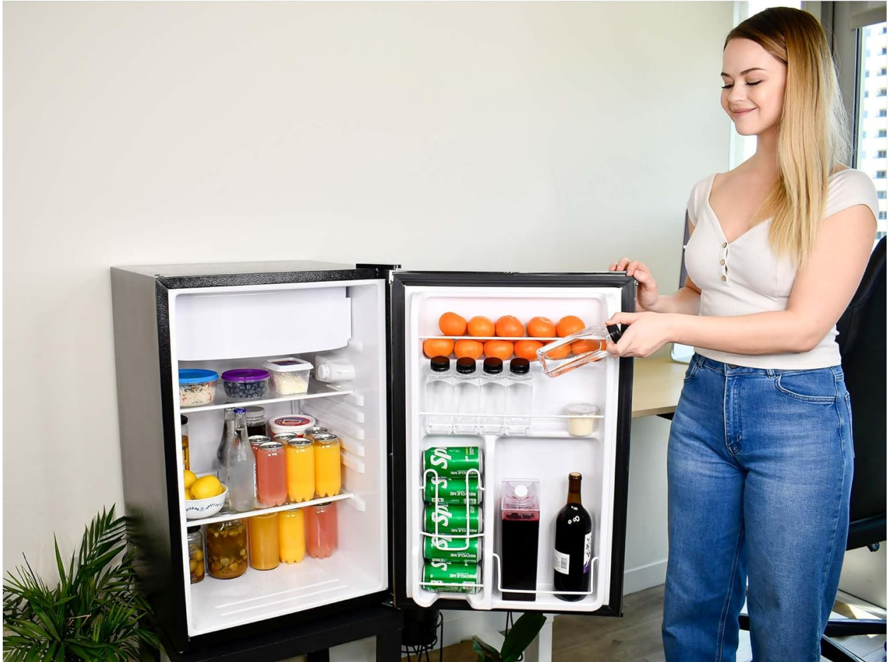
Image Description: An image showcasing the interior of the Frigidaire compact refrigerator with its door open. A person is seen placing items inside, emphasizing the practical storage. Overlaid text promotes its 'Space Saving Design' and mentions the 'reversible door and flush back design' for flexible placement.

Enjoy versatile placement options with a reversible door and flush back design.