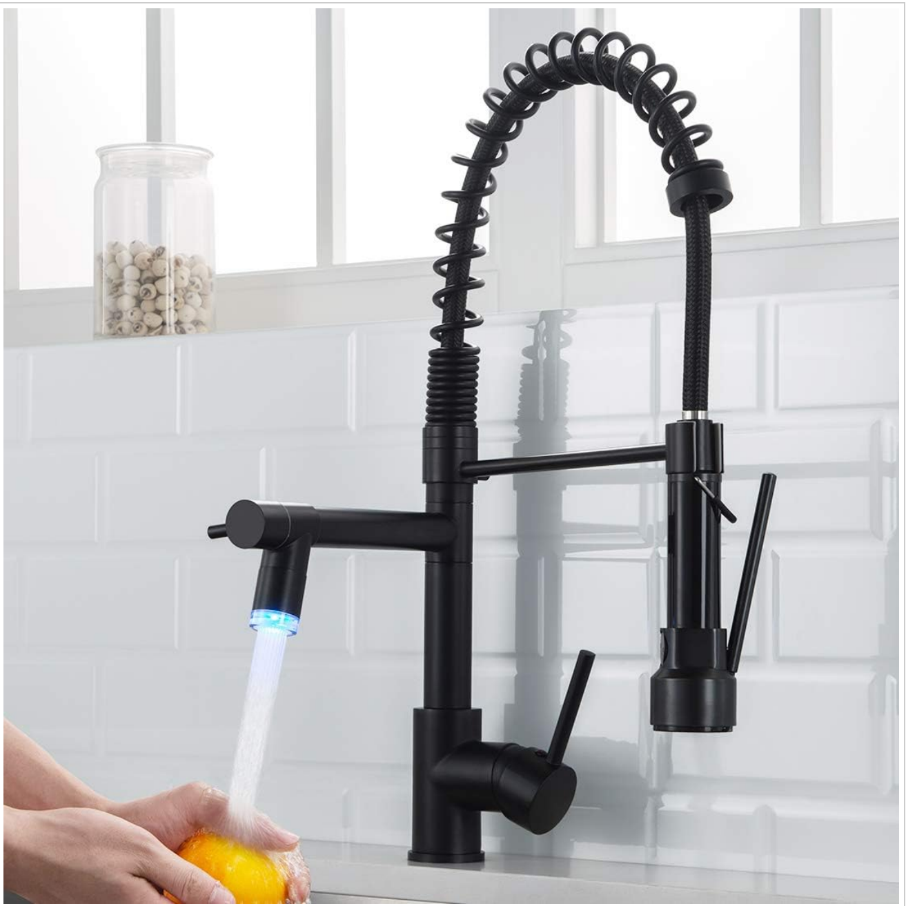
Image of a hand using the pull-down sprayer to rinse a lemon in a kitchen sink.

To switch between stream and spray modes, press the button located on the sprayer head. The practical design includes a sprayer lock feature, allowing you to maintain a continuous water flow without holding the handle, freeing both hands for tasks.