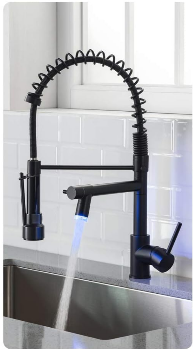
Image showing the faucet's LED light changing color based on water temperature: green for cold, blue for warm, red for hot.