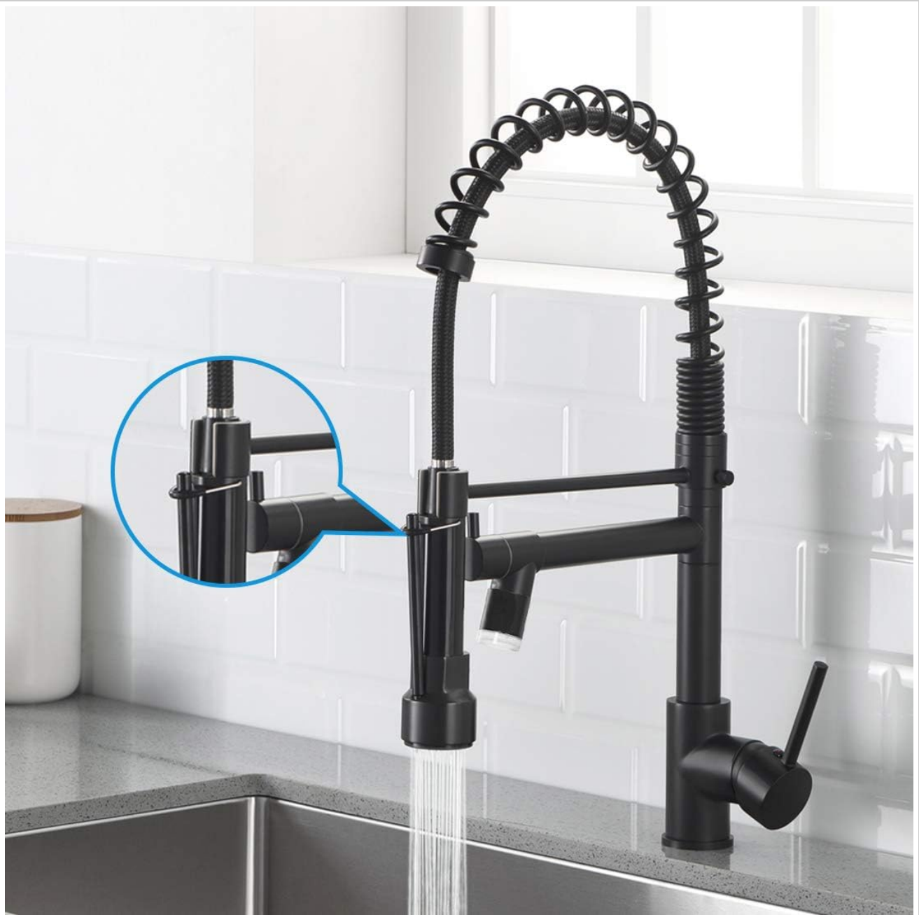
Close-up image of the sprayer head with the buckle lock mechanism highlighted.

Watch this video for a demonstration of the sprayer functionality: