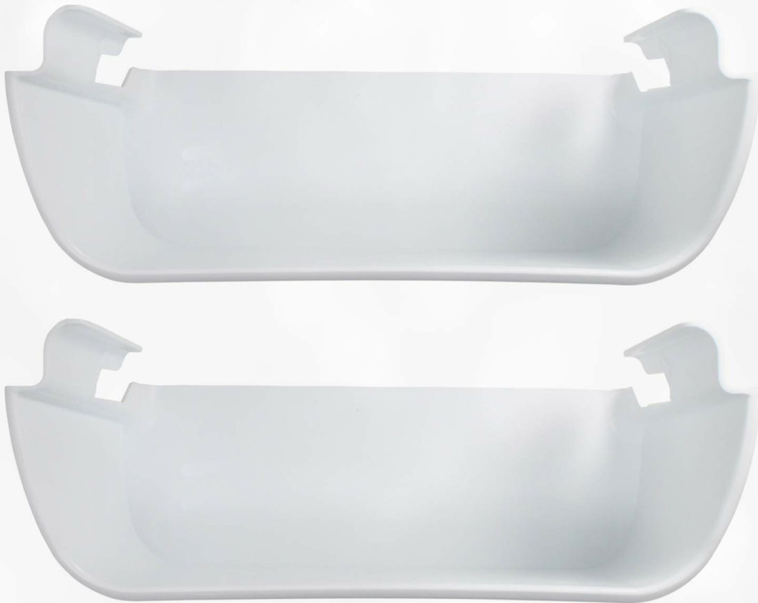
Image 1.1: Front view of the UpStart Components 240363701 Refrigerator Door Shelf Bin. This image shows the overall shape and design of the replacement bin.