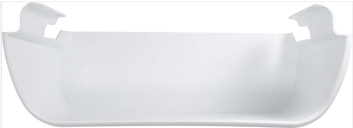
Image 6.1: Top-down view of the shelf bin, illustrating its capacity for storing items.