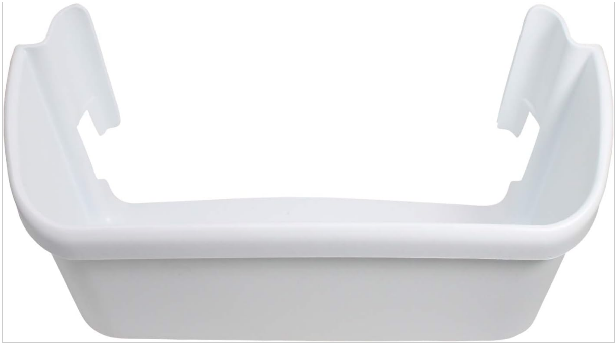
Image 3.1: An example of the two refrigerator door shelf bins included in the package.