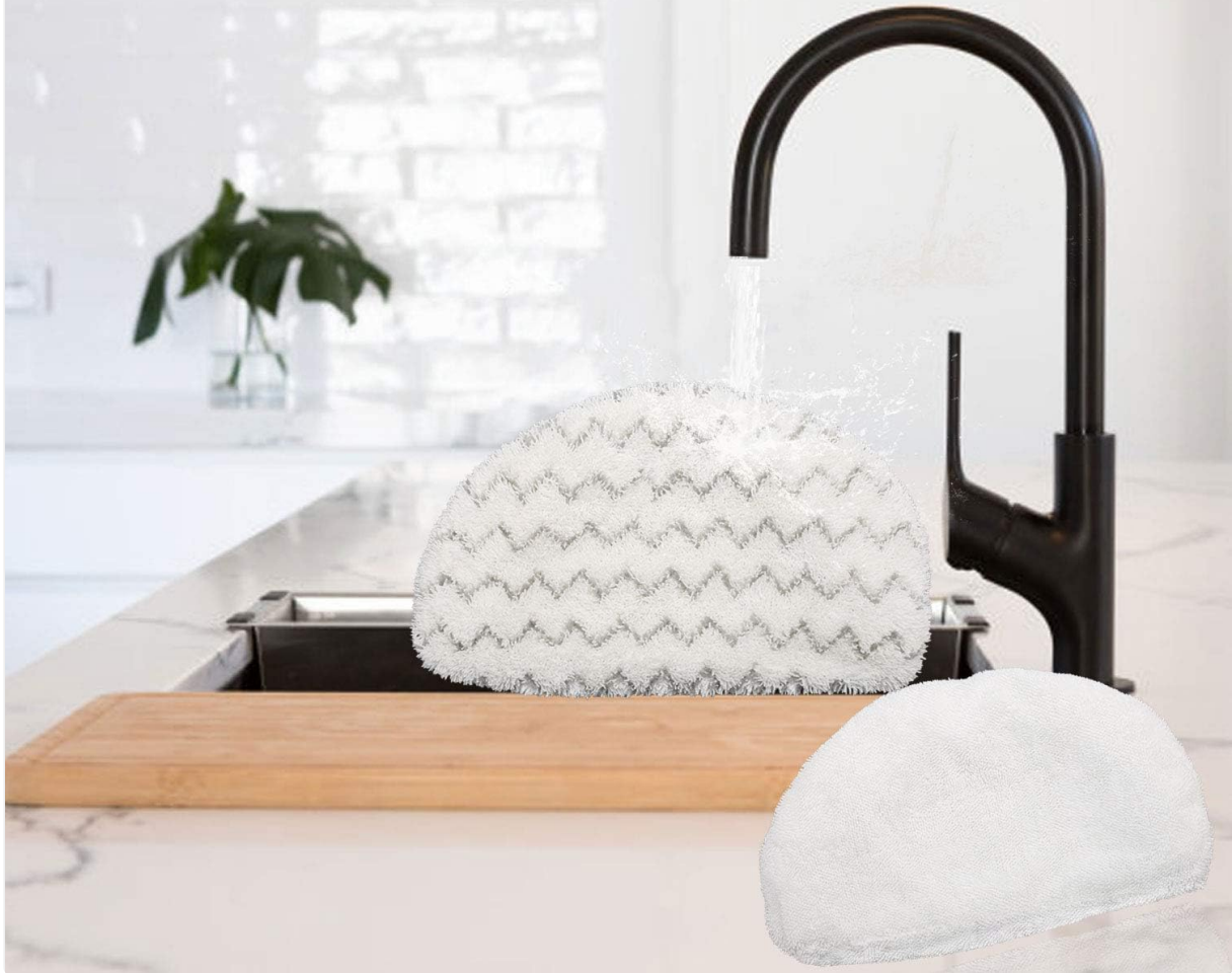
Figure 7: Easy Hand Cleaning of Pads. This image illustrates the simplicity of cleaning the mop pads by hand under running water.