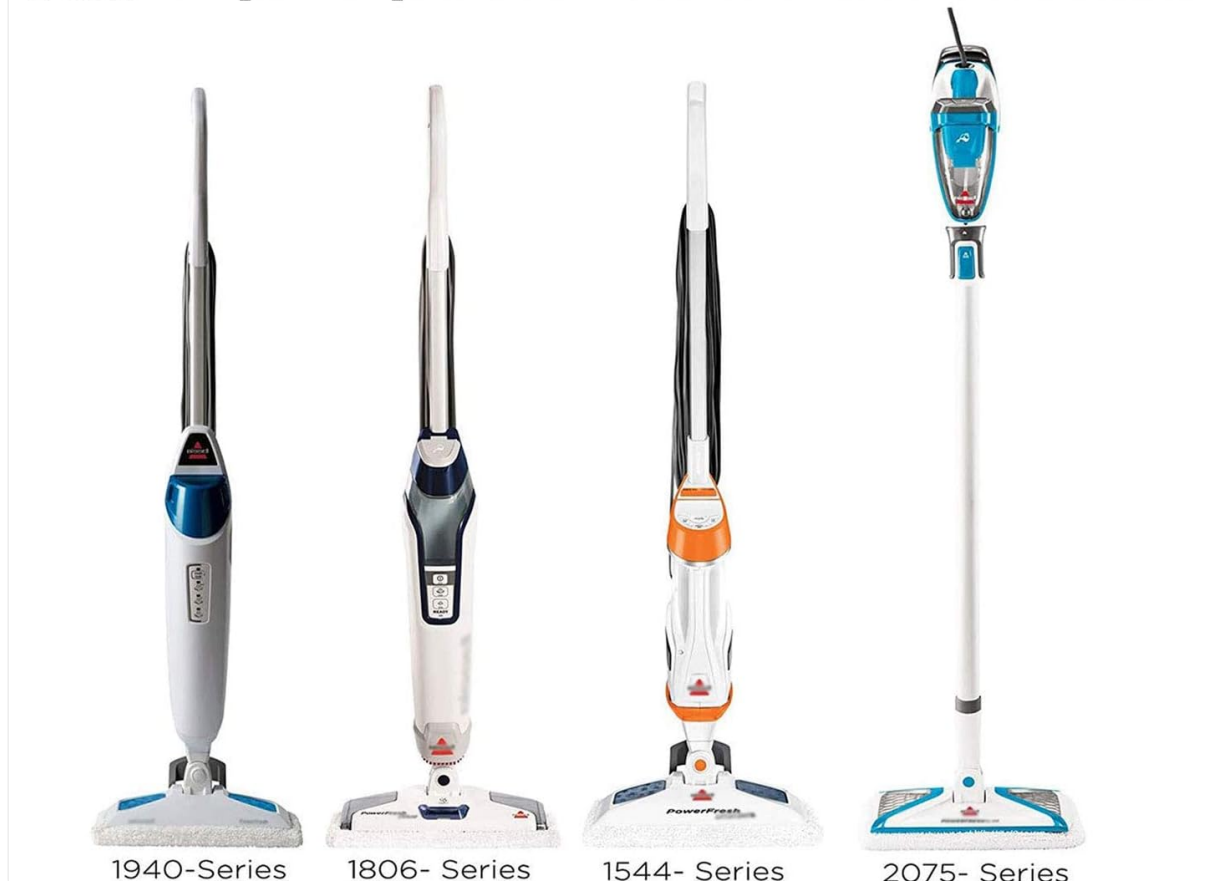
Figure 4: Compatible Bissell PowerFresh Steam Mop Models. This image illustrates various Bissell PowerFresh steam mop models that are compatible with these replacement pads.

Compatible part 5938 & 203-2633 1606668 and 1606669