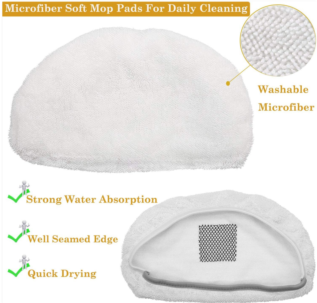
Figure 3: Microfiber Soft Mop Pad for Daily Cleaning. This image highlights the features of the soft pad, including its washable microfiber composition, strong water absorption, durable seamed edge, and quick-drying capability.