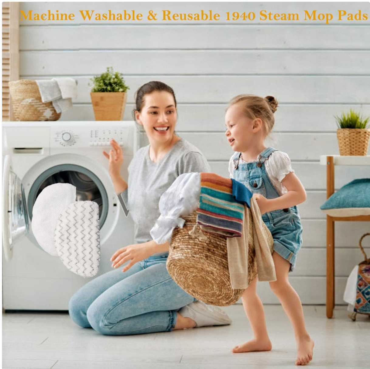
Figure 6: Machine Washable and Reusable Pads. This image shows the convenience of cleaning the pads in a washing machine, emphasizing their reusability.