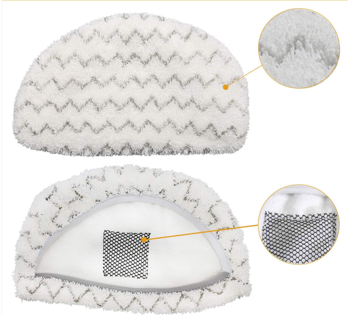
Figure 2: Microfiber Stripe Pad for Dirt and Messes. This detailed view shows the textured scrubbing strips and the mesh material on the back of the pad, designed for effective removal of stubborn dirt.