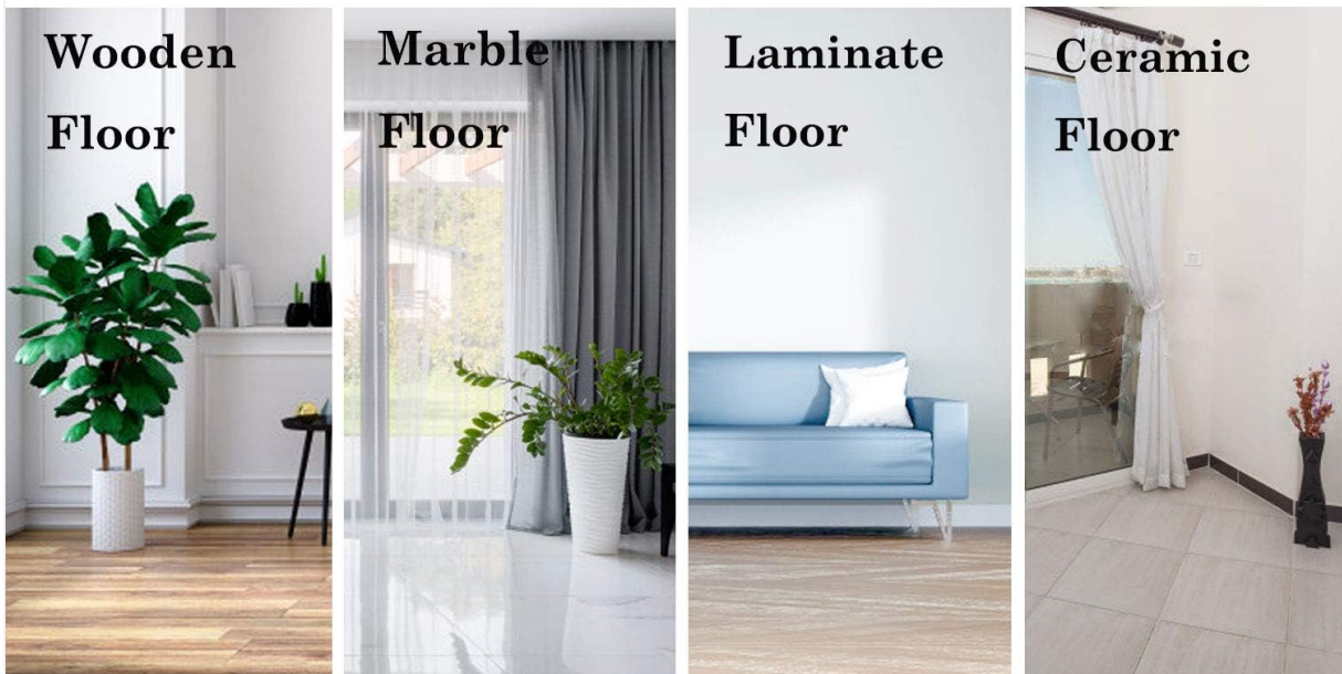
Figure 5: Suitable Floor Types for Cleaning. This image demonstrates that the pads are effective on various sealed hard surfaces, including wooden, marble, laminate, and ceramic floors.

Perfect for all hard seal floors such as