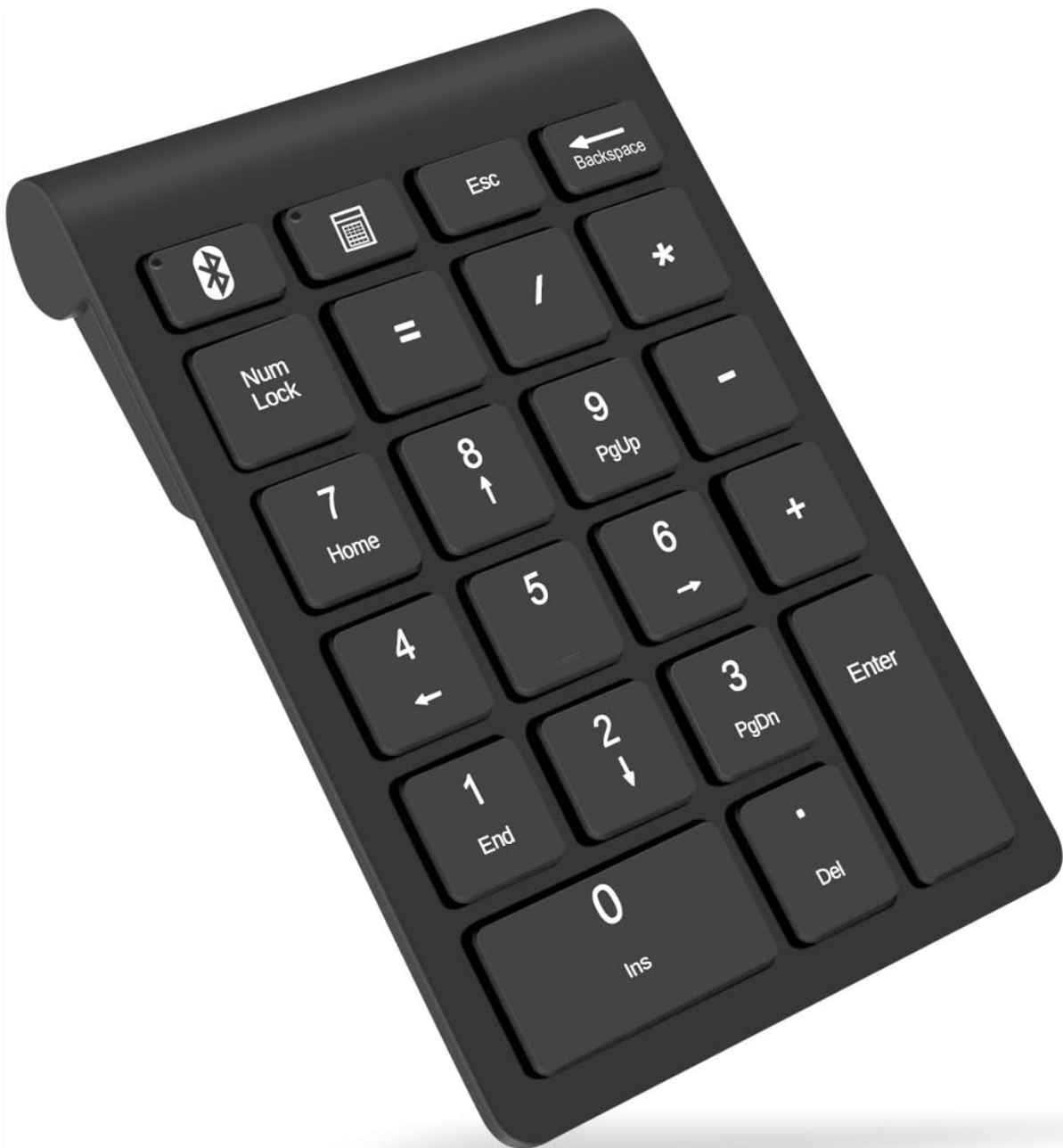
Image 1.1: The Foloda Bluetooth Number Pad, a compact and wireless numeric keypad.