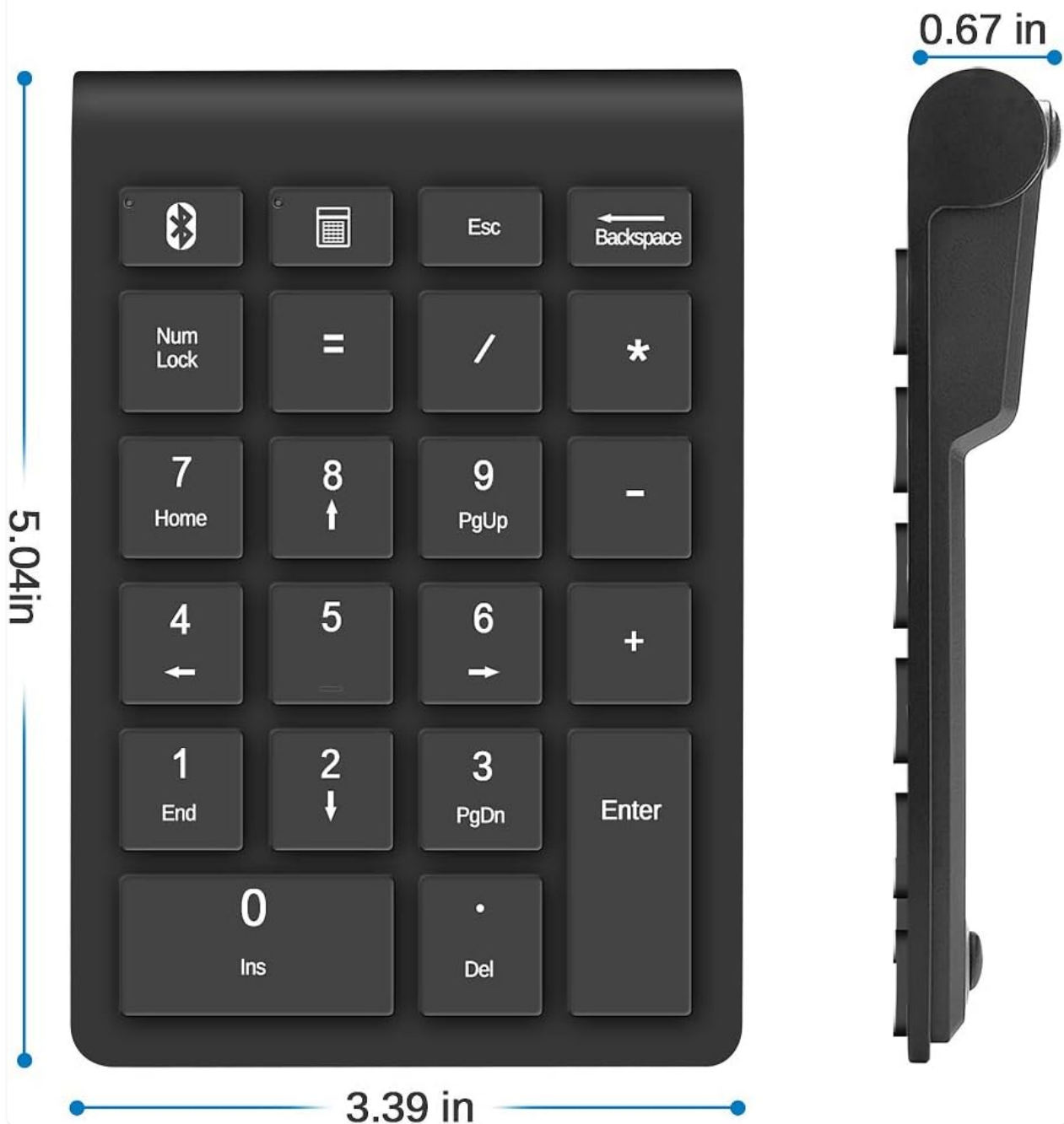
Image 3.1: Diagram illustrating the dimensions of the Foloda Bluetooth Number Pad.