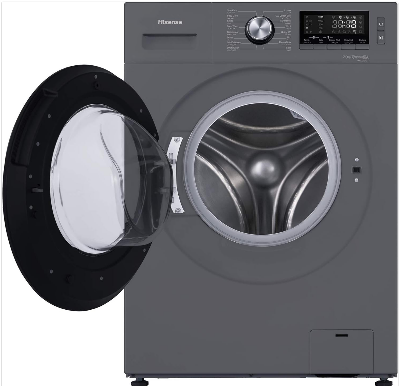
The Hisense washing machine with its front door open, revealing the spacious drum for loading laundry.

Open the front load door and place your laundry inside the drum. Do not overload the machine to ensure optimal washing performance and prevent damage.