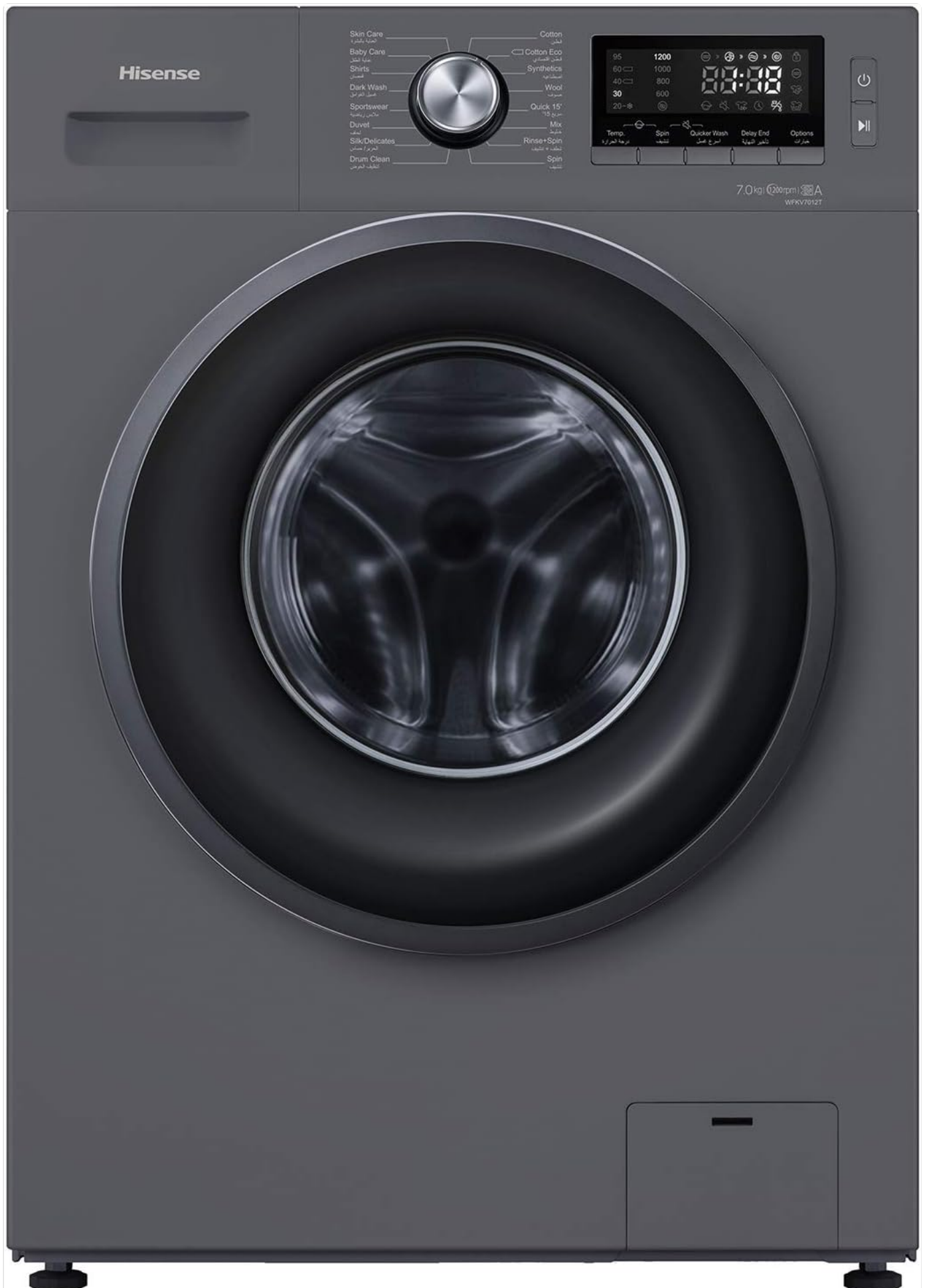
Front view of the Hisense 7 Kg 1200 RPM Front Load Washing Machine, showcasing its silver finish and control panel.