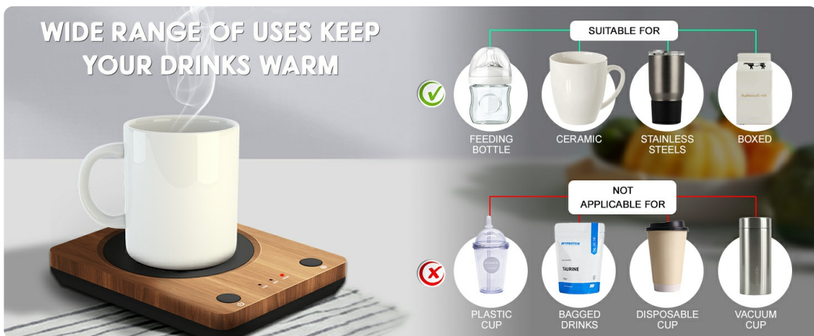
Image: A visual guide showing various cup types that are suitable (feeding bottle, ceramic, stainless steel, boxed) and not applicable (plastic cup, bagged drinks, disposable cup, vacuum cup) for use with the mug warmer.

Not Recommended for: Thermos cups, vacuum glass, bagged drinks, or plastic cups, as these may not allow for efficient heat transfer or may be damaged by heat.