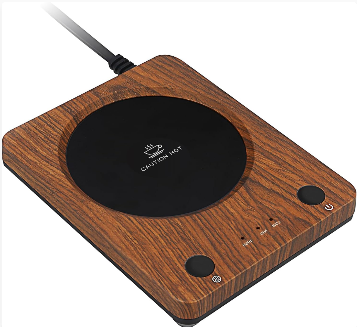
Image: The SEALON SLM02 Electric Coffee Mug Warmer with a wood grain finish, featuring a black heating plate and control buttons.