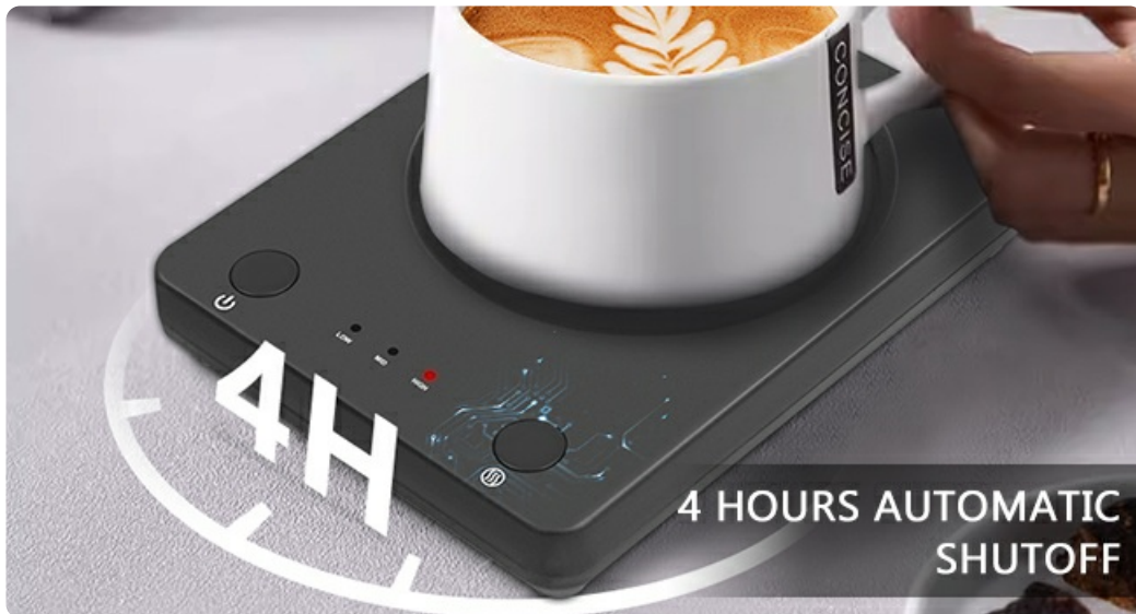
Image: An illustration highlighting the 4-hour automatic shutoff feature of the mug warmer.

Image: Visual representation of the smart sensor, showing the warmer heating when a mug is present and stopping when the mug is removed.