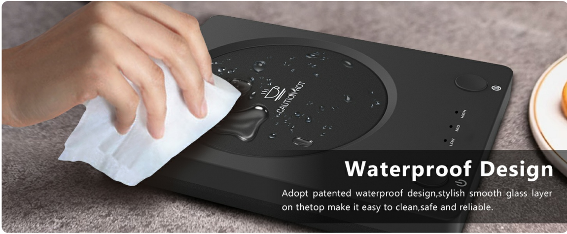
Image: An image demonstrating the waterproof design of the mug warmer, with water being poured onto the heating plate and an icon indicating easy cleaning.