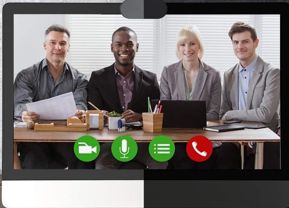
Image: Webcam mounted on a laptop screen.