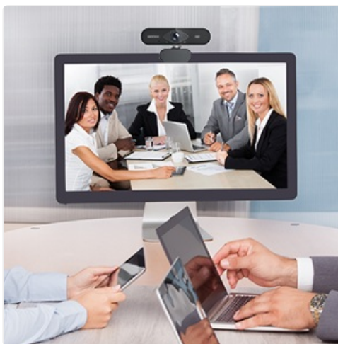
Image: USB connection for the webcam.