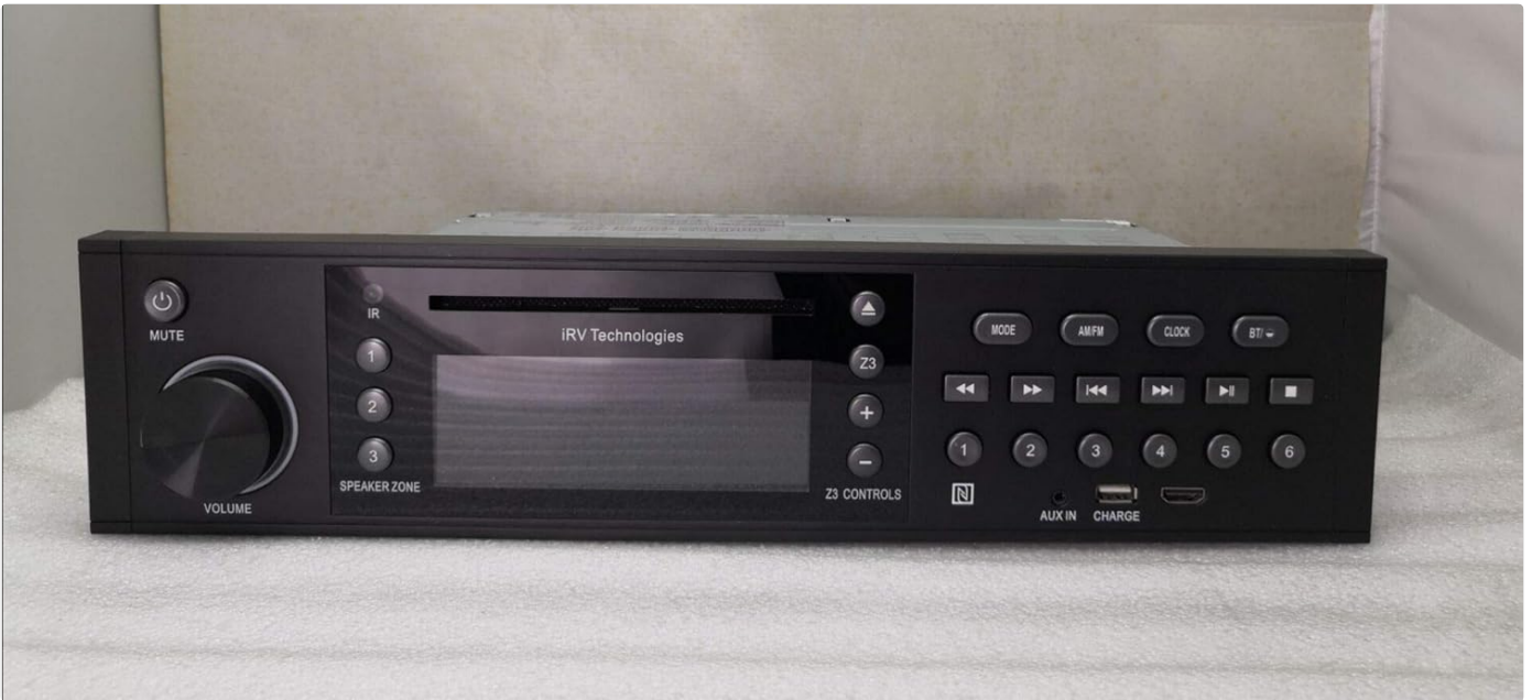
Figure 1: Front view of the iRV70 Blu-ray Disc Player, showing the display, control buttons, volume knob, and disc slot.