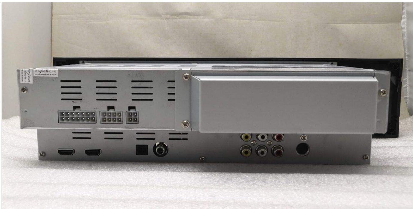
Figure 3: Rear view of the iRV70, displaying various input/output ports including HDMI, optical, coaxial, and RCA audio/video connections.