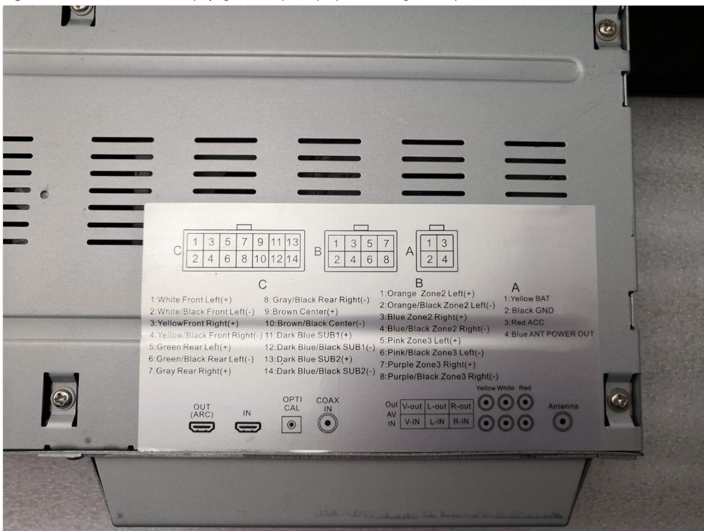
Figure 4: Detailed wiring diagram showing connector pinouts for power, speaker zones (A, B, C), and various audio/video inputs and outputs.