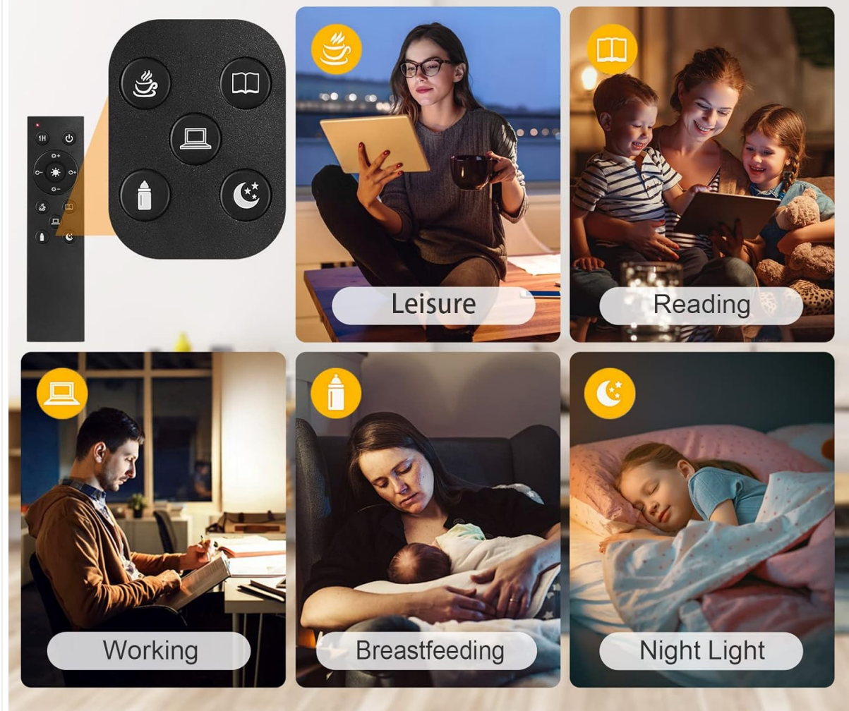
Figure 4: Remote control for the OUTON Floor Lamp.

Customize your lighting scene in one second on the remote