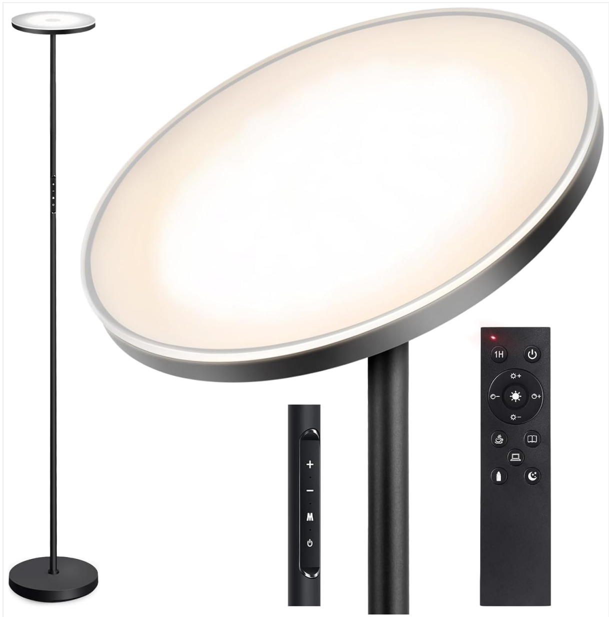
Figure 1: OUTON Floor Lamp with its remote and touch control panel.

The OUTON Floor Lamp is designed for ease of use and versatility. It features a sleek, modern design with integrated LED lighting.