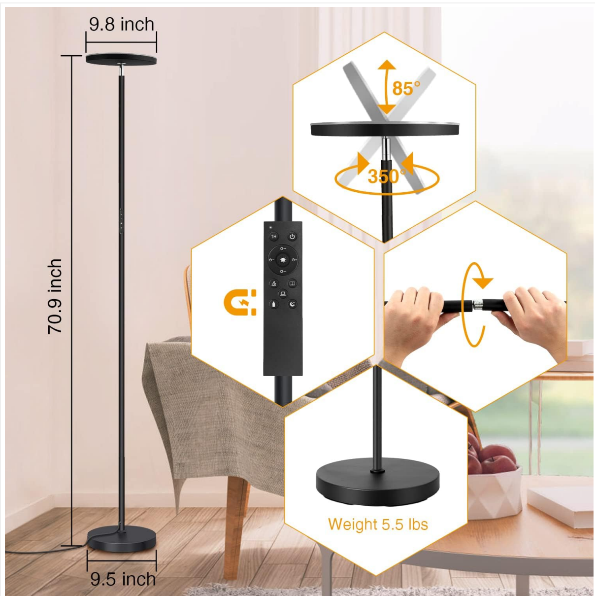
Figure 2: Lamp dimensions and adjustable head features. The lamp head can rotate 360 degrees and tilt up to 85 degrees.