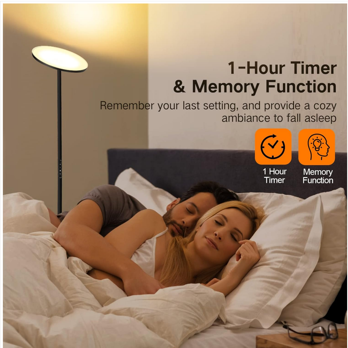
Figure 5: Icons representing the 1-hour timer and memory function.