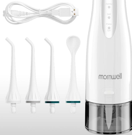
Image: A visual representation of the nozzles included with the water flosser, highlighting the new nozzle configuration.

Standard Nozzle*3 Tongue Cleaner Nozzle*1