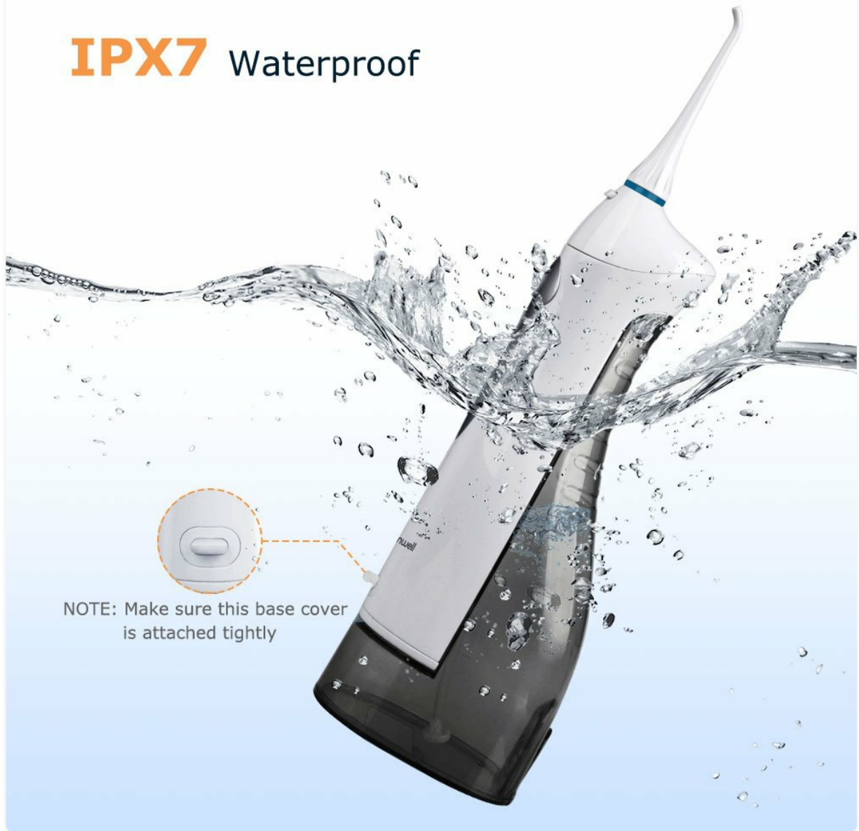
Image: The water flosser demonstrating its IPX7 waterproof capability, with a note to ensure the base cover is tightly attached.