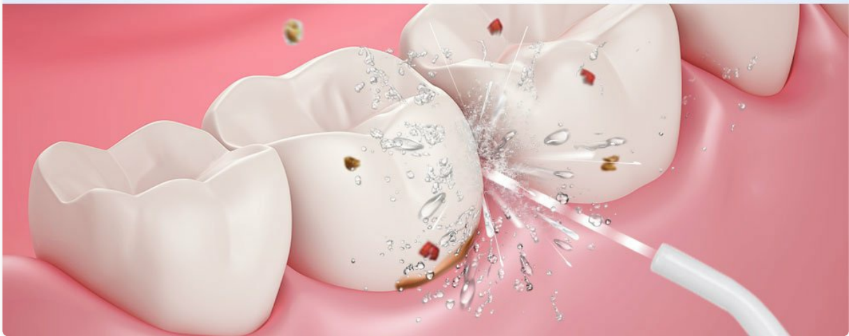
Image: Common oral problems that can be addressed by using the water flosser.