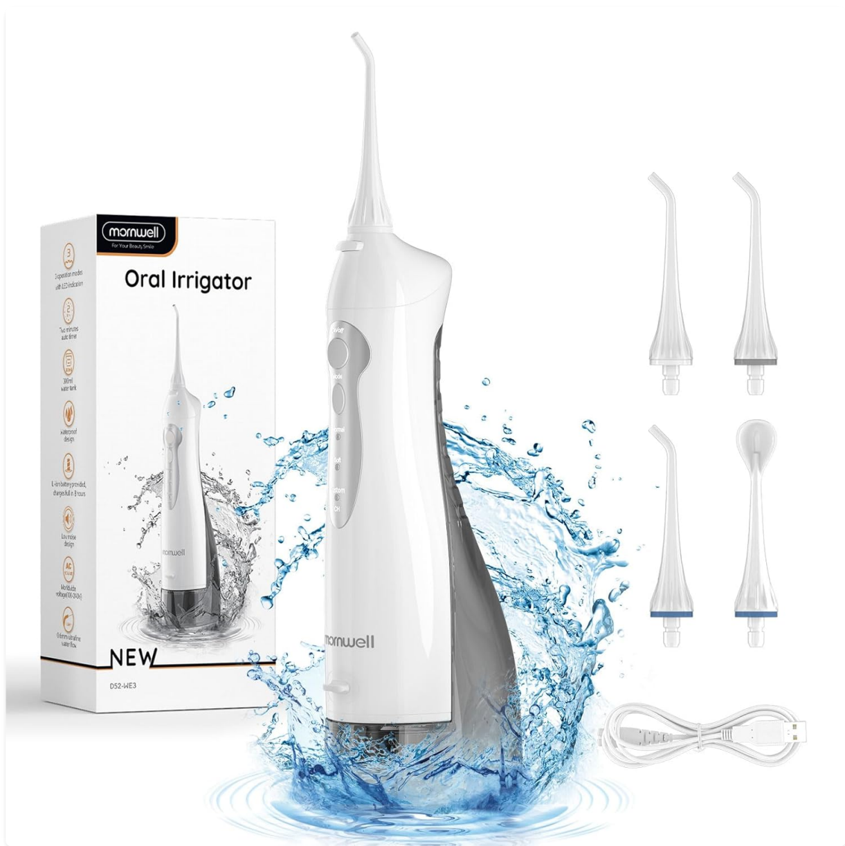
Image: The Mornwell Water Flosser, its packaging, various nozzles, and a USB charging cable.