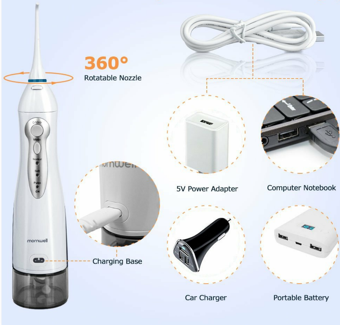
Image: Illustration of the versatile USB charging capabilities of the water flosser.