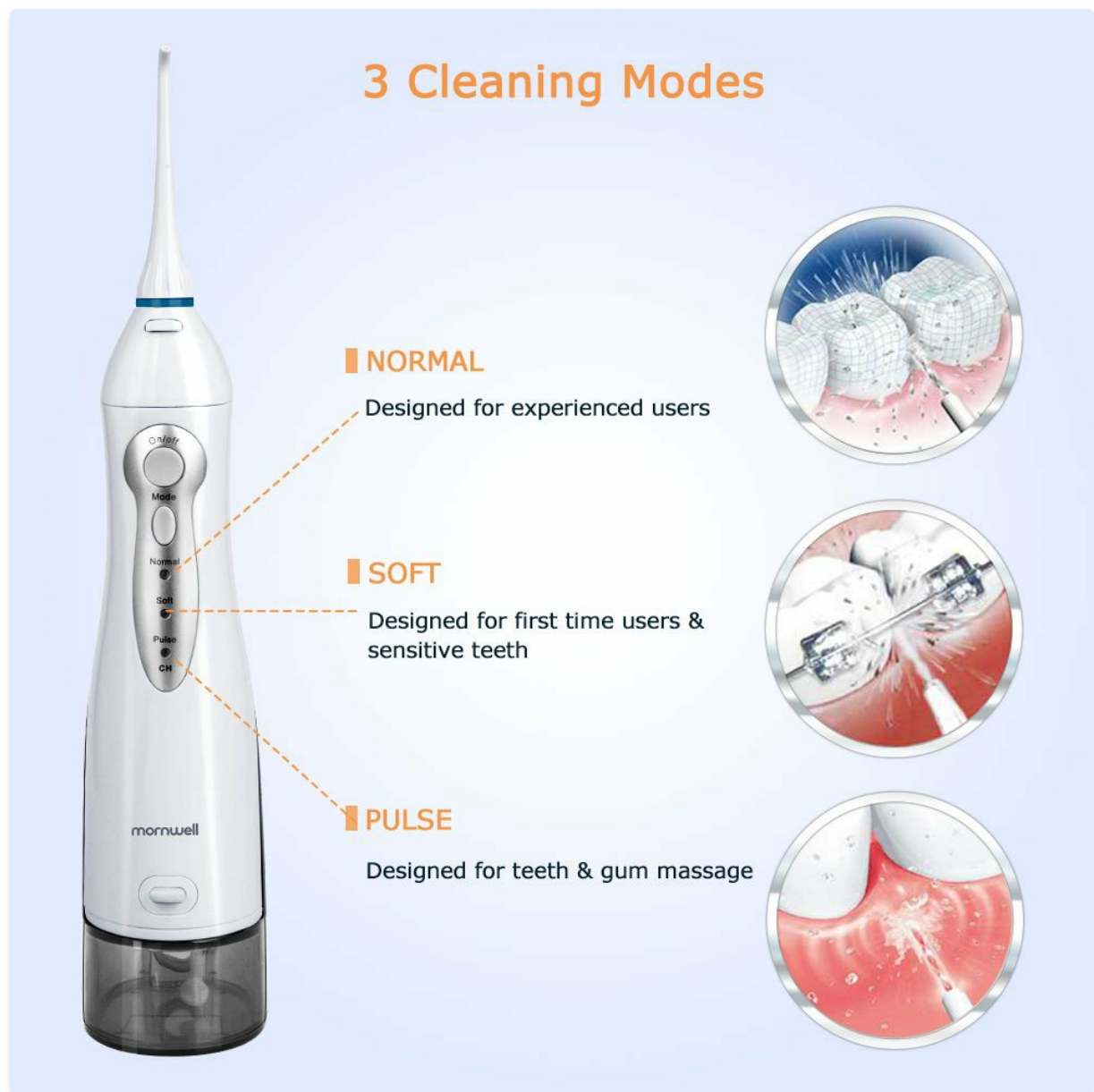
Image: The water flosser with its large, detachable 300ml water tank.