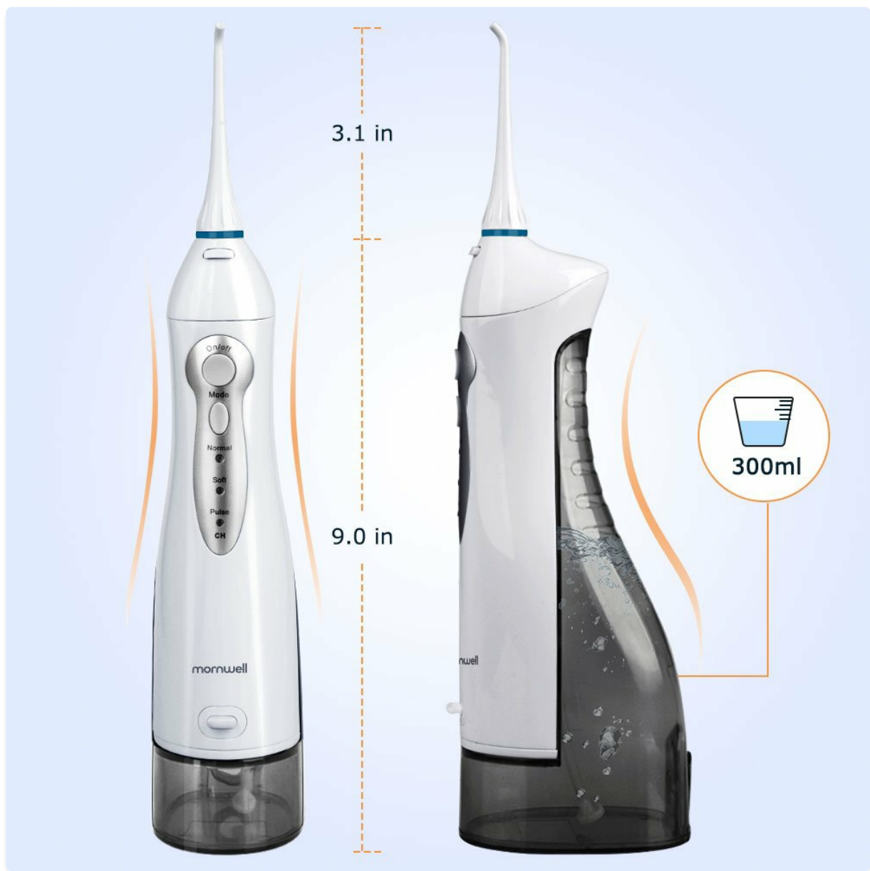
Image: Explanation of the three distinct cleaning modes available on the water flosser.