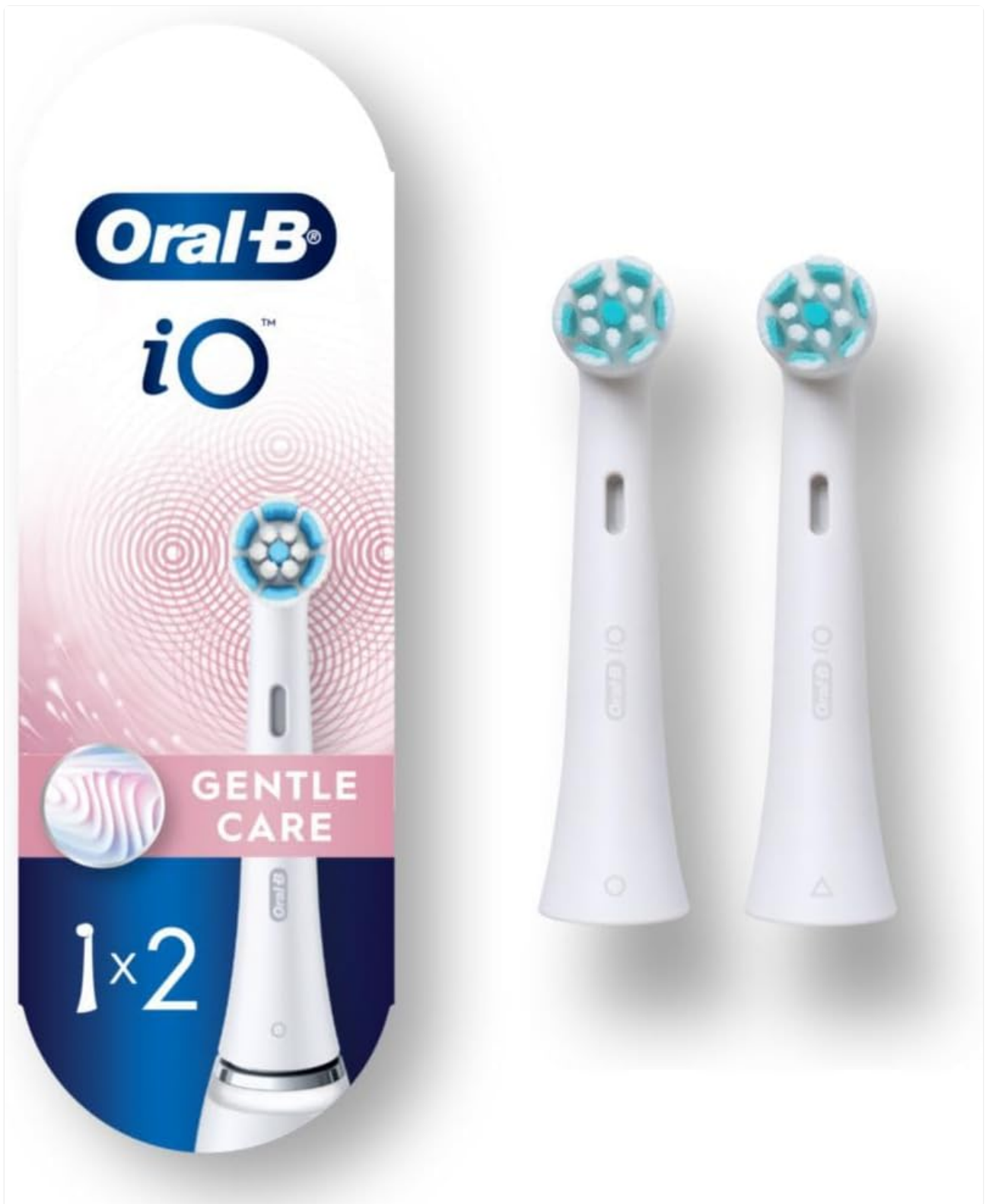
Image: Packaging of Oral-B iO Gentle Care Replacement Brush Heads alongside two individual brush heads, highlighting the product's appearance.