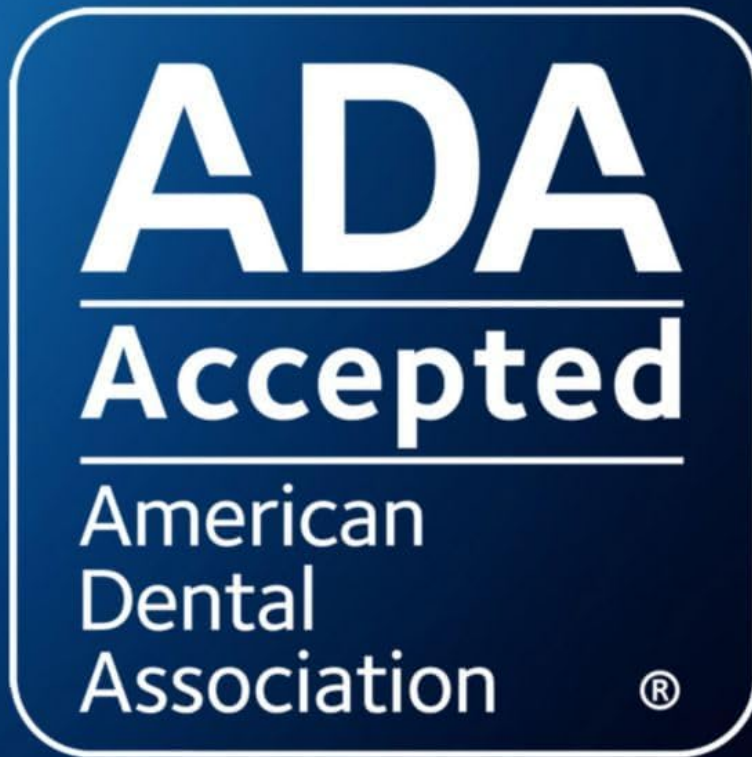
Image: The official "ADA Accepted" logo of the American Dental Association, indicating product endorsement.