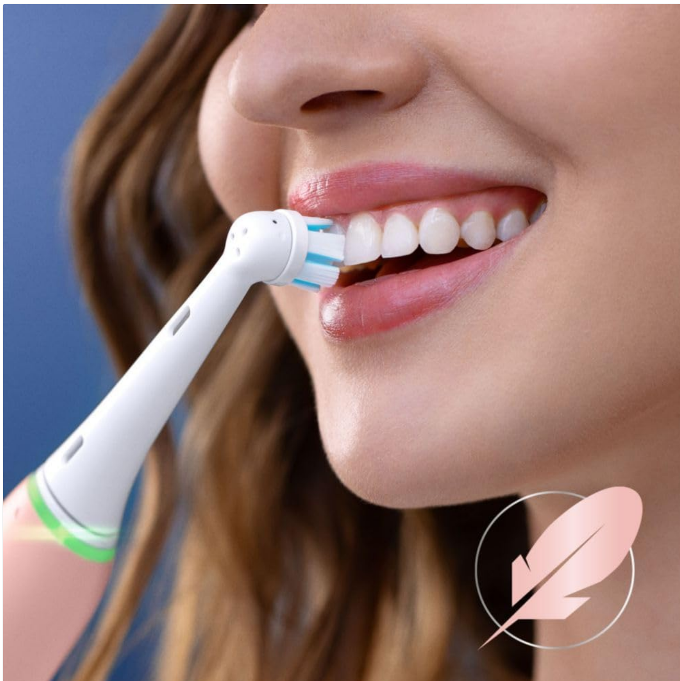
Image: A person demonstrating the use of an Oral-B iO electric toothbrush with the Gentle Care brush head, showing the brush in action against teeth and gums.