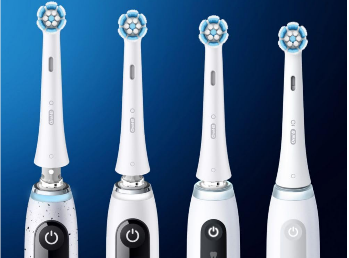
Image: Several Oral-B iO electric toothbrush handles with the Gentle Care brush heads attached, illustrating compatibility across the iO series.