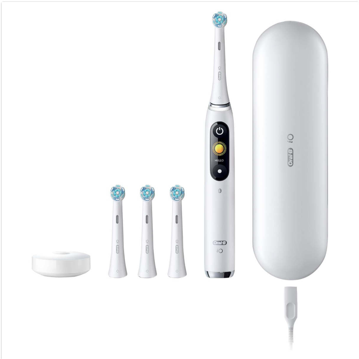
Image: Oral-B iO Series 9 Electric Toothbrush components including the handle, multiple brush heads, charging base, and travel case.