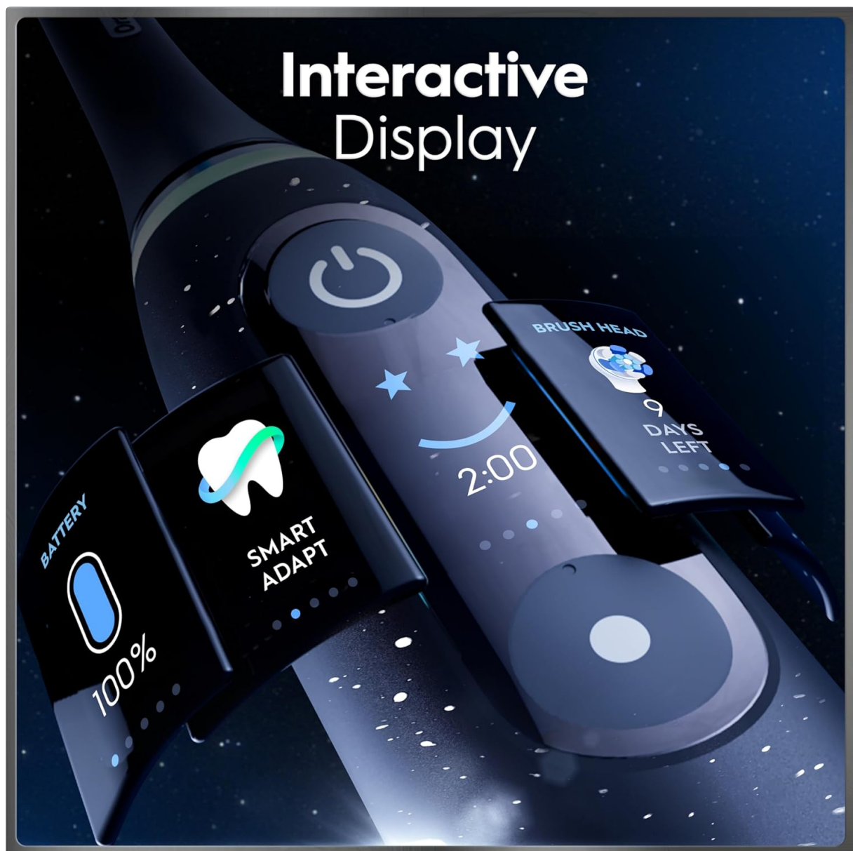
Image: Close-up of the interactive color display on the Oral-B iO Series 9 handle, showing battery percentage, current brushing mode (Smart Adapt), and a countdown for brush head replacement.

For enhanced guidance, connect your toothbrush to the Oral-B app via Bluetooth. The app provides 3D Teeth Tracking and AI Recognition to offer real-time feedback and ensure thorough cleaning across all areas of your mouth.