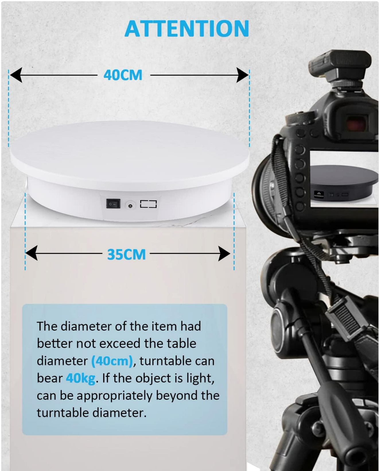
Image: Diagram showing the turntable dimensions (40cm diameter) and the recommended maximum item diameter, along with the 40kg weight capacity.