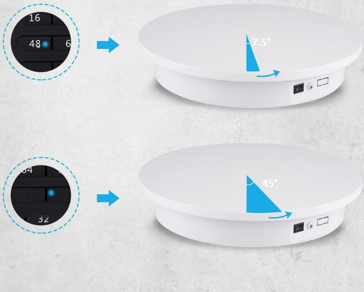
Image: Examples of intermittent rotation, showing how pressing '48' results in 7.5° increments and '8' results in 45° increments.

For example, if you press the "8" key, the turntable will pause for three seconds every 45 ° rotation. If there are no other operations, the turntable will continue to rotate at this pace.