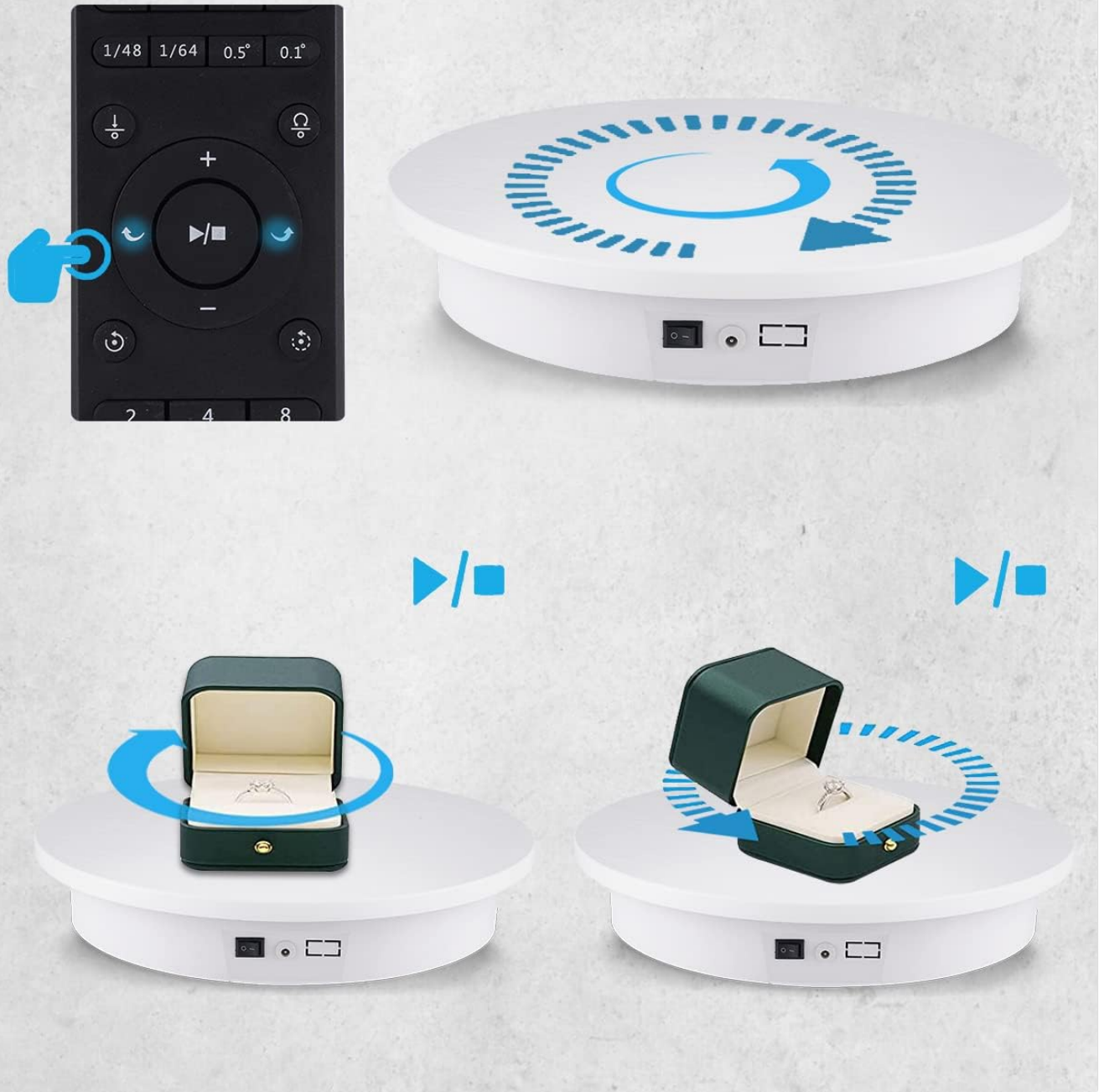
Image: Illustration showing the turntable rotating both clockwise and counter-clockwise, controlled by the remote.

Rotate back and forth, stop and start is really easy to do as you just push a button.