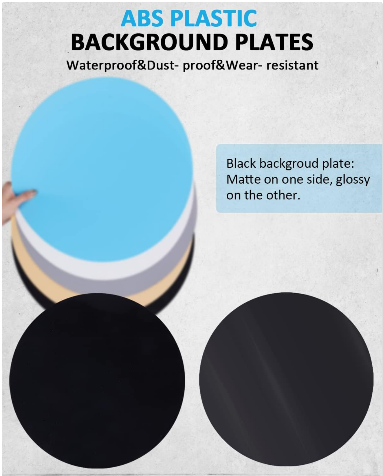
Image: Included ABS plastic background plates in various colors, including black with matte and glossy sides.