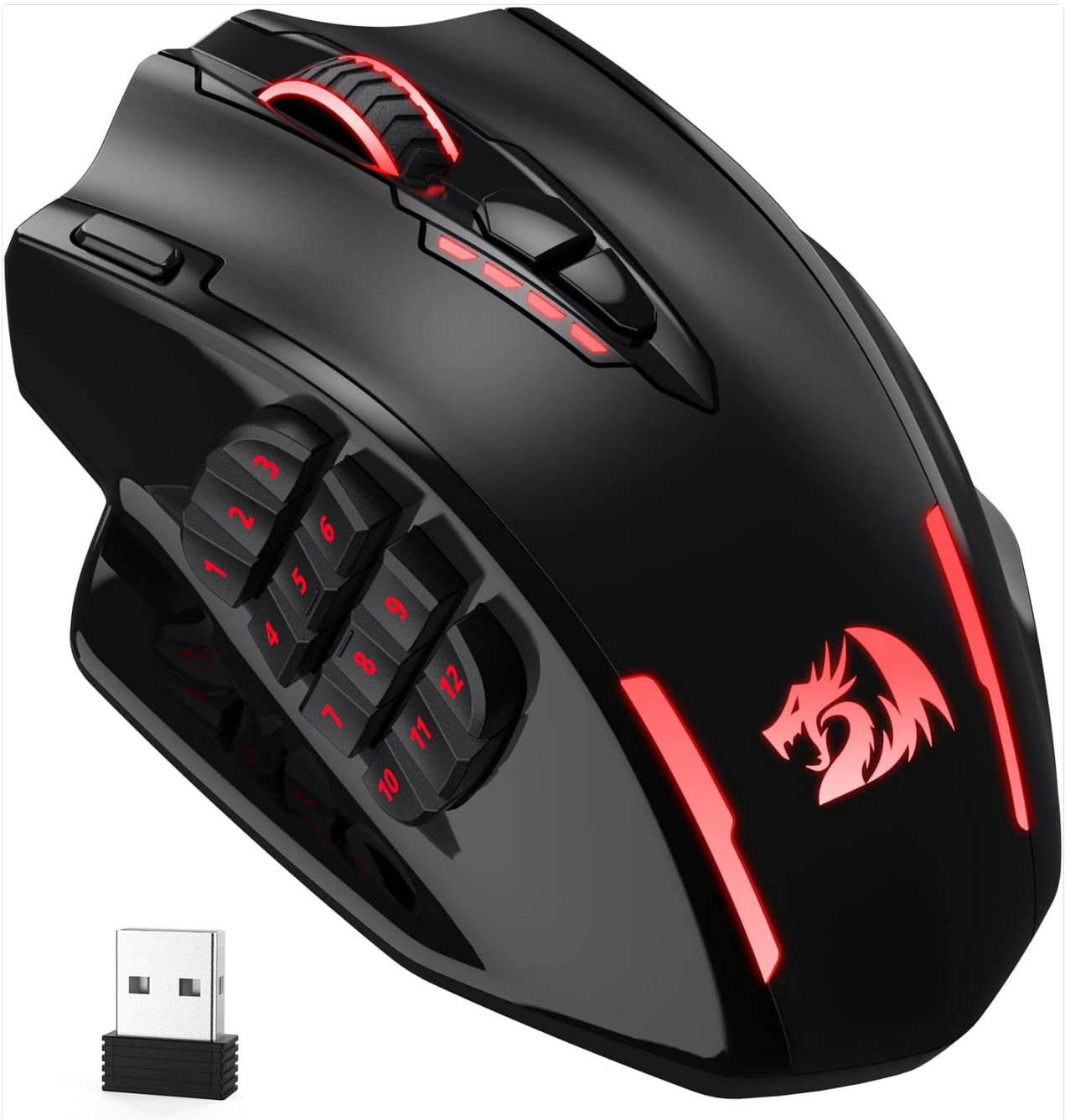
The Redragon M913 Impact Elite Wireless Gaming Mouse, showcasing its design and the included USB receiver.