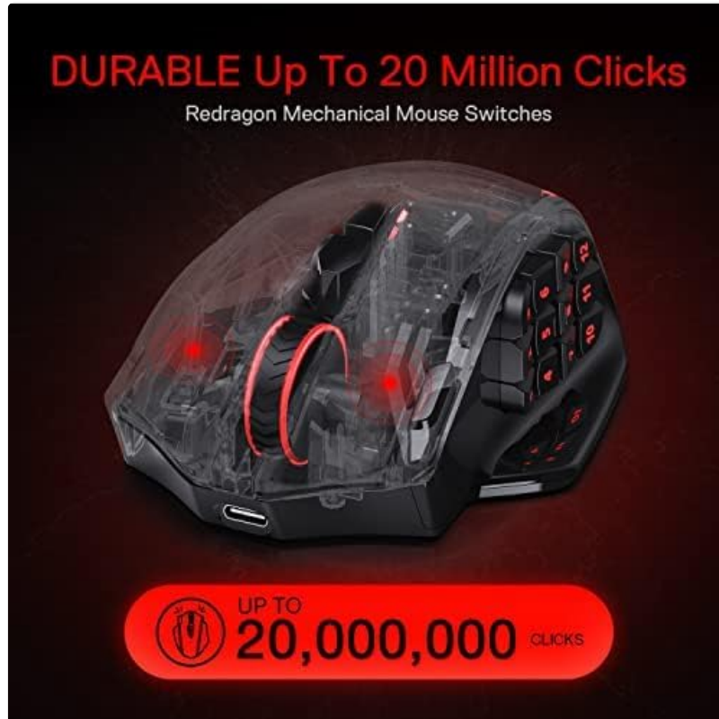
The Redragon M913 mouse with its USB receiver, highlighting the wireless connectivity option.