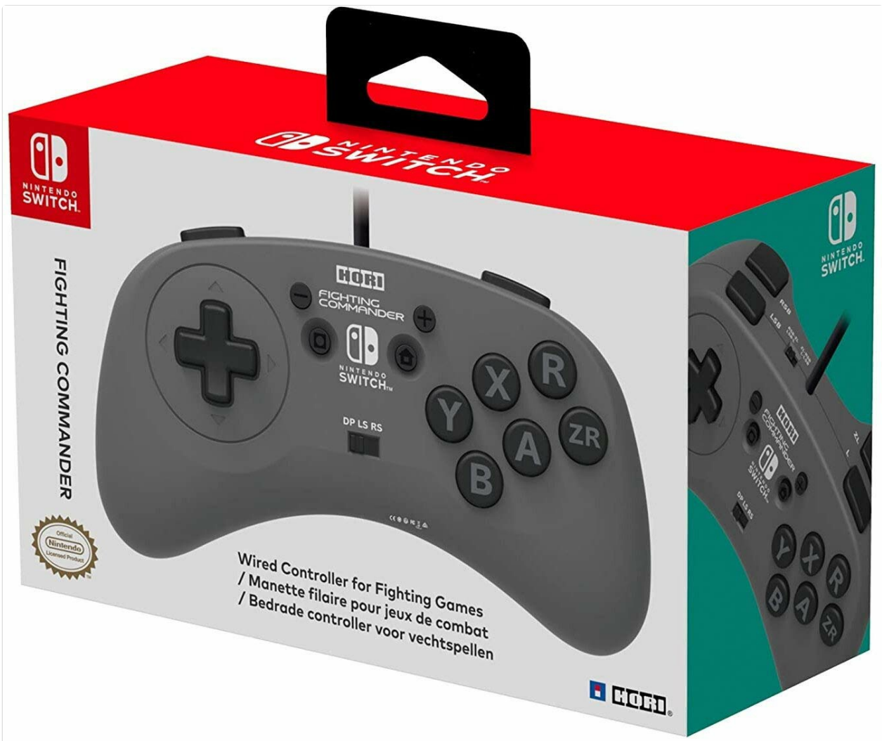
Figure 1: Top-down view of the HORI Nintendo Switch Fighting Commander controller, showing the D-pad, six face buttons (X, Y, A, B, R, ZR), and the DP LS RS toggle switch.