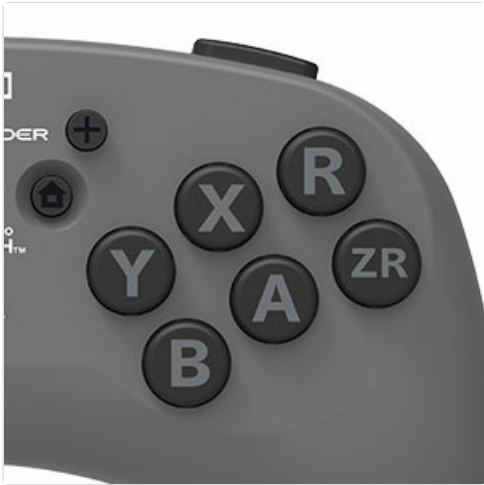
Figure 5: Close-up of the six-button layout (X, Y, A, B, R, ZR) designed for fighting games.