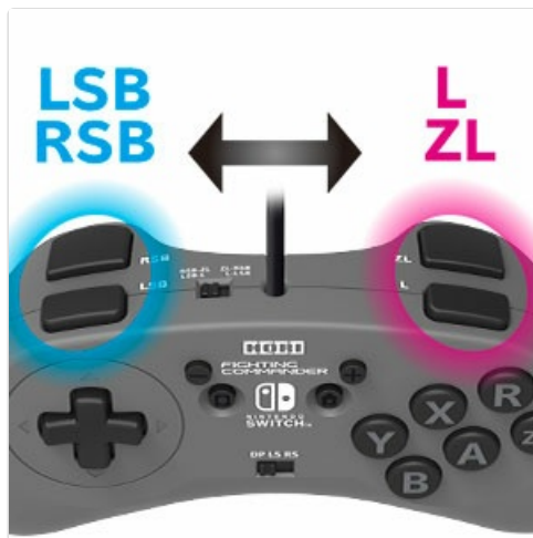
Figure 6: Diagram illustrating the functionality of the LSB/RSB and L/ZL toggle switch for shoulder button assignment.