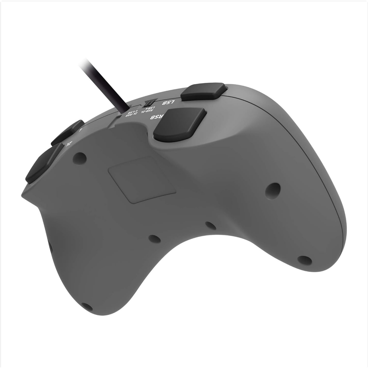
Figure 4: Top view of the controller, clearly showing the LSB, RSB, ZL, and L shoulder buttons and their assignment switch.