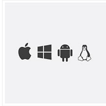
Image: Icons indicating compatibility with Apple, Windows, Android, and Linux operating systems.