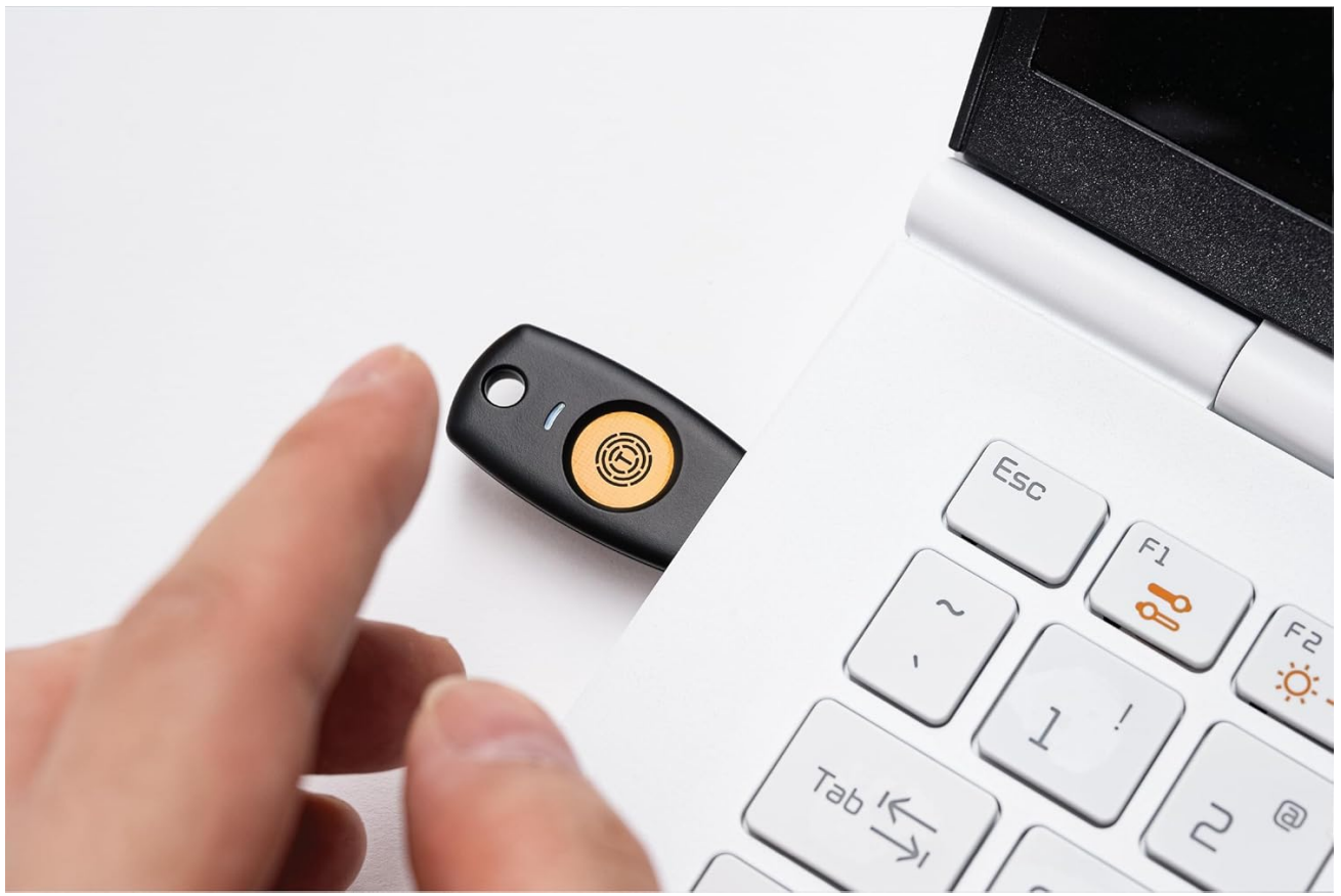
Image: A user's finger touching the gold disk on the TrustKey T120, indicating the touch-to-authenticate action.

Image: The TrustKey T120 security key positioned next to a laptop's USB-C port, ready for connection.