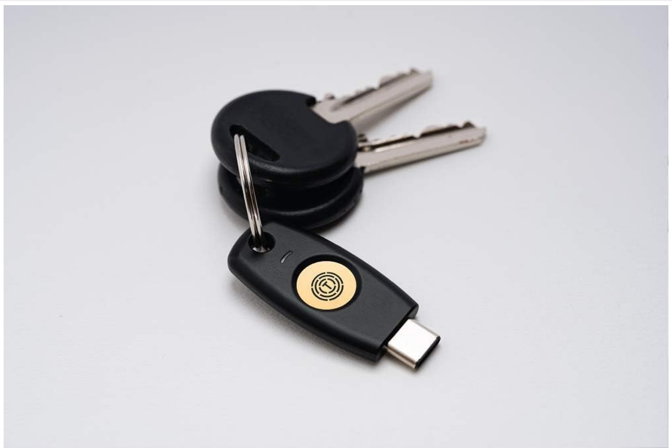
Image: The TrustKey T120 security key, a compact USB-C device, shown on a keyring with two standard keys.

The TrustKey T120 is a FIDO2 and U2F certified security key designed to protect your online accounts with strong two-factor authentication (2FA). It utilizes public and private key cryptography to offer a fast and secure login experience, safeguarding against phishing and account takeover attempts. The T120 features a USB-C connector and a capacitive touch sensor for user presence verification.