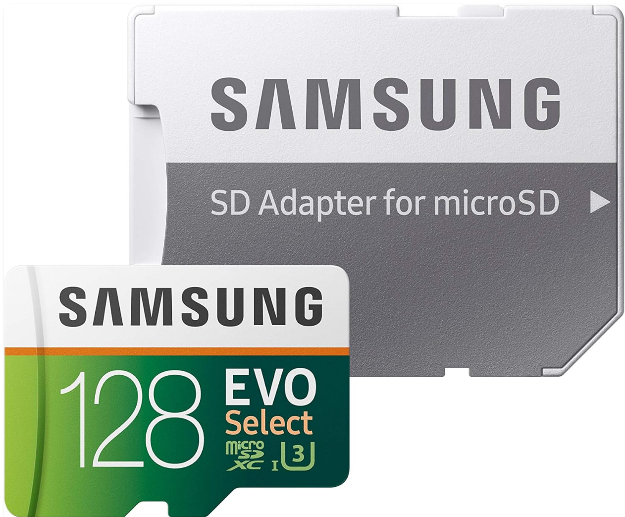
Figure 2.1: Samsung EVO Select 128GB microSD card and SD adapter.