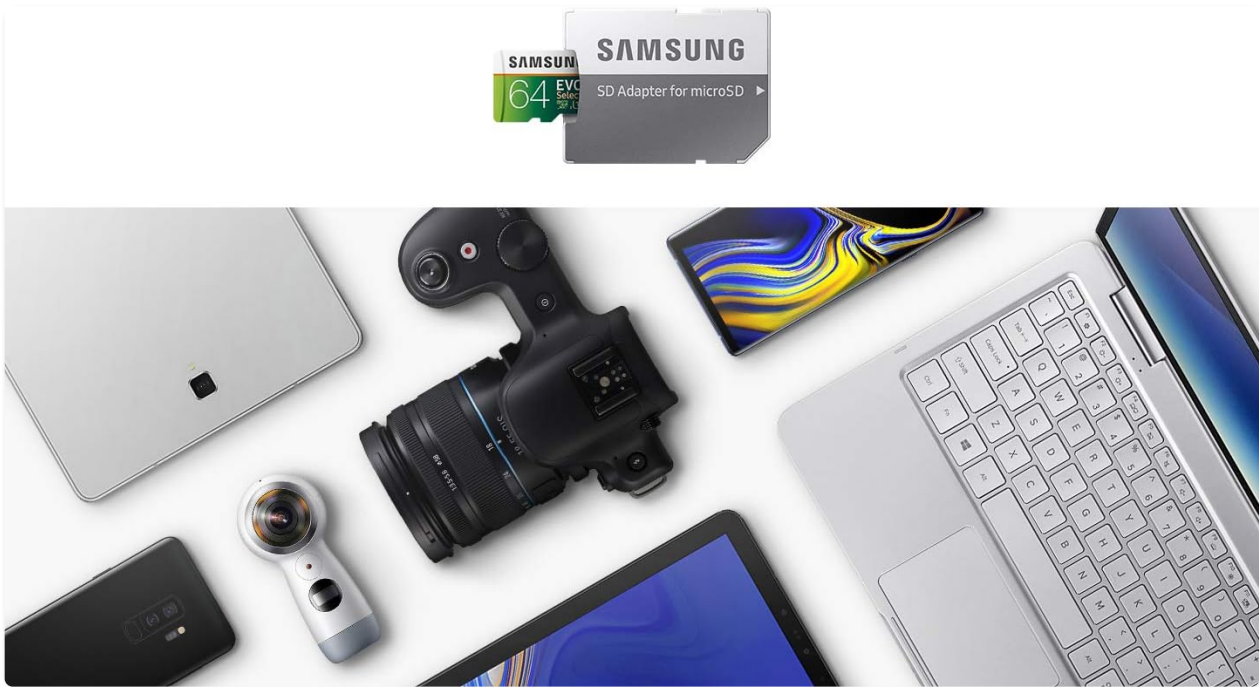
Figure 4.1: Compatible devices for the Samsung EVO Select microSD card.