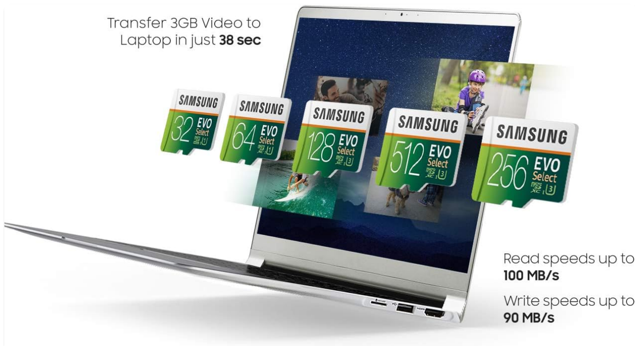
Figure 4.2: High-speed data transfer to a laptop.

The card offers ultra-fast read speeds of up to 100MB/s and write speeds of up to 60MB/s (performance may vary based on host device, interface, usage conditions, and other factors). This allows for quick transfer of large files.