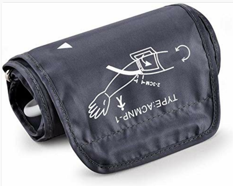
Image 1: The LAZLE XXL Blood Pressure Cuff. This image displays the gray fabric cuff with white instructional markings, including an arrow indicating artery alignment, an arm diagram for proper placement, and the model type 'ACMNP-1'. A white plastic connector ring is visible on the left side.

The LAZLE XXL Blood Pressure Cuff is a replacement or supplementary cuff for automatic upper arm blood pressure monitors. It features a durable fabric construction and a secure fastening mechanism, designed for arm circumferences ranging from 9 to 20.5 inches.