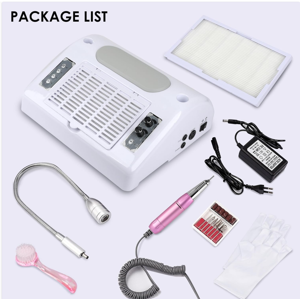
Figure 2: Contents of the product package.