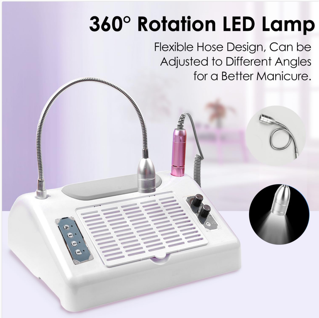
Figure 3: The 360° rotatable LED desk lamp provides adjustable lighting.

Video 1: Demonstrates the setup process including connecting the desk lamp, power, and nail drill.