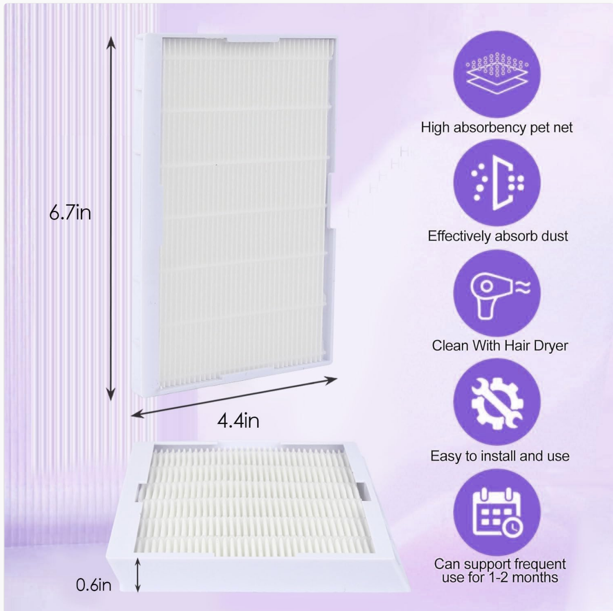
Figure 7: The nail dust filter is designed for effective dust absorption and easy cleaning.

Video 2: Demonstrates how to clean and replace the nail dust collector filter.