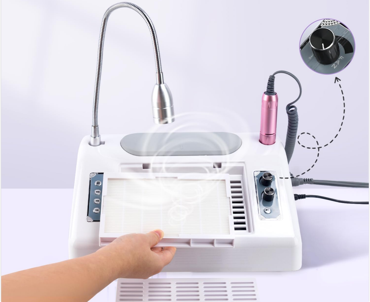
Figure 4: The powerful 40W nail dust collector with adjustable suction.

40W adjustable power & 2 replacement filters