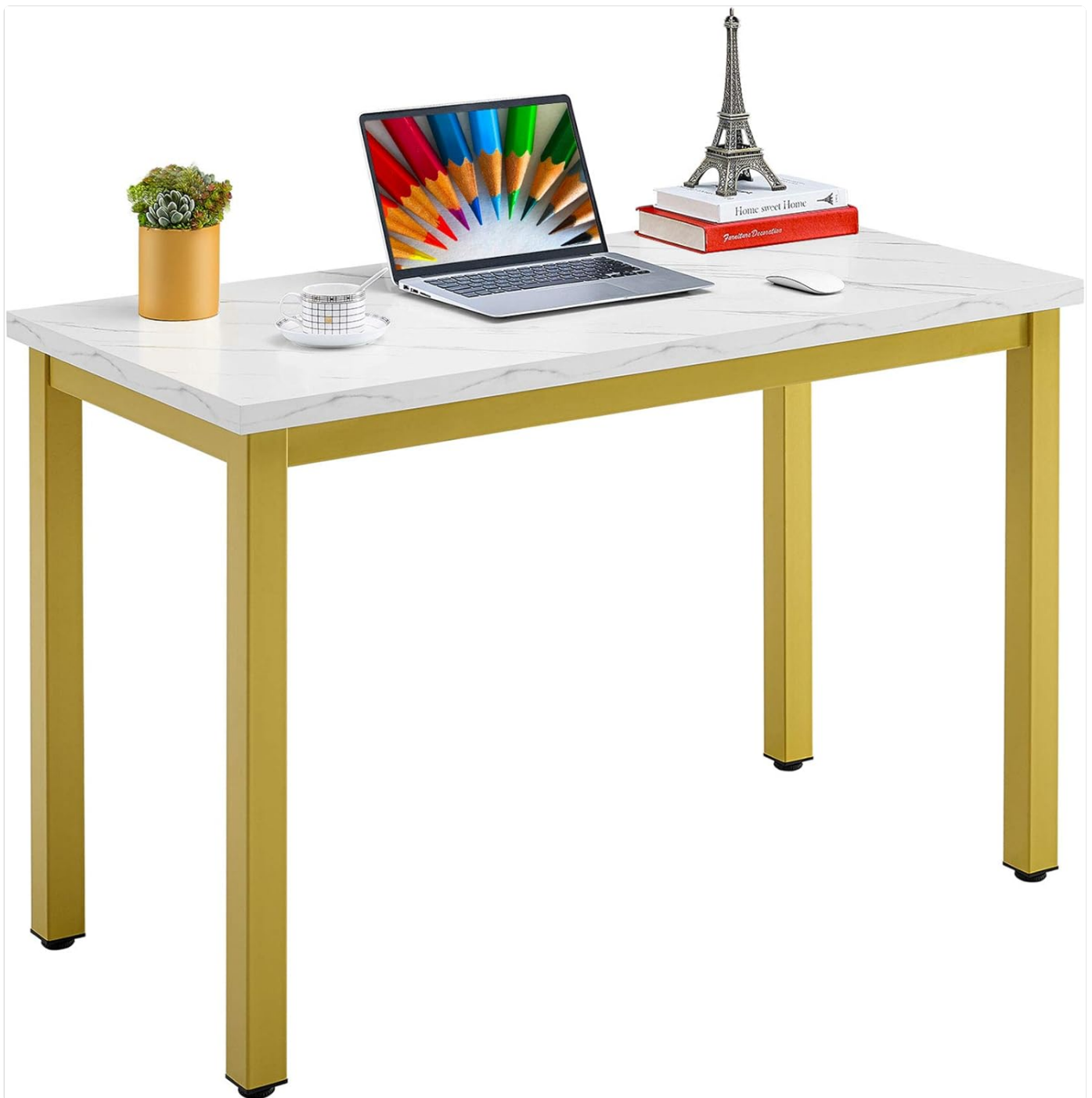
Figure 1.1: The Mr IRONSTONE 39.4-inch Folding Computer Desk, showcasing its compact and functional design.