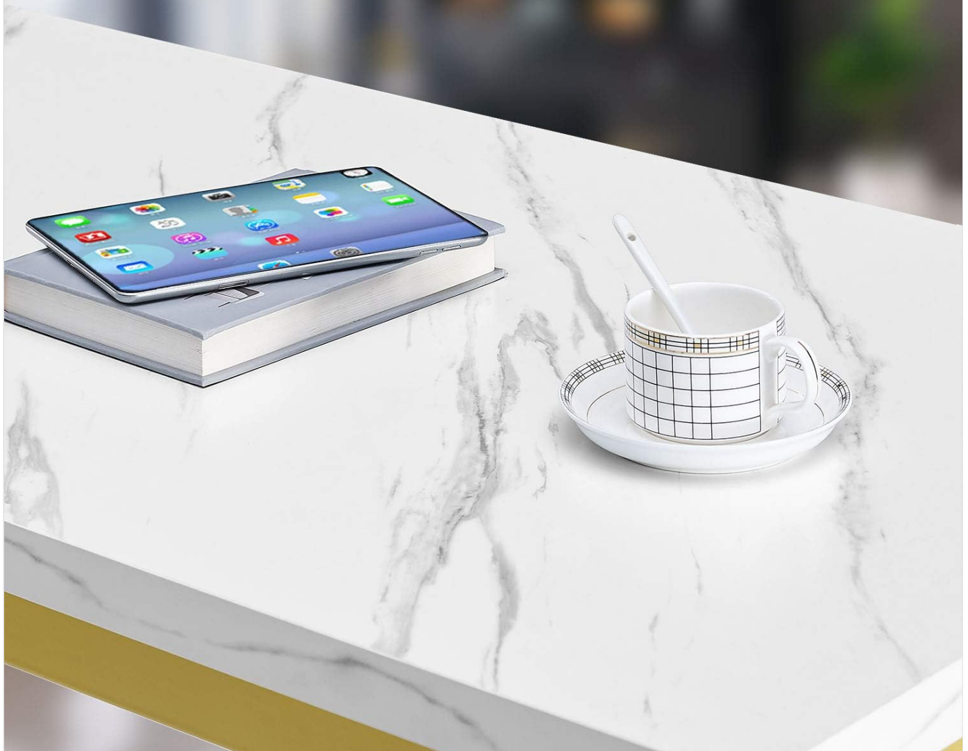
Figure 4.1: Key features of the desk, including the adjustable foot for stability, the thickened metal frame for durability, and the robust desk board.

The stylish laminate marble top adds a dazzling look to the work area.