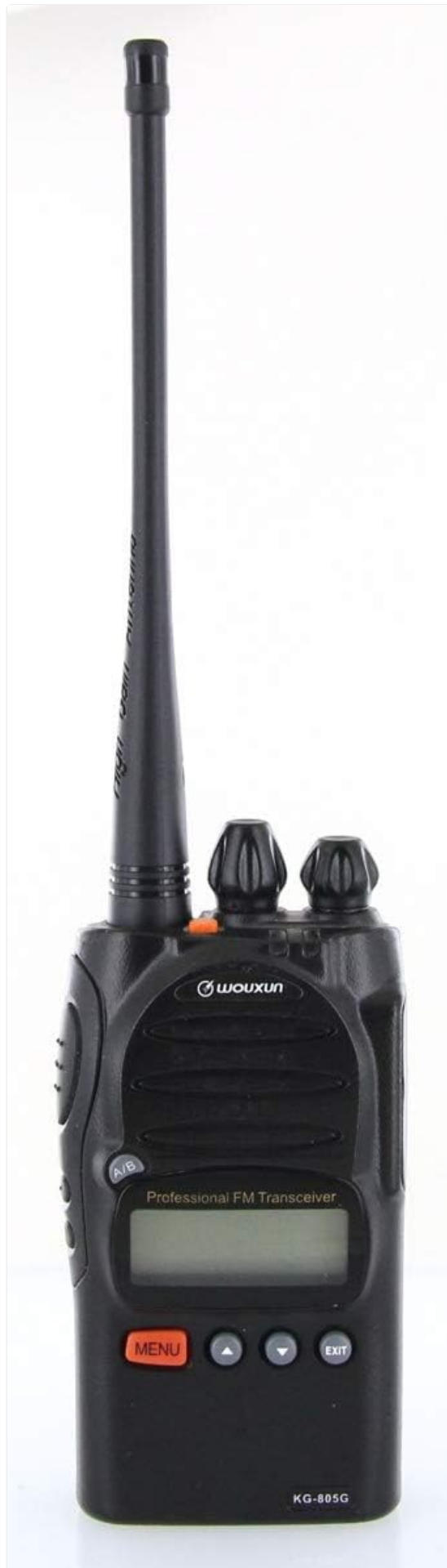
Figure 1.1: Wouxun KG-805G GMRS Two Way Radio with included antenna.