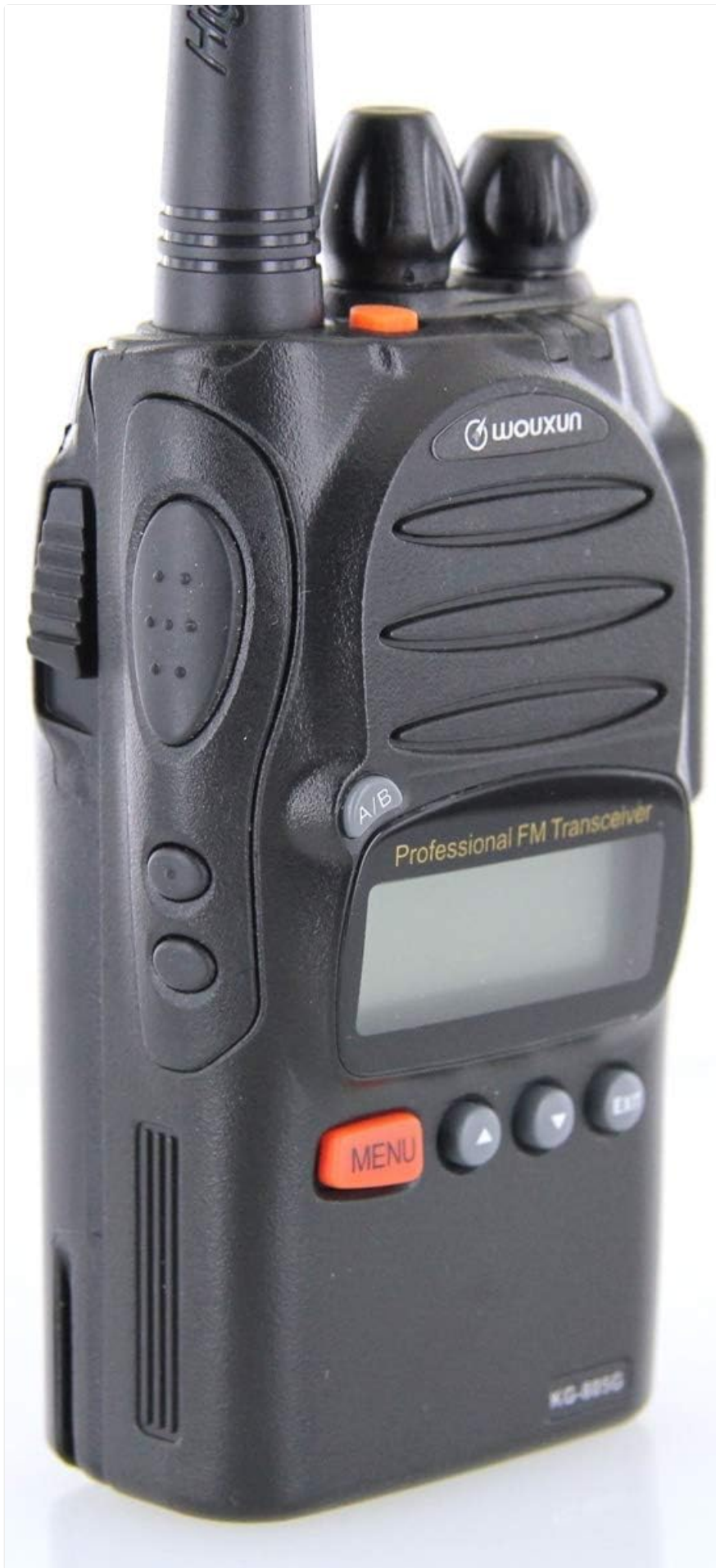
Figure 3.2: Side view of the Wouxun KG-805G, showing the Push-To-Talk (PTT) button and two programmable side buttons.