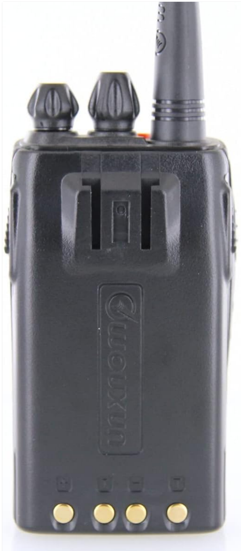
Figure 4.1: Back view of the Wouxun KG-805G, showing the battery contacts and mounting area.