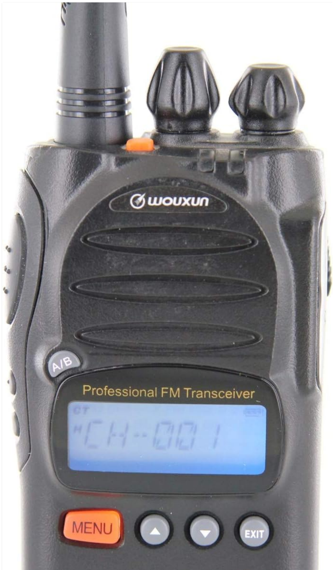
Figure 5.1: The radio's LCD display showing 'CH-001', indicating the selected channel.