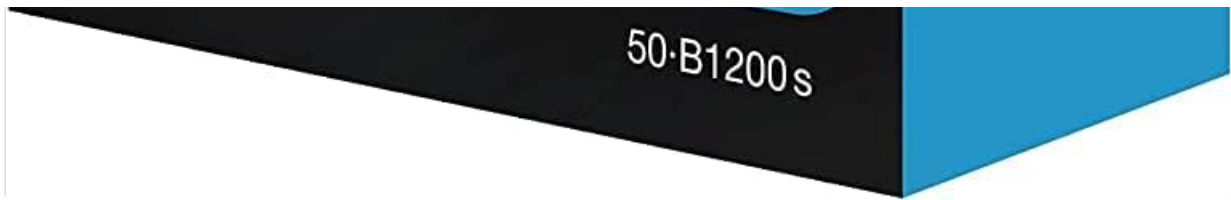
Image: The Braun Series 5 shaver, illustrating the EasyClean system which allows for quick rinsing under water without removing the shaver head.