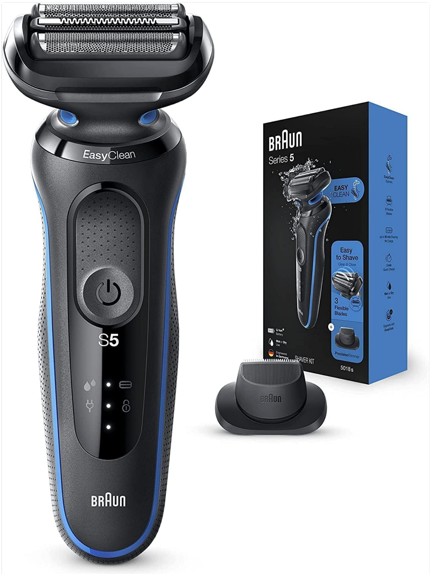
Image: The Braun Series 5 electric shaver, its charging stand, and packaging, highlighting its key features.