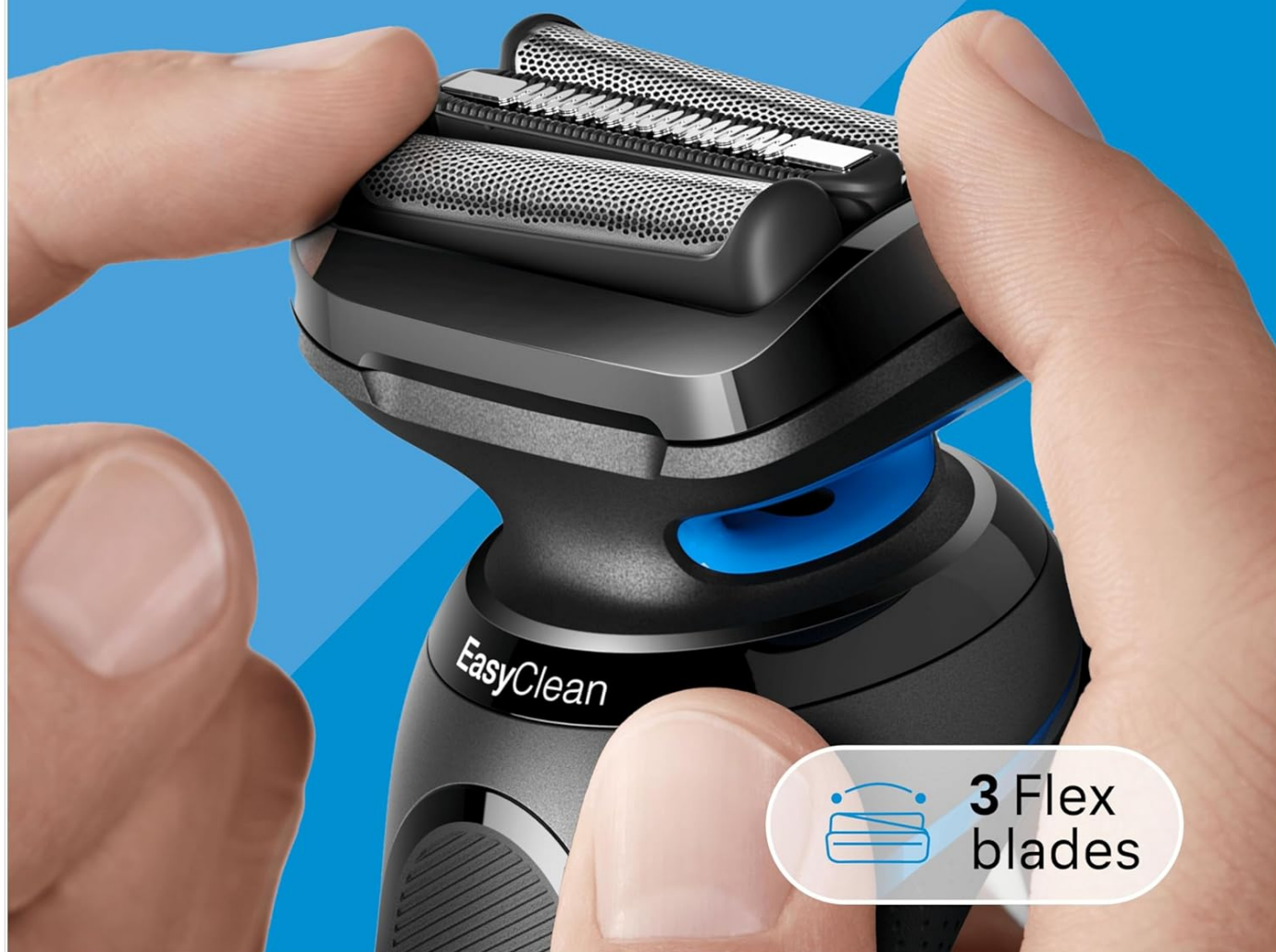
Image: A close-up view of the shaver head, illustrating how the three flexible blades adapt to facial contours for an effective shave.

Adapt to your contours for a close shave.