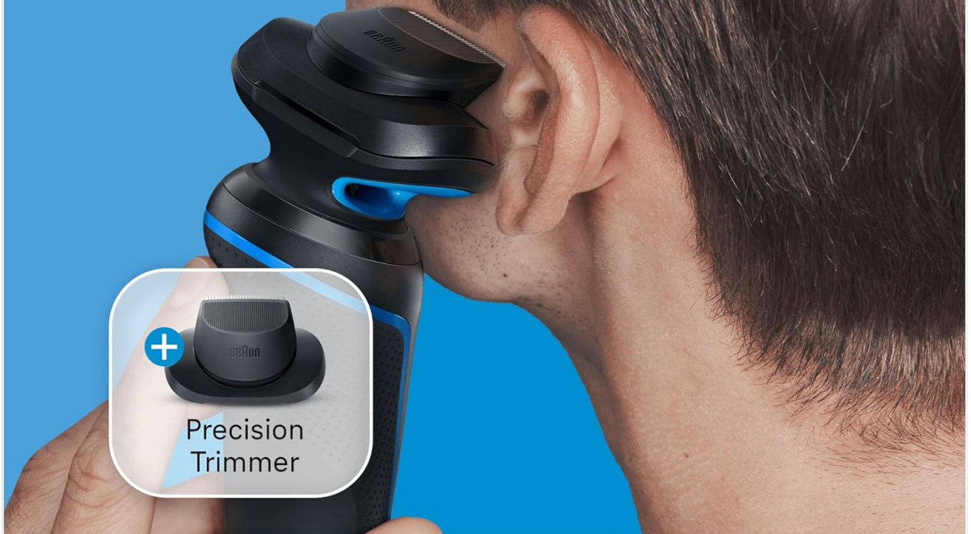
Image: The Braun Series 5 shaver with the precision trimmer attachment connected, demonstrating its all-in-one grooming capability.