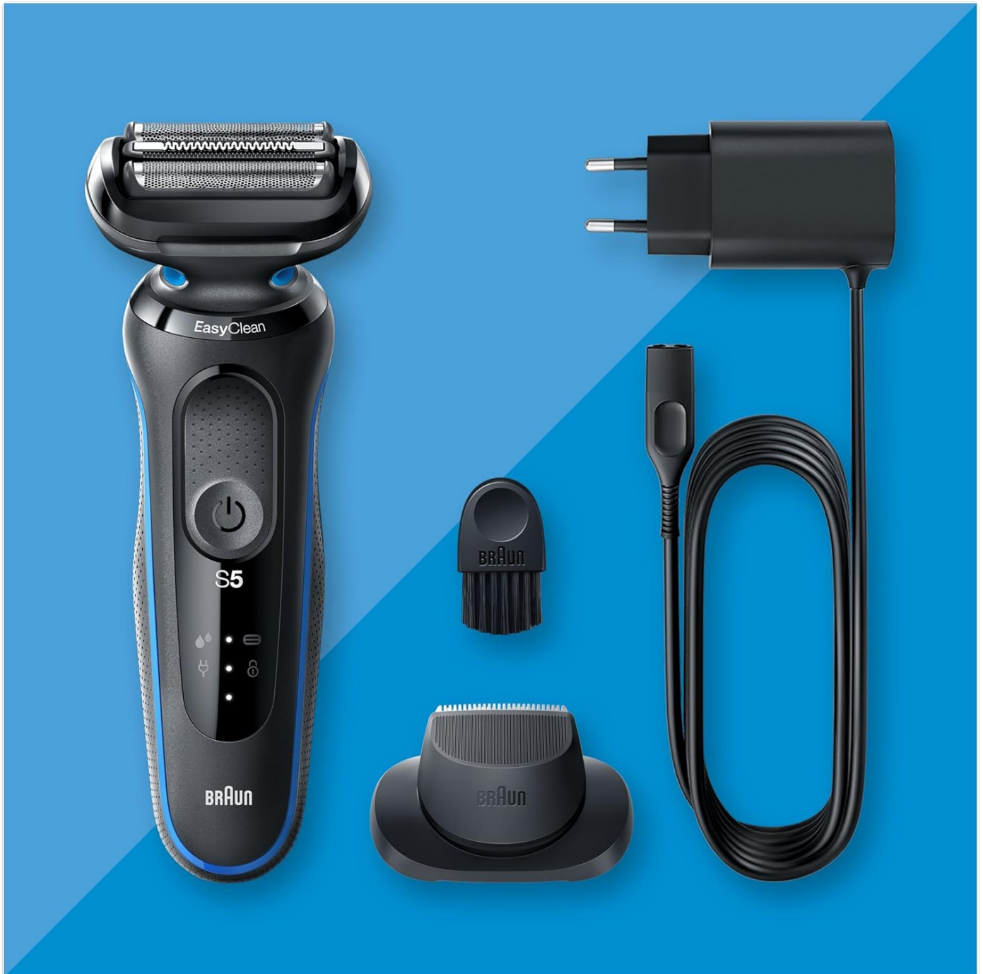
Image: All components included with the Braun Series 5 shaver: the shaver unit, precision trimmer attachment, cleaning brush, and smart plug charger.