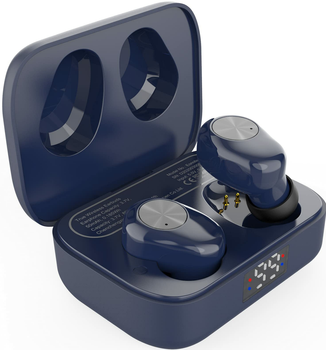
Figure 1: Eono Eonobuds 1 Wireless Bluetooth Earbuds (Blue)