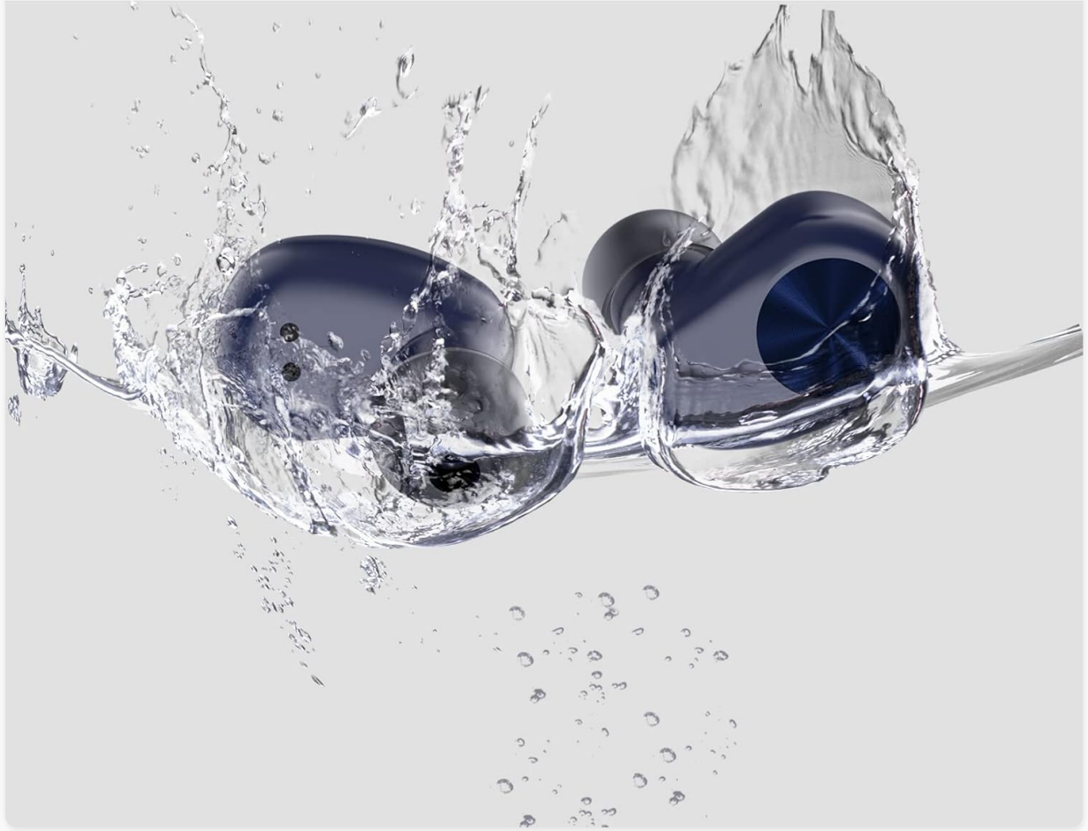
Figure 8: Earbuds demonstrating IPX7 water resistance.