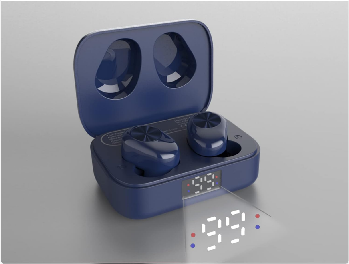
Figure 4: Charging case with LED battery level display.