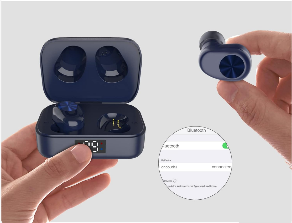
Figure 5: Charging the Eonobuds 1 case via USB-C.

充電ケースからワイヤレスイヤホンを取り出すだけで、最後にペアリングされた機器に自動的に接続します。