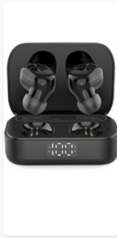
Figure 2: Contents of the Eonobuds 1 package.