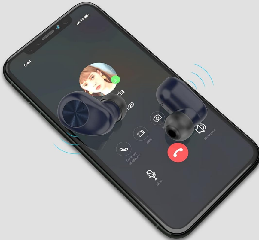
Figure 3: Earbud components including multi-function button and charging contacts.

Makes the call clearer and ensures a smoother CVCノイズキャンセリング搭載