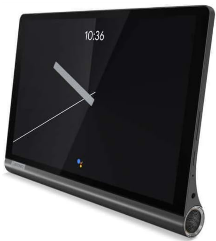
Image: The Lenovo Yoga Smart Tab in landscape mode, showcasing its integrated kickstand and cylindrical battery housing, which also contains the

Key features include a vibrant 10.1-inch FHD display, integrated speakers for enhanced audio, and a long-lasting battery. The distinctive cylindrical hinge houses the battery and provides a comfortable grip, while also integrating the kickstand for stand, tilt, and hang modes.