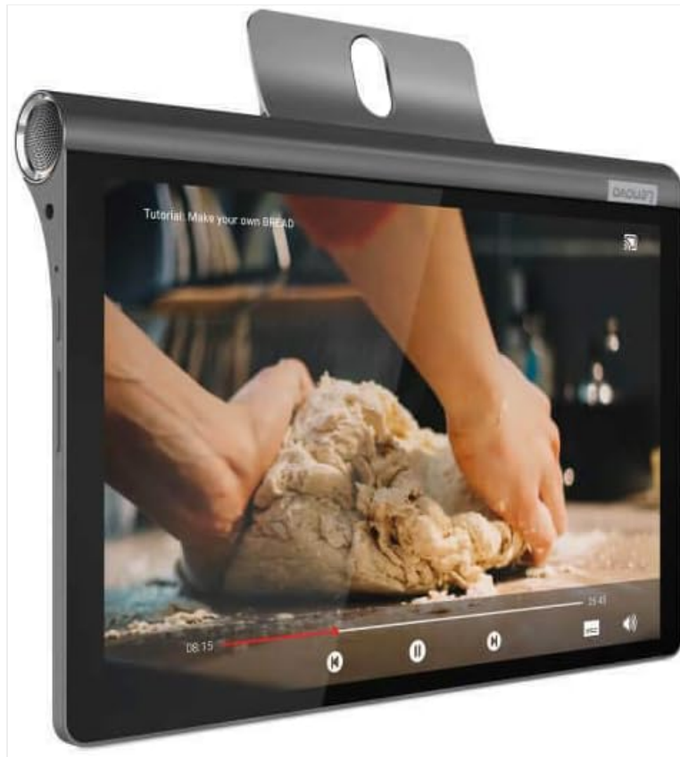
Image: The Lenovo Yoga Smart Tab displaying a video on its screen, demonstrating its capability for media consumption. The tablet is in landscape mode, likely using its kickstand.