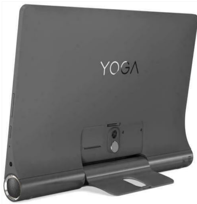
Image: A rear view of the Lenovo Yoga Smart Tab, highlighting its unique cylindrical hinge and the kickstand fully extended, ready for stand or hang mode.