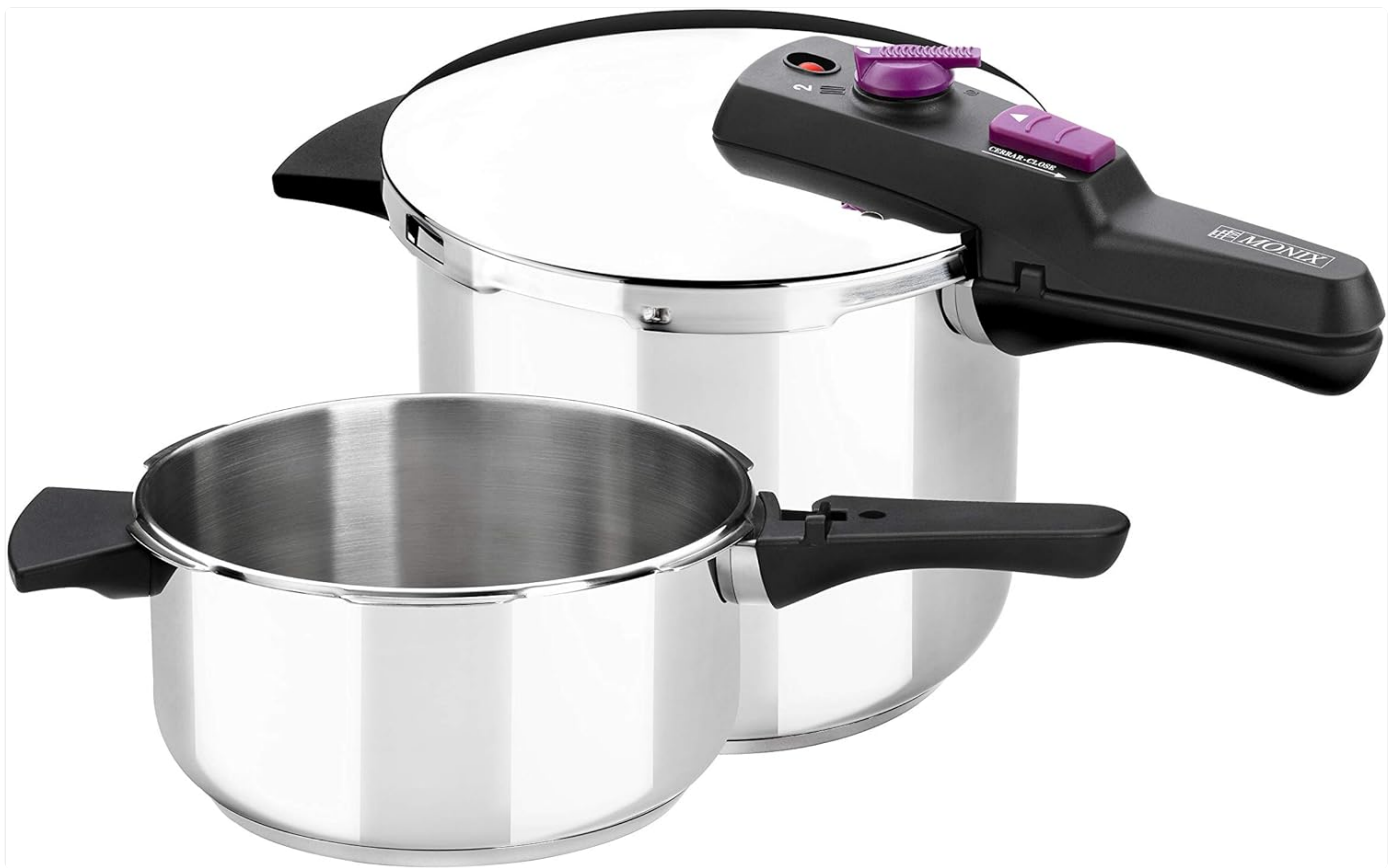
Image: The two stainless steel pots from the Monix Tempo set, a 4-liter and a 7-liter, shown without the lid or steamer basket, highlighting their individual sizes and polished finish.