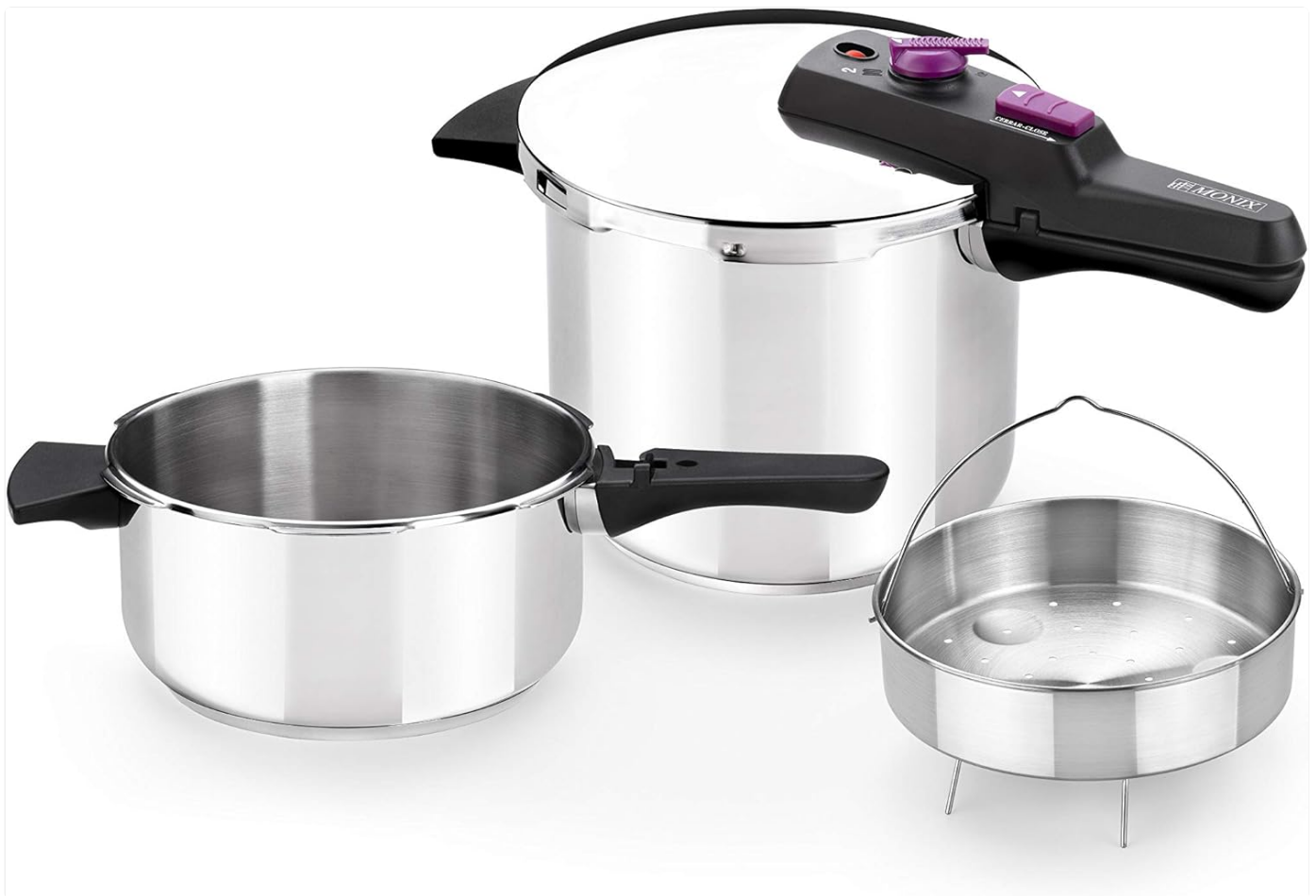
Image: The Monix Tempo Pressure Cooker Set, showcasing both the 4-liter and 7-liter stainless steel pots, along with the included steamer basket. The larger pot is fitted with the pressure cooker lid, featuring a black handle with purple controls.