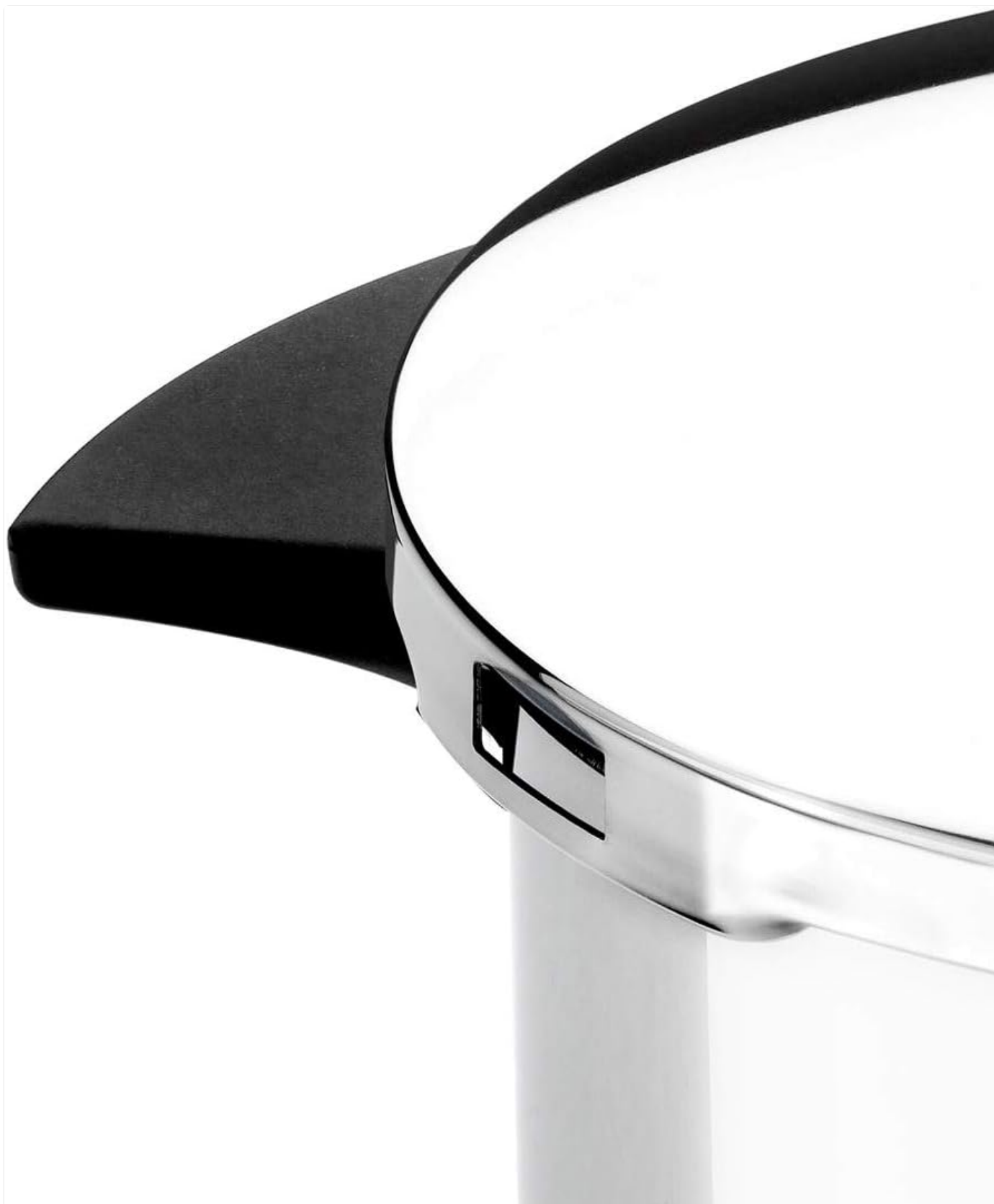
Image: A close-up view of the rim of the Monix Tempo pressure cooker pot, showing the sturdy stainless steel construction and the locking mechanism where the lid engages with the pot for a secure seal.