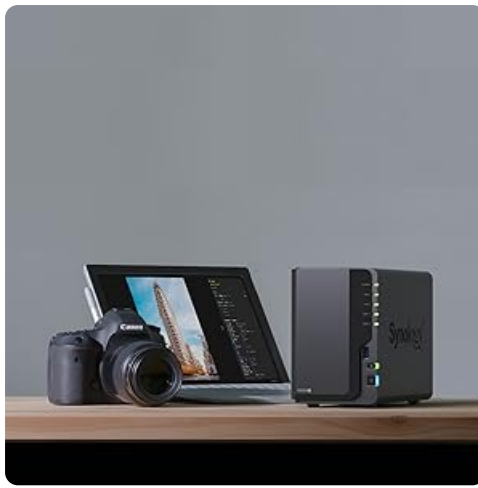
Figure 5: Synology Plus Series HDD, recommended for optimal performance.