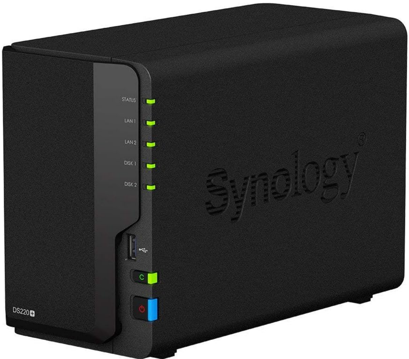
Figure 2: The Synology DiskStation DS220+ main unit.