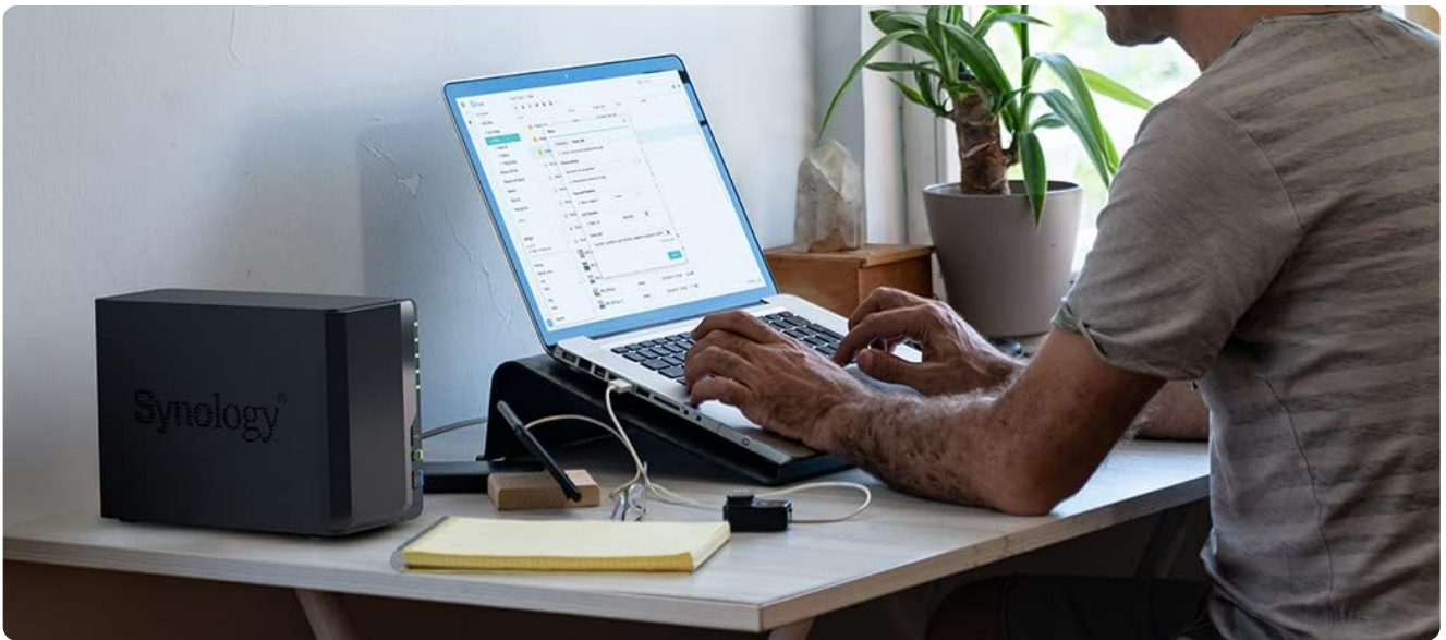
Figure 4: Synology DiskStation DS220+ integrated into a workspace.

After installing the drives, connect the AC power adapter and power cord to the device. Then, connect one or both RJ-45 LAN cables from the DS220+ to your network router or switch.