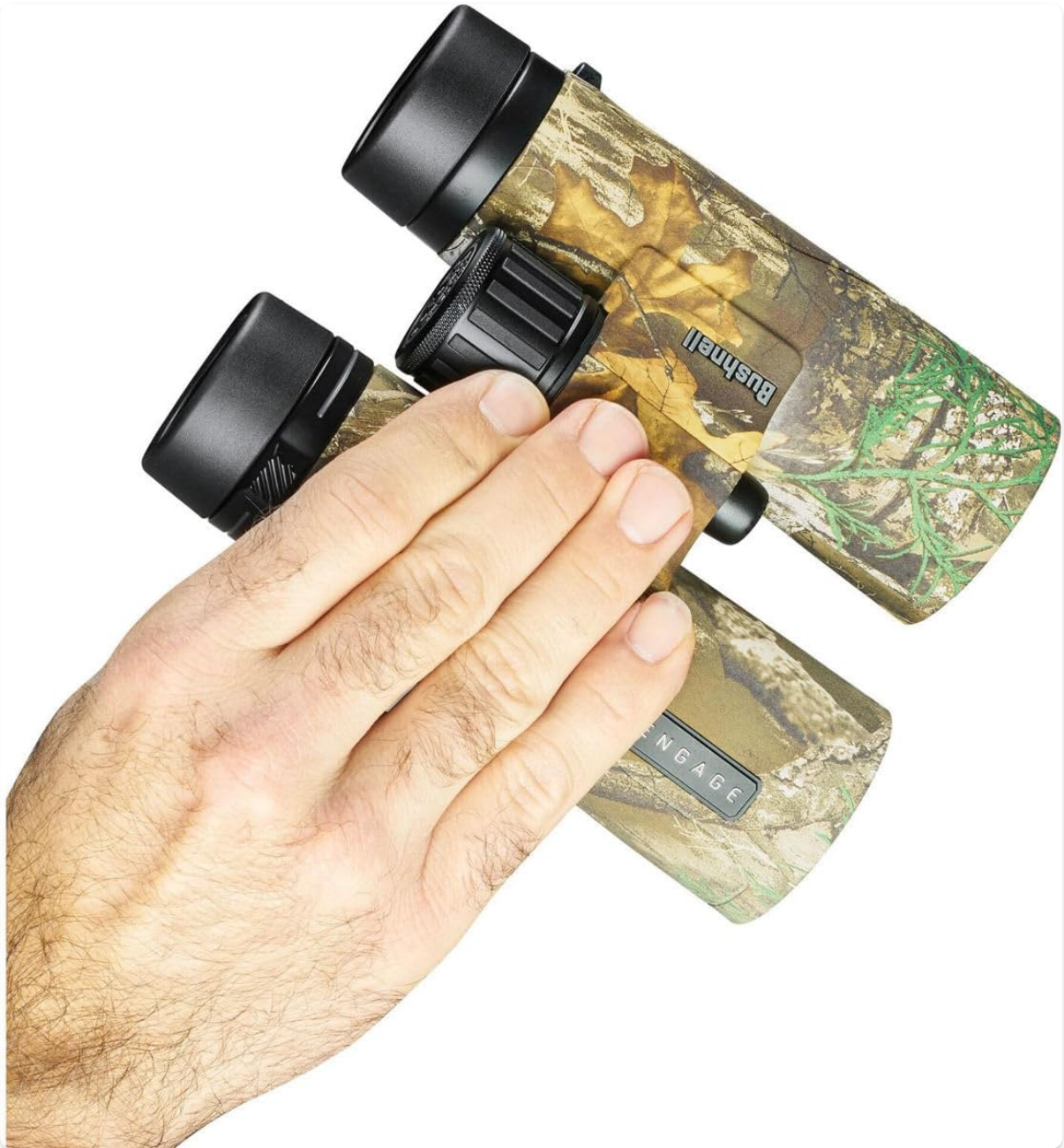
Figure 4: Ergonomic design for comfortable handling.