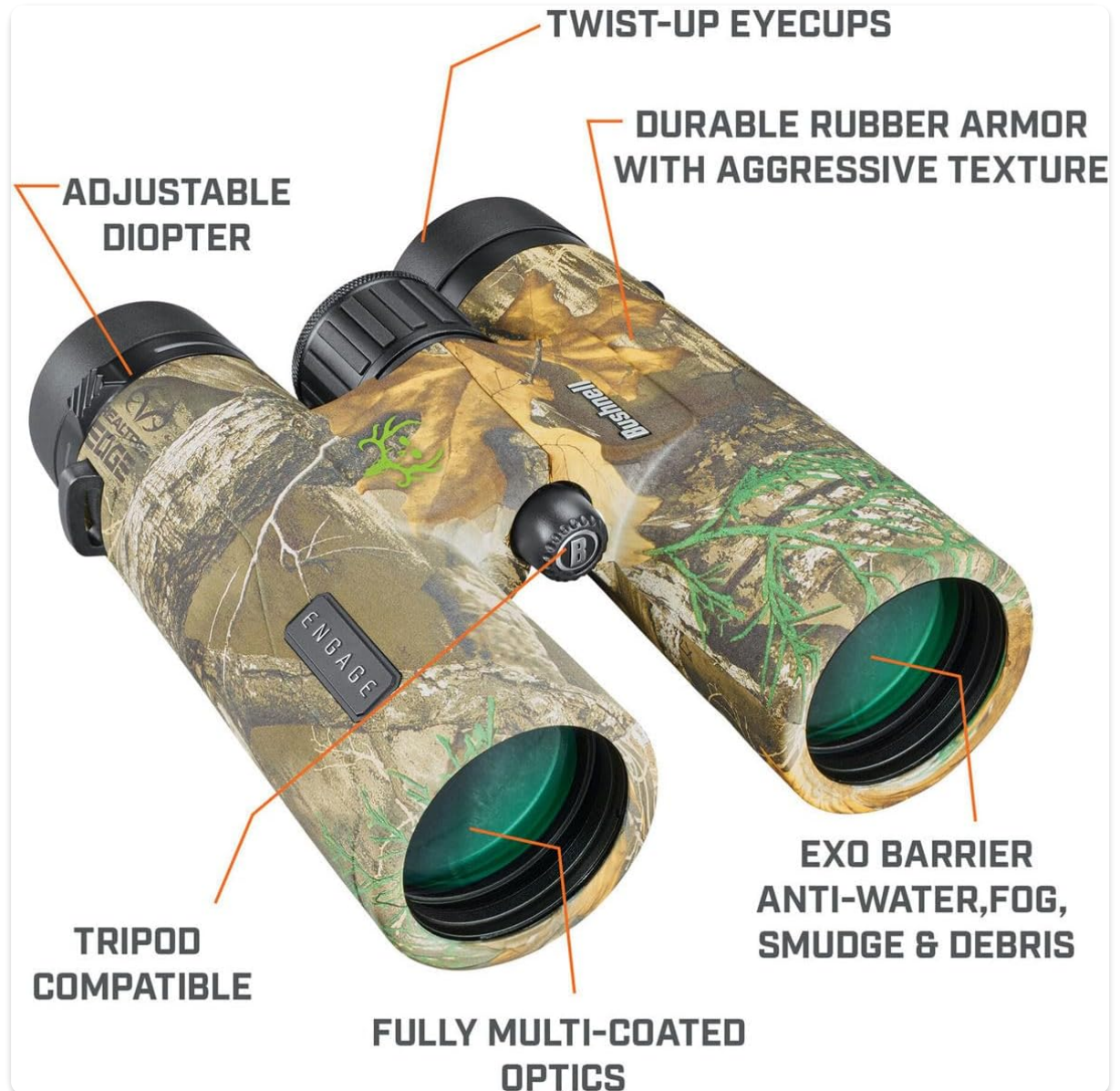
Figure 2: Key features and adjustment points of the binoculars.

Once the diopter is set, use the large center focus knob to bring objects into sharp focus. Turn the knob slowly until the image is clear.