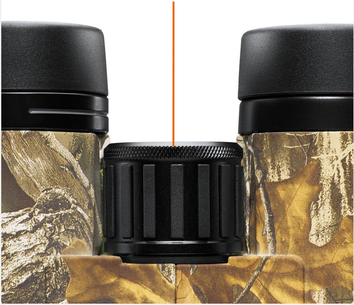
Figure 3: The central focus knob for adjusting image clarity.