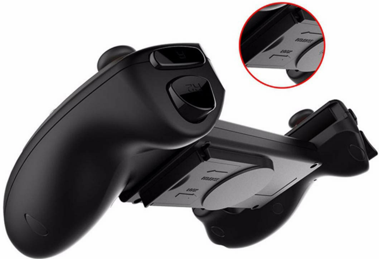
Figure 3.1: Detailed view of the security lock mechanism for the telescopic arm, illustrating how to extend and secure your device.