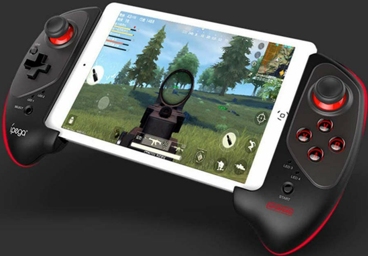
Figure 2.1: The ipega PG-9083S Wireless Gamepad, showcasing its design with a tablet inserted. This image highlights the sleek feel and how it holds a device.

Sleek feel designed to effectively relieve finger aches,easily play game throughout the day