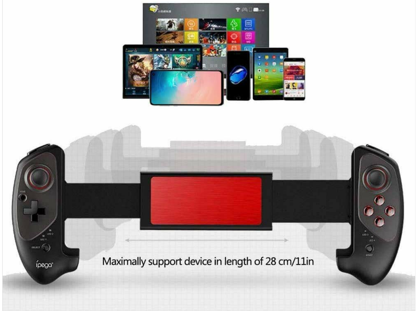
Figure 2.2: The gamepad's telescopic function, illustrating its ability to hold various devices including smartphones and tablets, with a maximum length of 28cm (11 inches).

Ultra-long telescopic function, adjustable telescopic size, telescopic length up to 28cm/11in