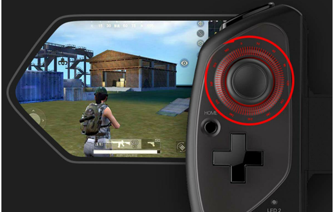
Figure 2.5: Close-up of the high-precision joystick, emphasizing its smooth operation and textured pole designed to prevent slipping during intense gameplay.

High-precision rocker, with very precise aim, equipped with texture pole to prevent skidding operation so as to be anti-killed.