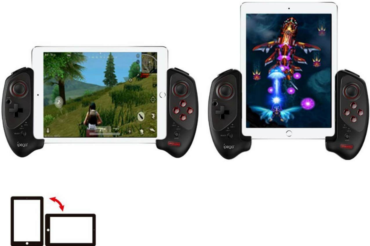
Figure 2.3: Illustration of the gamepad's ergonomic design for comfort and its support for both vertical and horizontal screen orientations for tablets.