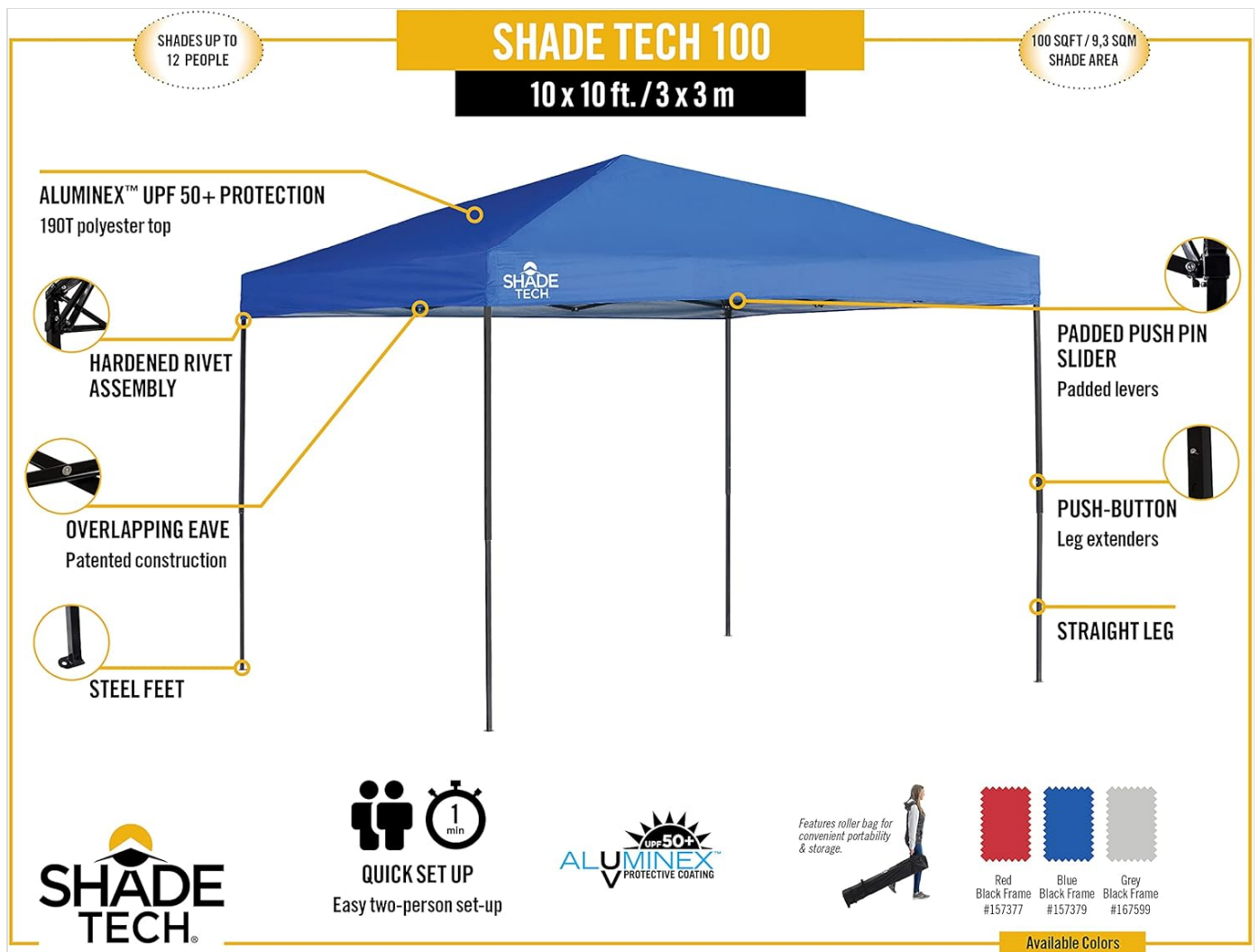
Figure 1: Key features of the Shade Tech 100 Instant Canopy.