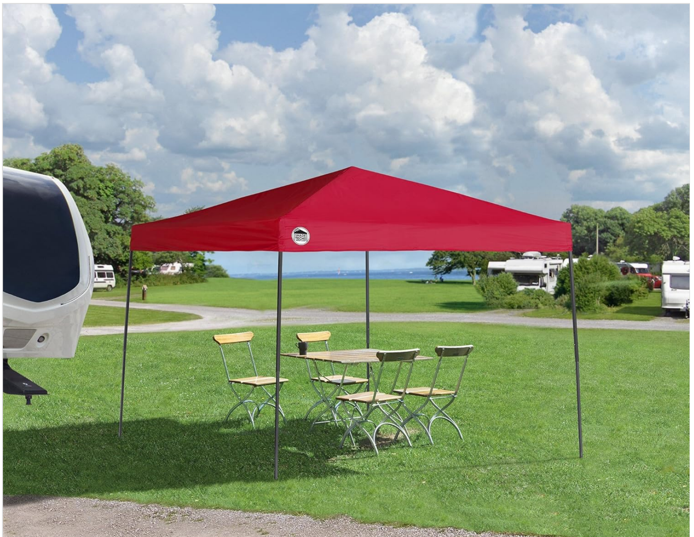
Figure 4: Canopy in use at an outdoor location.