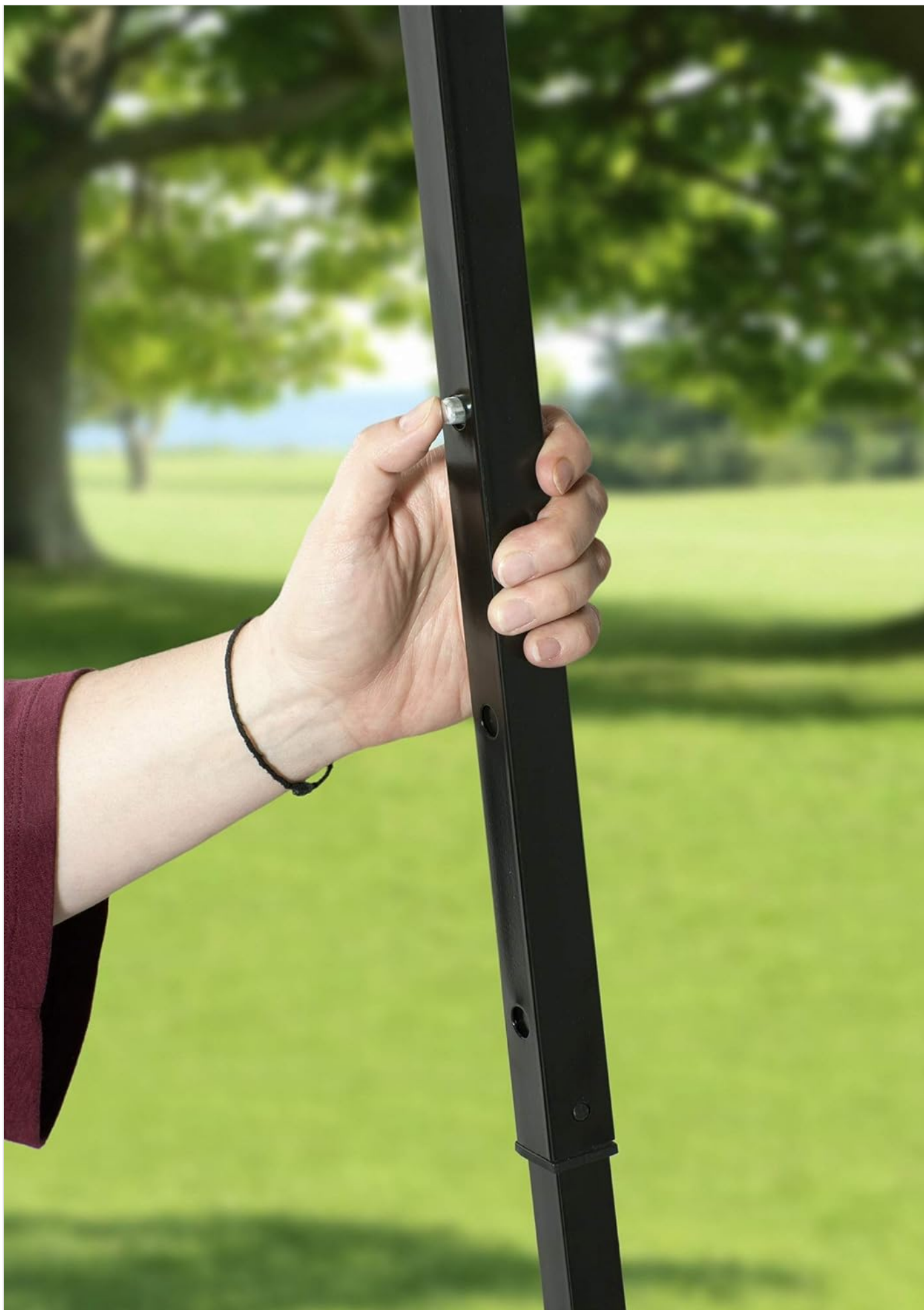
Figure 2: Adjusting leg height using the push-button slider.