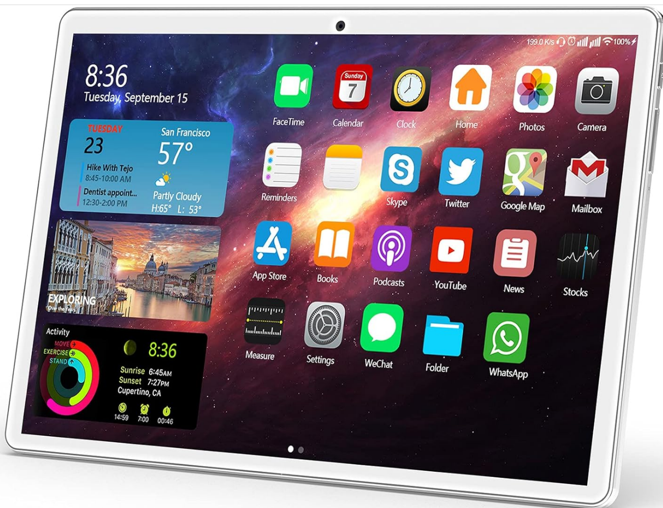
Figure 1: MEIZE 10.1 Inch Tablet

Thank you for choosing the MEIZE 10.1 Inch Tablet. This manual provides essential information for setting up, operating, and maintaining your device. Please read it carefully to ensure optimal performance and longevity of your tablet.