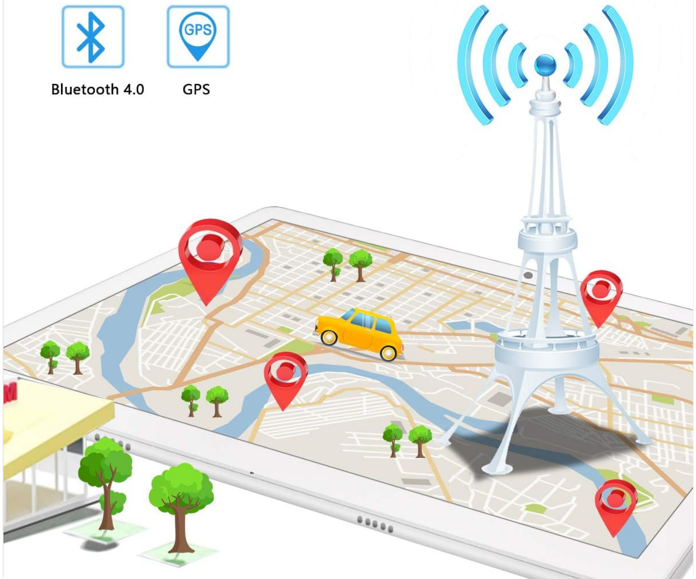
Figure 5: GPS and Bluetooth Functionality

This image illustrates the tablet's integrated GPS and Bluetooth 4.0 capabilities, showing a map with navigation points, indicating its utility for travel and connectivity with external devices.