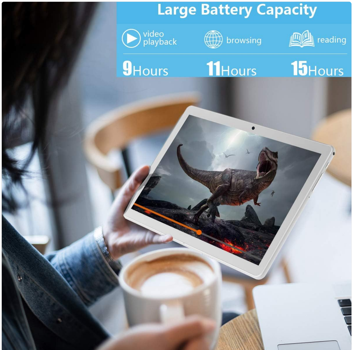
Figure 7: Extended Battery Life

This image highlights the tablet's large battery capacity, indicating approximately 9 hours of video playback, 11 hours of browsing, and 15 hours of reading on a single charge.