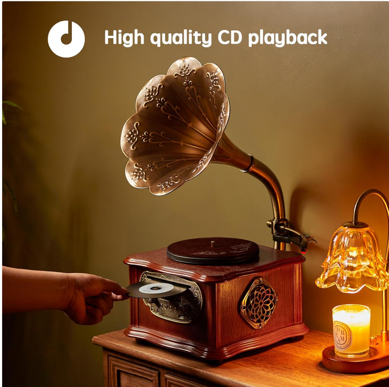
Figure 3: Inserting a CD into the self-intake CD player.