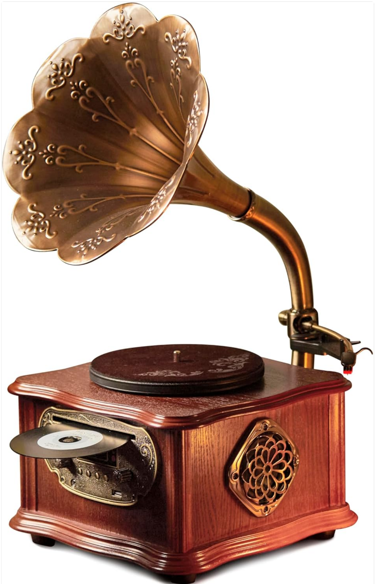
Figure 2: Phonograph ready for vinyl playback.