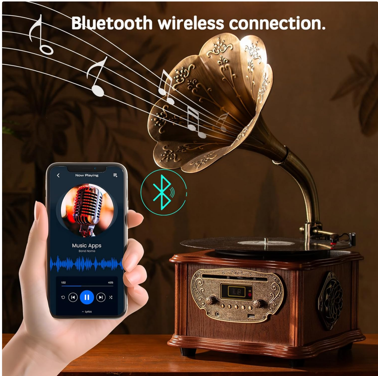
Figure 4: Wireless audio streaming via Bluetooth.