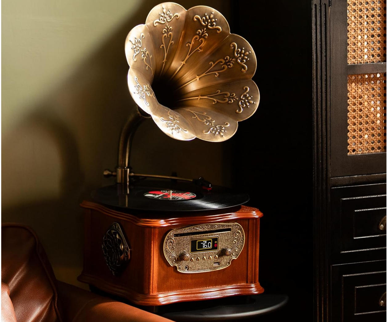
Figure 5: Enjoying FM radio programming.