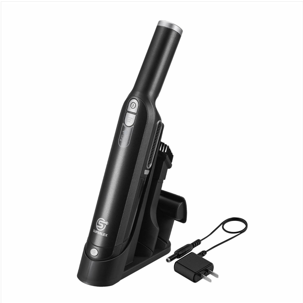
Figure 4.1: Main Unit of the SUPERLEX Cordless Handheld Vacuum Cleaner.