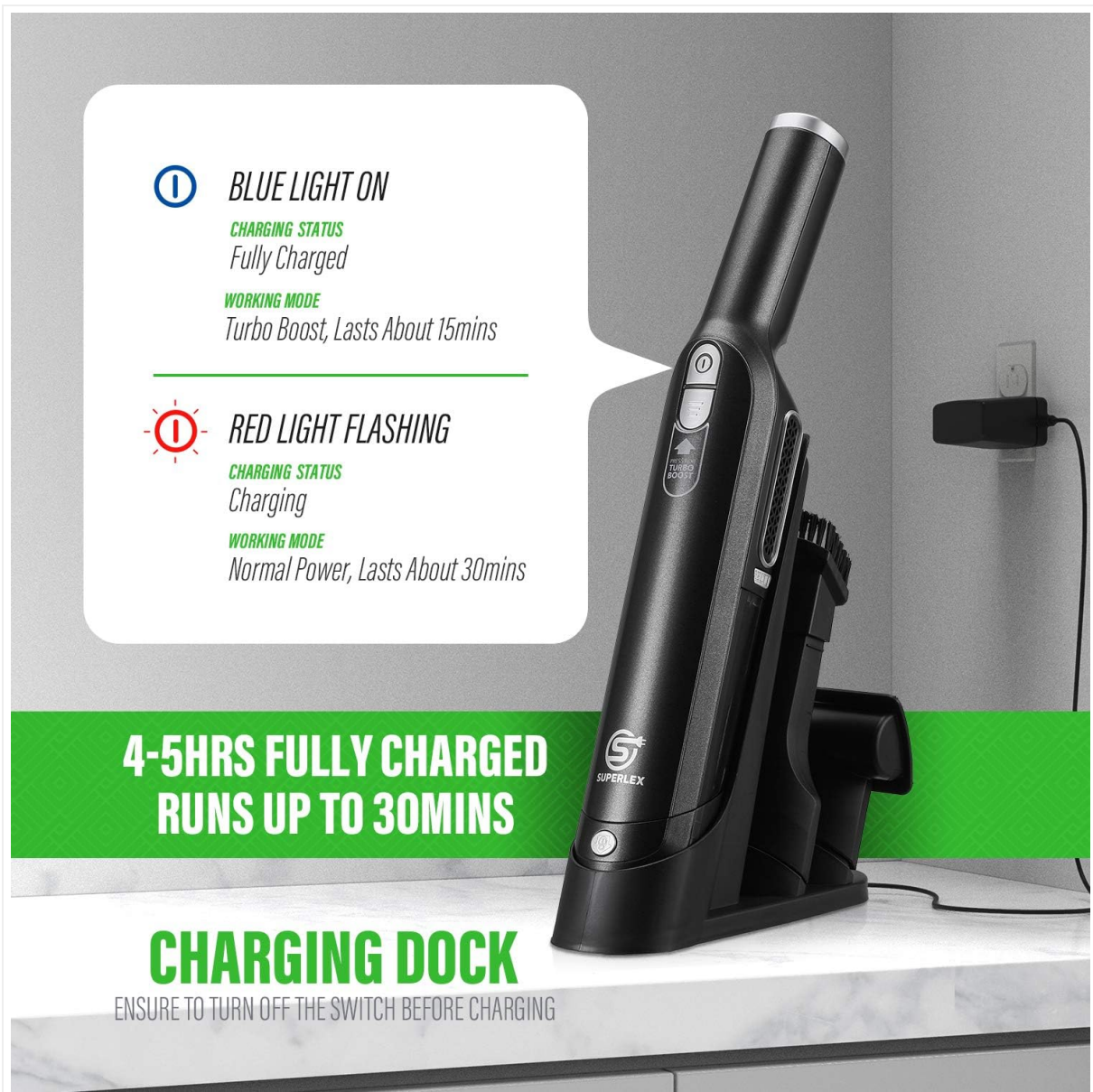
Figure 5.1: Charging the Vacuum Cleaner and Indicator Lights.