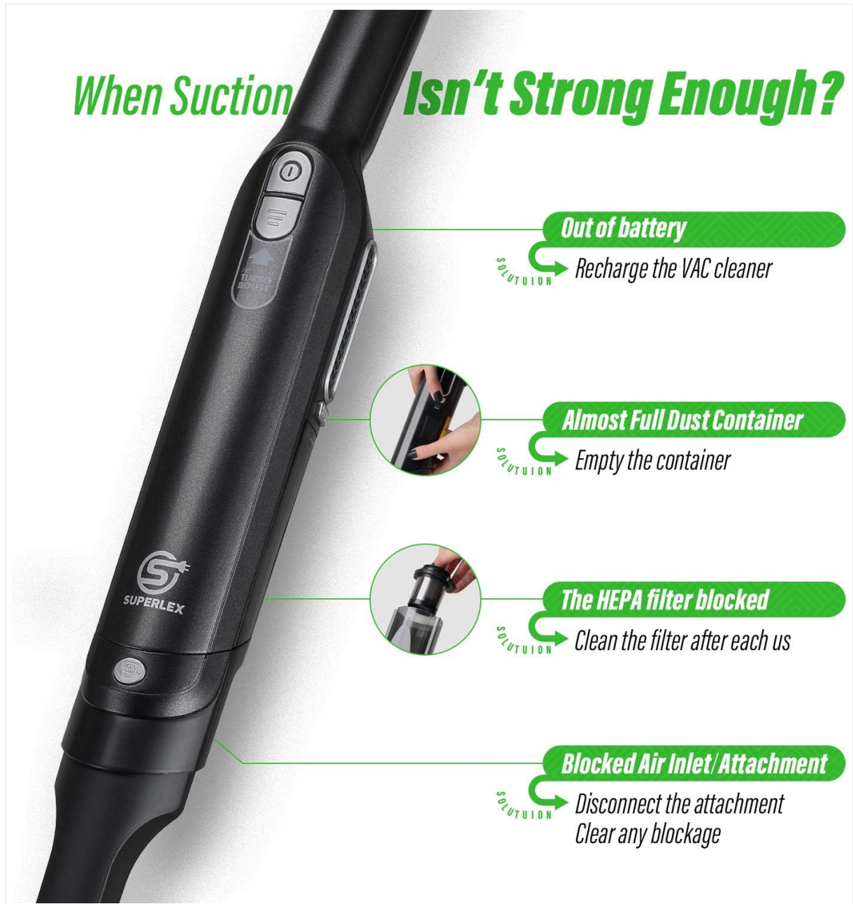
Figure 8.1: Troubleshooting Guide for Suction Issues.