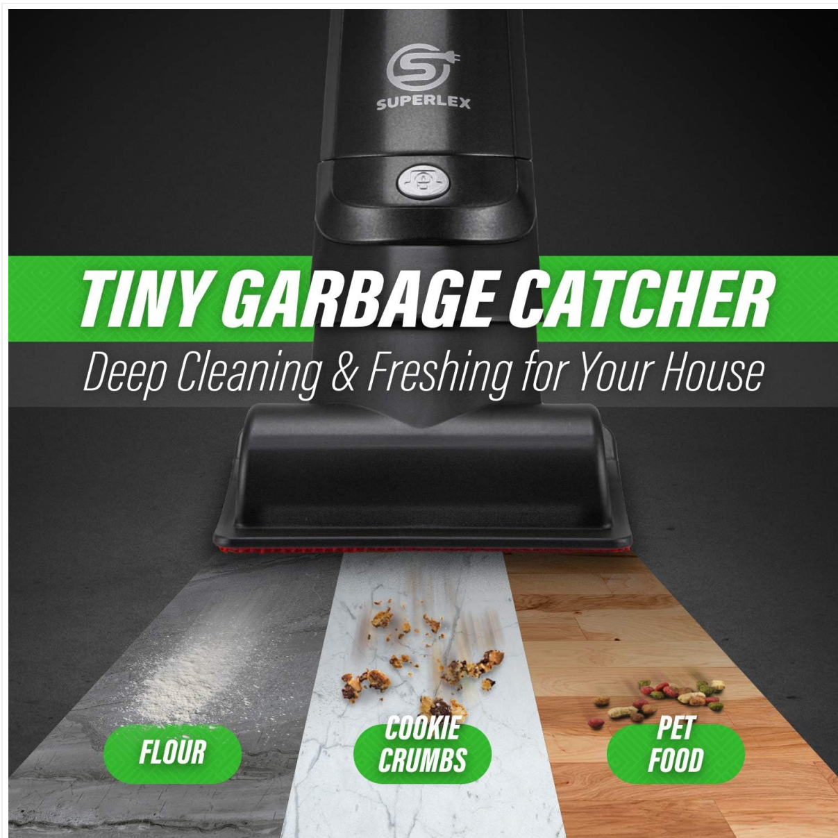
Figure 6.1: Effective Cleaning of Various Debris.