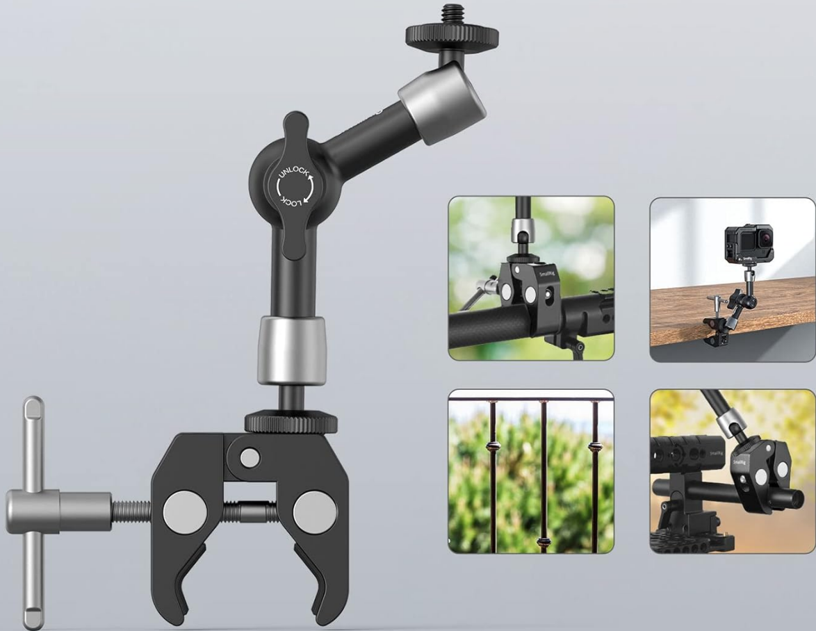
Figure 5: Examples of universal usage, demonstrating how the clamp and arm can be mounted on various objects.

Made of Aluminum Alloy, it could be mounted onto anything like cameras, lights, umbrellas, hooks, shelves, plate glass, crossbars, even other Super Clamps very stably.