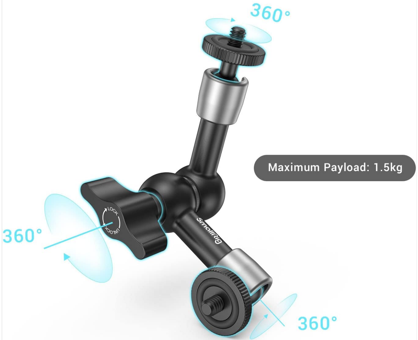
Figure 4: The Magic Arm's 360° rotation capability, allowing for flexible positioning.

Position can be adjusted according to your need via ergonomic wingnut.