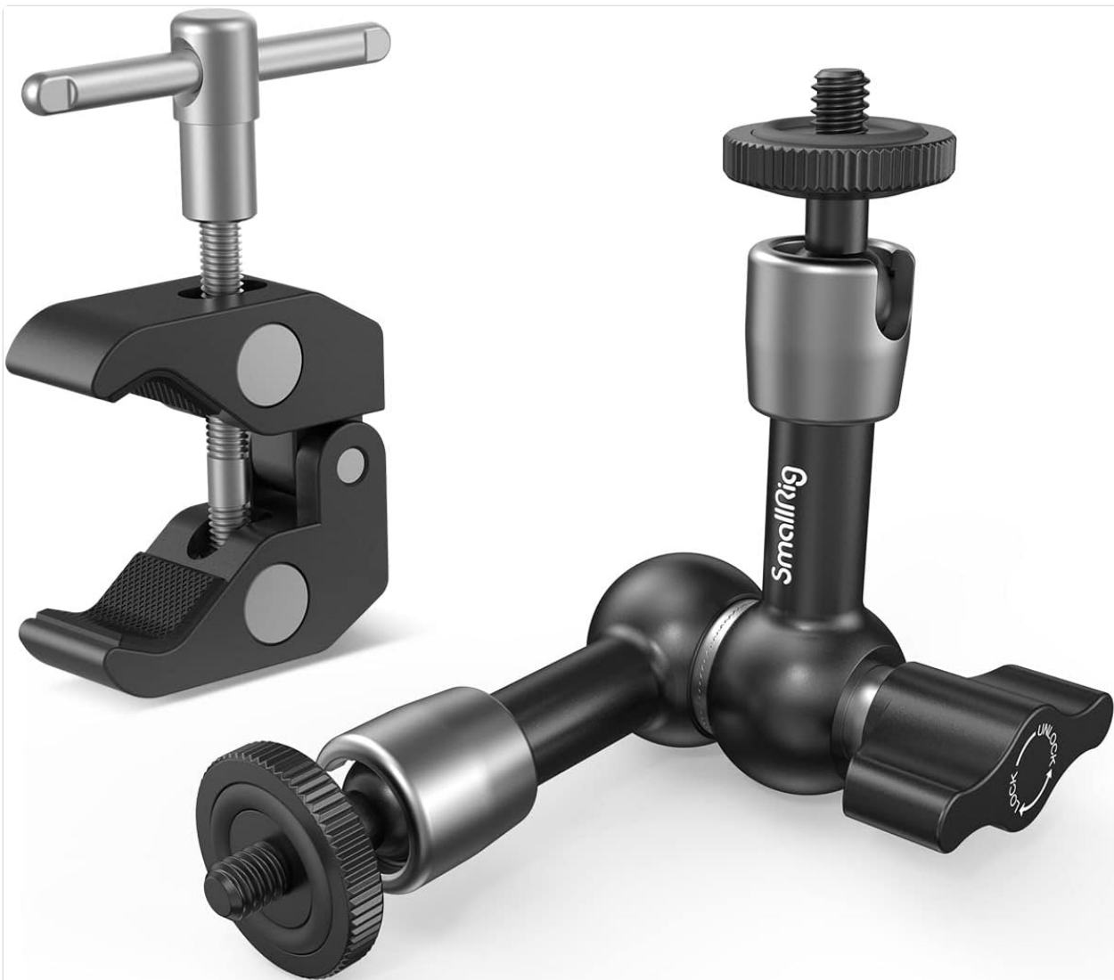
Figure 1: The SMALLRIG Super Clamp and Articulating Magic Arm.

The SMALLRIG Super Clamp with Articulating Magic Arm (Model KBUM2730-SR) is a versatile mounting solution designed for photographers, videographers, and content creators. It combines a robust super clamp with a flexible articulating arm, allowing for secure attachment and precise positioning of various accessories such as LCD monitors, LED lights, microphones, and cameras.