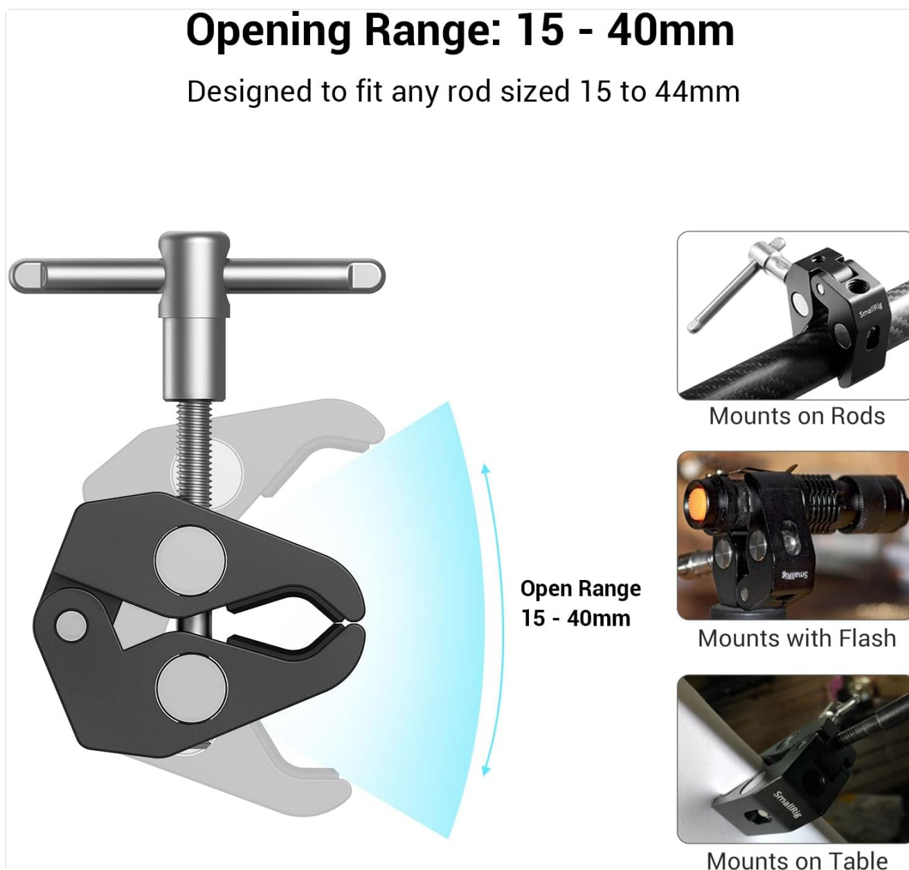
Figure 3: The Super Clamp's opening range (15-40mm) and examples of mounting on rods, with flash, and on a table.