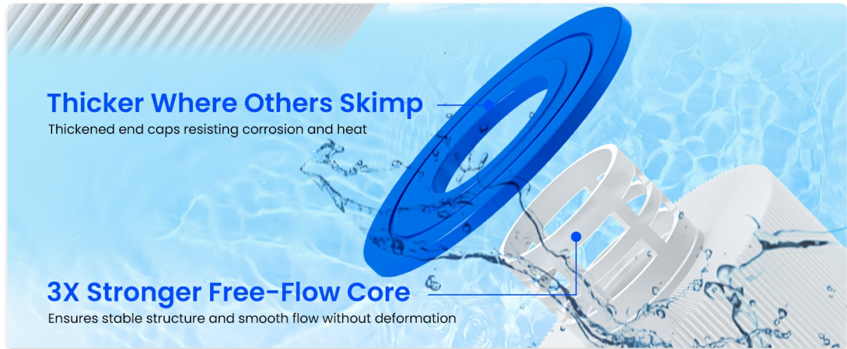
Image 3.3: Details on the robust construction of the filter cartridges.

Constructed with spunbond polyester and a strong inner core, these cartridges are designed to withstand high-pressure water flow and offer extended durability, ensuring a worthwhile investment for your pool maintenance.