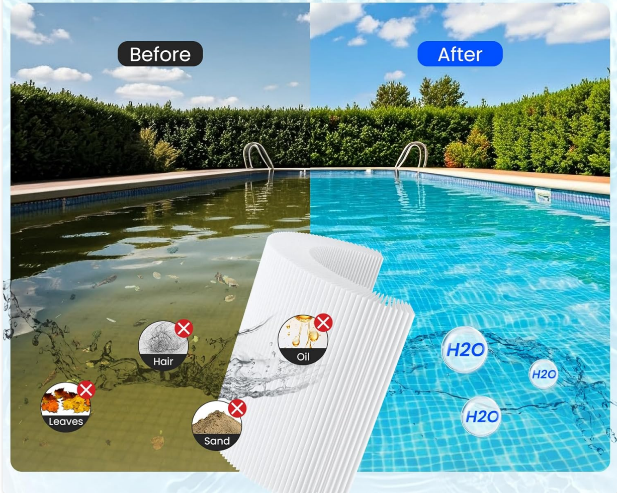
Image 5.1: Demonstration of improved water clarity after filtration.

Efficiently removes leaves, hair, sand, and oil for crystal-clear water.