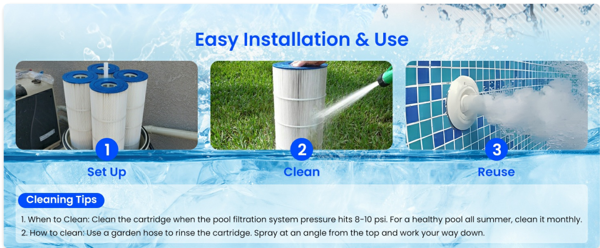
Image 4.1: Visual steps for filter cartridge setup, cleaning, and reuse.