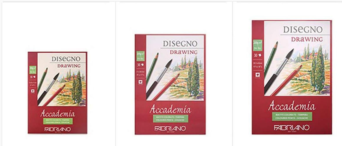
Figure 4.1: Various sizes of the Accademia Drawing Pad.