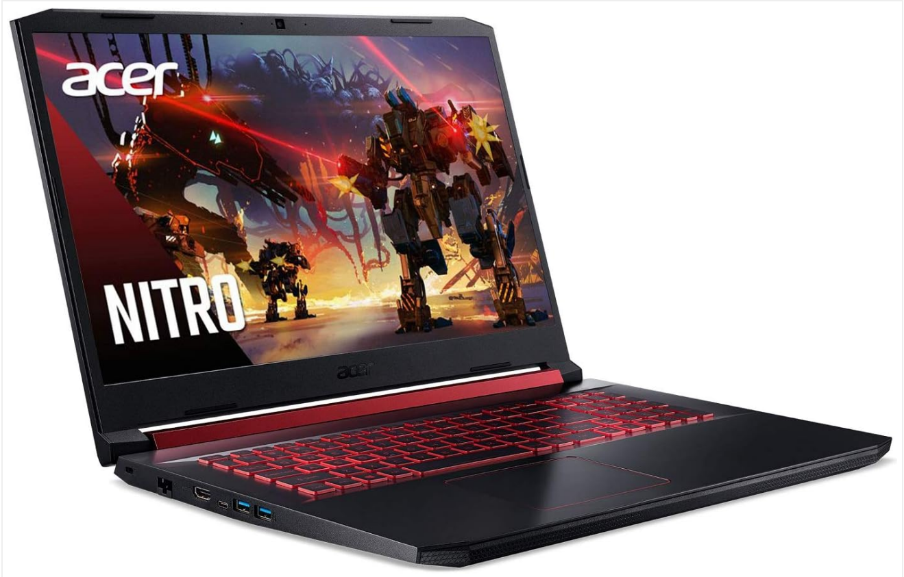
Figure 3.1: Backlit Keyboard with NitroSense Key

The laptop features a backlit keyboard for enhanced visibility in various lighting conditions.