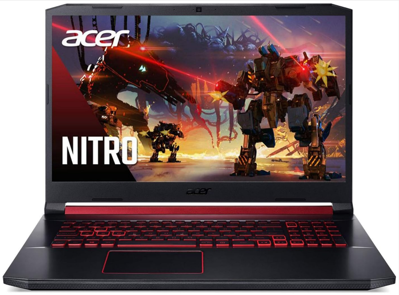
Figure 1.1: Acer Nitro 5 Gaming Laptop