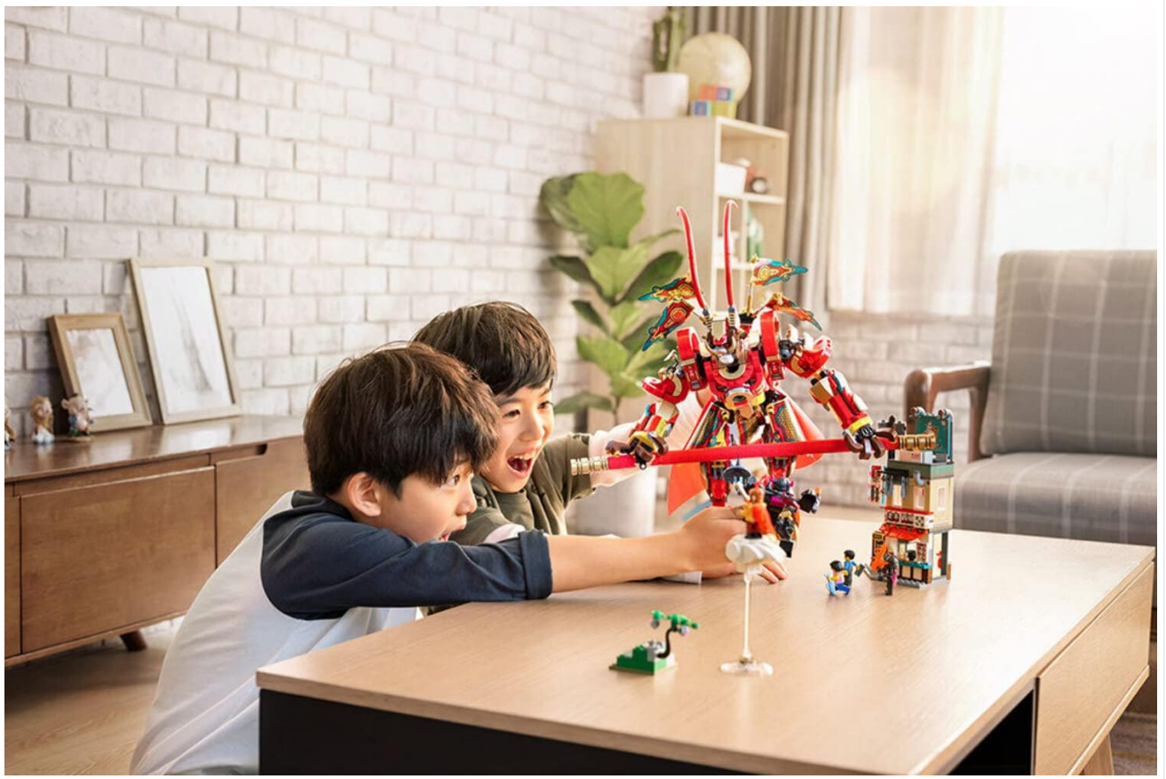
Image: Two children enthusiastically playing with the large Monkey King Mech, the noodle shop, and minifigures on a wooden table, demonstrating interactive play.