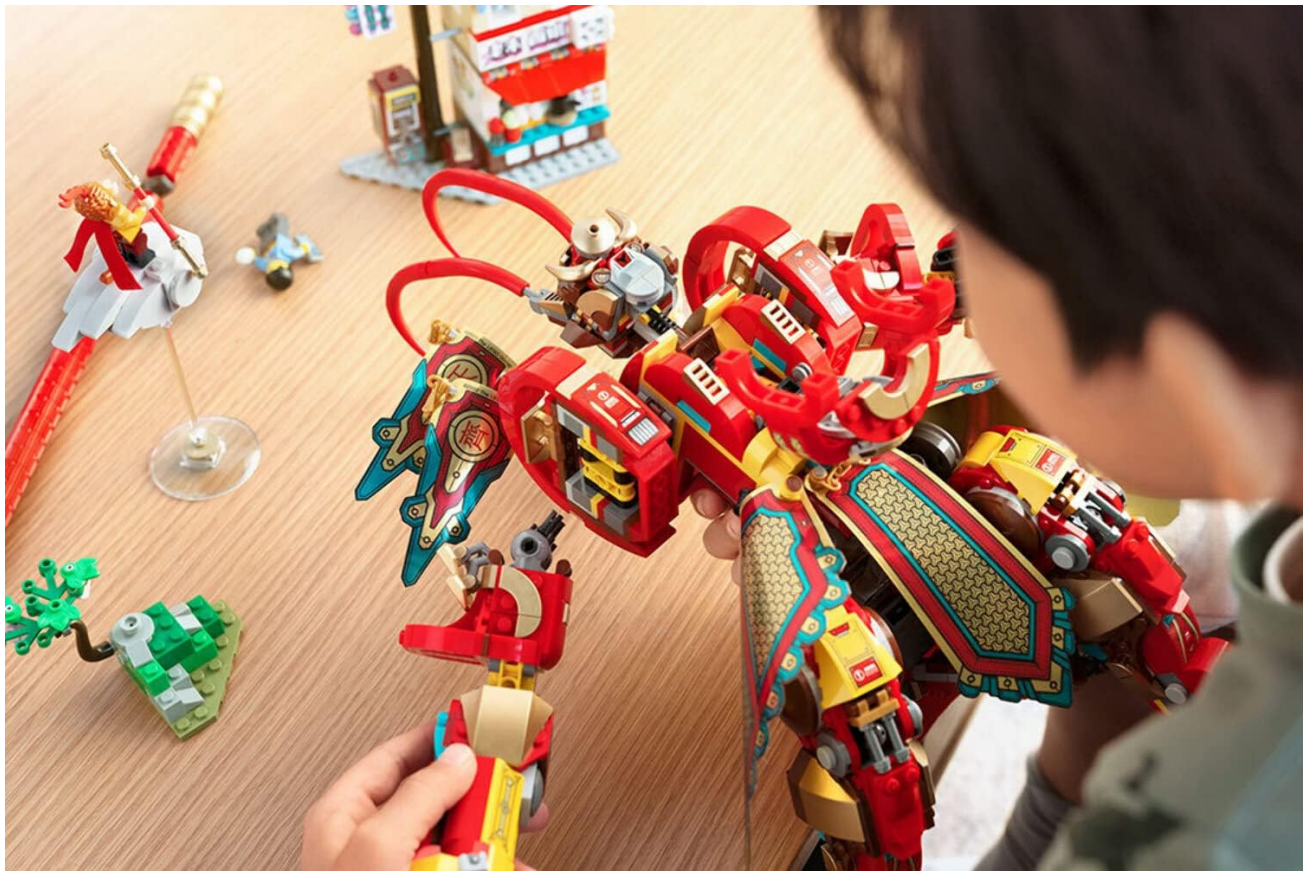
Image: A child's hands carefully assembling a section of the large red and gold Monkey King Mech, demonstrating the building process.