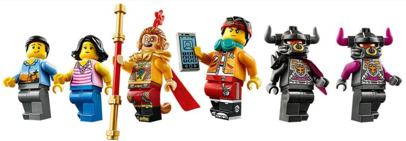
Image: A close-up view of the six minifigures included in the set: two civilians, Monkey King, Monk Kid, and two Bull Clones, each with unique accessories.