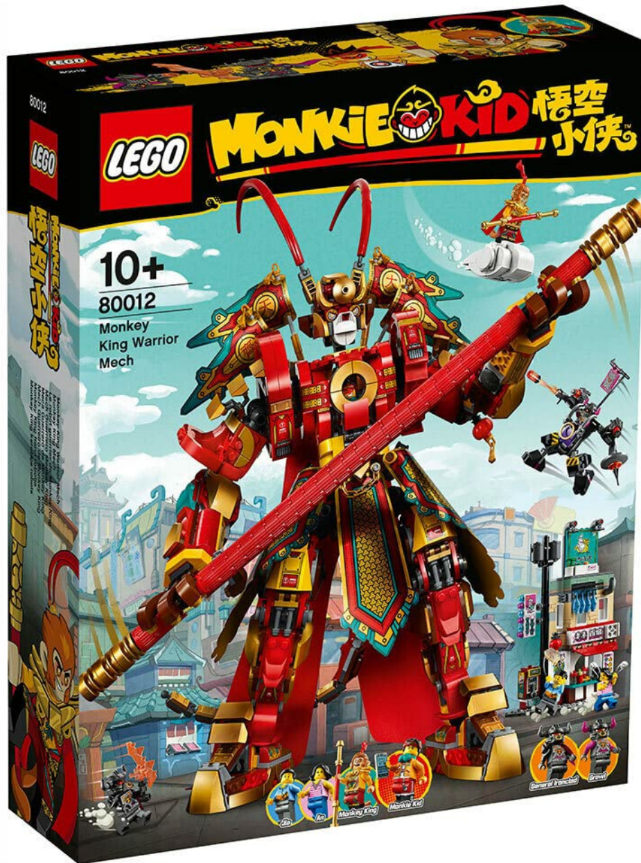
Image: The fully assembled LEGO 80012 Monkie Kid Monkey King Mech standing tall in a vibrant city backdrop, accompanied by other set elements and minifigures.