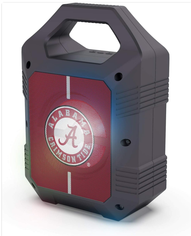
Figure 1: Front view of the SOAR ShockBox XL speaker, showcasing the Alabama Crimson Tide logo on the speaker grille with active LED lighting. The speaker features a sturdy handle for portability.