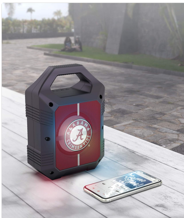
Figure 2: The SOAR ShockBox XL speaker positioned outdoors on a wooden surface, demonstrating its use with a smartphone connected via Bluetooth for music playback. The speaker's LED lights are subtly visible.