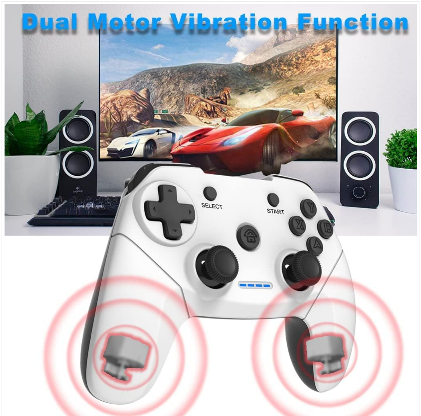
Image: Maegoo Wireless Game Controller with red circles indicating the location of the dual vibration motors within the grips.

The controller is equipped with dual motors that provide vibration feedback, enhancing your gaming immersion by simulating in-game events like impacts, explosions, and crashes.