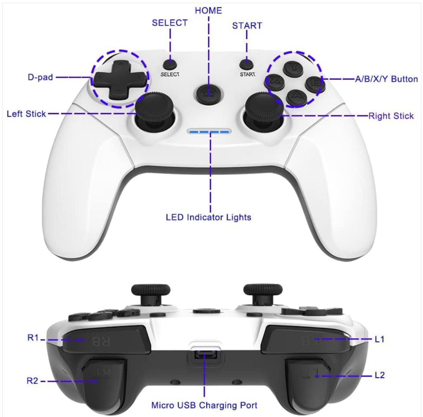
Image: Front and bottom view of the Maegoo Wireless Game Controller with labels for D-pad, Left Stick, Select, Home, Start, A/B/X/Y Buttons, Right Stick, LED Indicator Lights, R1, R2, L1, L2, and Micro USB Charging Port.