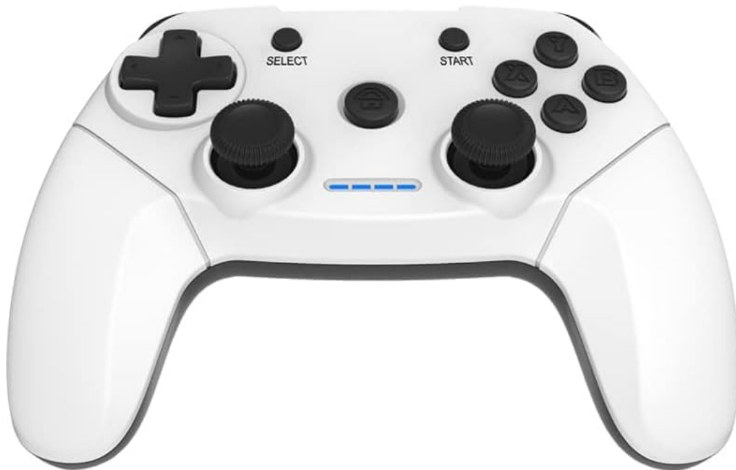
Image: Diagram illustrating the Maegoo Wireless Game Controller's 2.4G wireless connection to PC (Windows XP/7/8/10), PlayStation 3, and Android TV/TV Box.